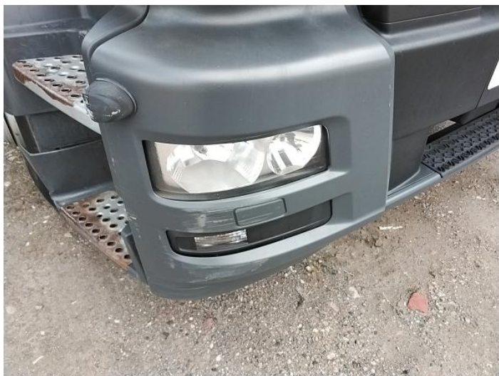
1: Bumper Front Scratched Over 100mm Thru Paint