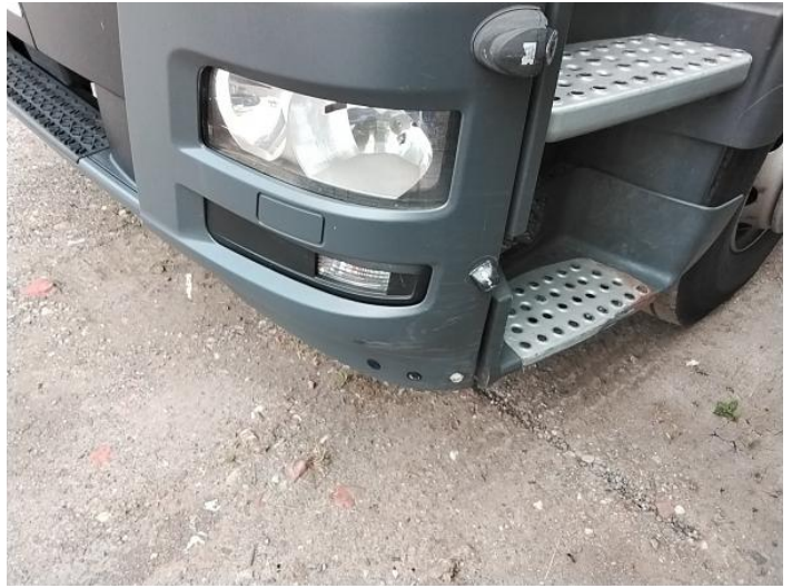
4: Bumper Front Scratched Over 100mm Thru Paint