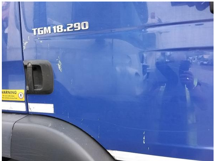
6: Door osf Scratched Over 25mm Thru Paint