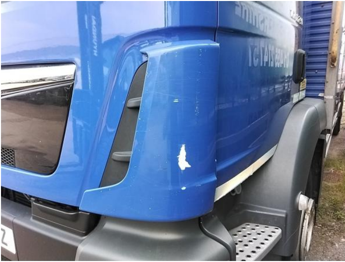
3: Panel Front Scratched Over 25mm Thru Paint