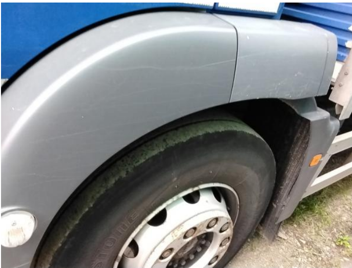
5: Wing nsf Scratched Over 25mm Thru Paint