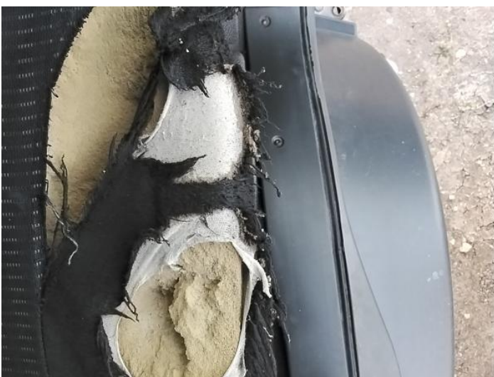
7: Seat Base Cover osf Holed Over 3mm