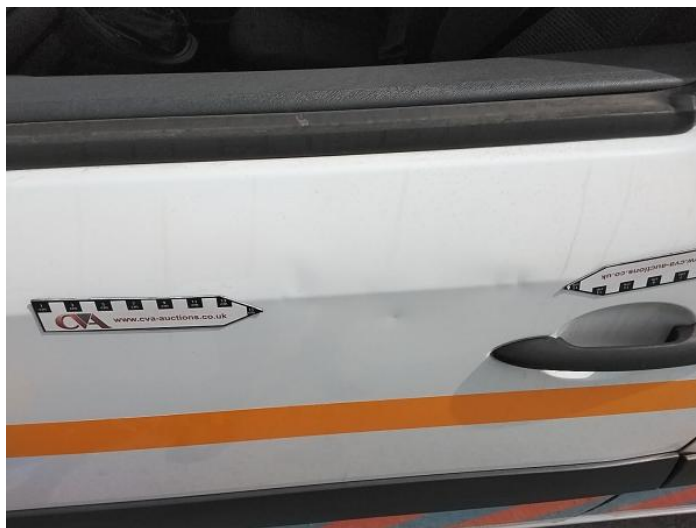
2: Door nsf Dented Over 30mm