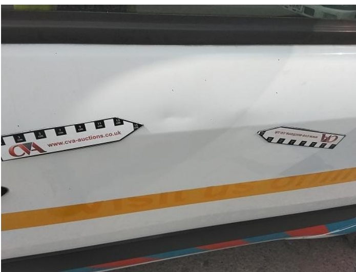
7: Door osf Dented Over 30mm