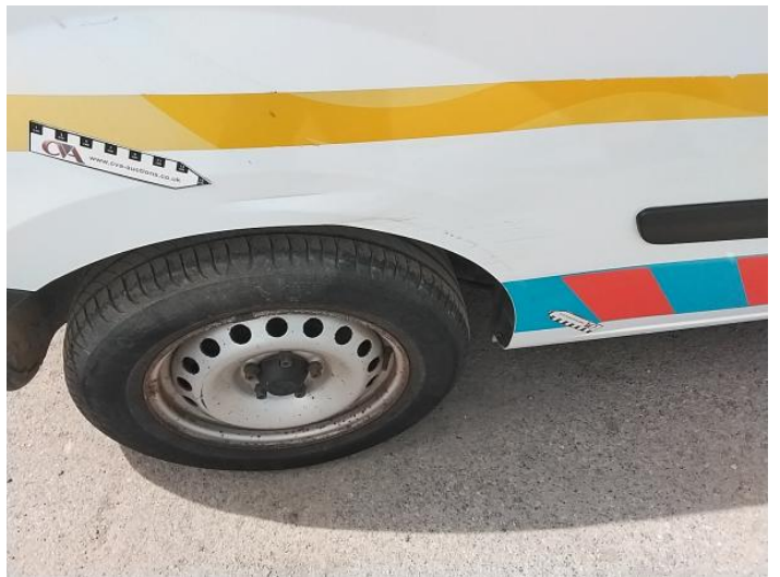
6: Qtr Panel osr Dented With Paint Damage