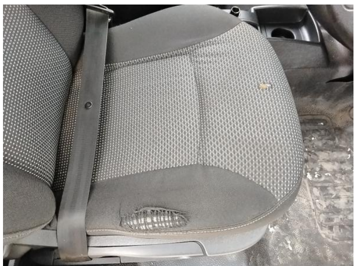
8: Seat Base Cover osf Holed Over 3mm