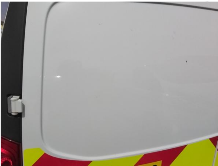
5: Door nsr Chipped Multiple Chips