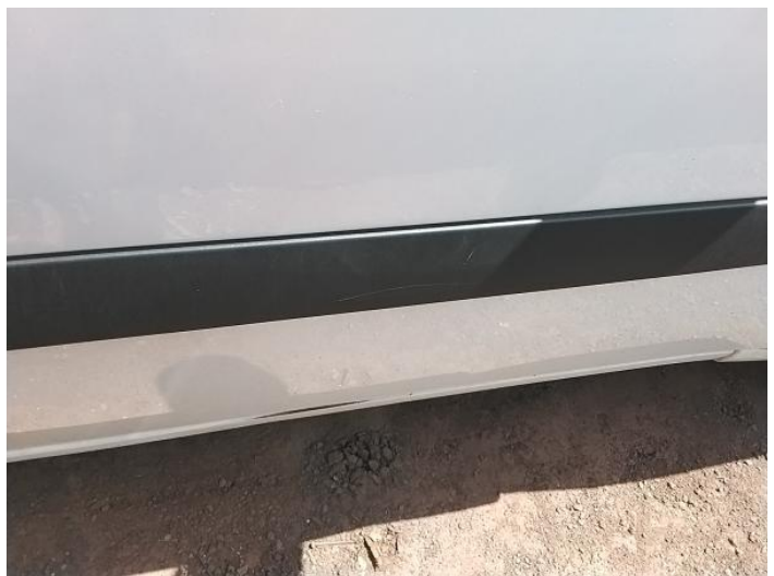
2: Door Moulding osf Scuffed (Unpainted) Over 100mm