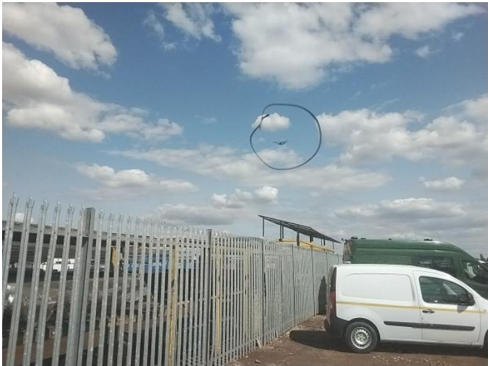
2: Screen Front Chipped Over 10mm