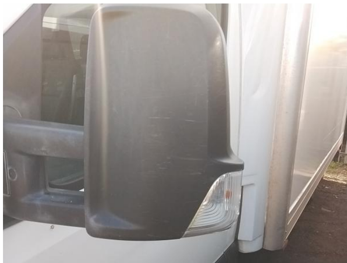
2: Door Mirror Assy nsf Scuffed (Unpainted) Over 100mm