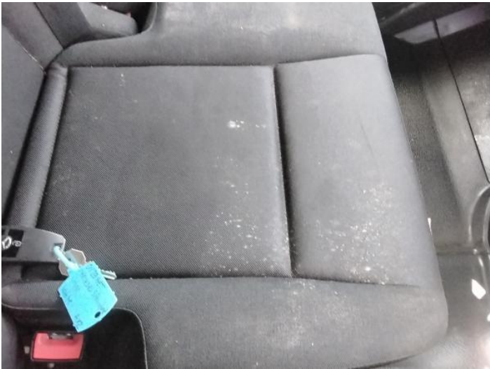
5: Seat Base Cover nsf Soiled Heavy