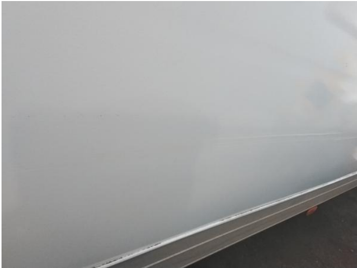
4: Qtr Panel osr Scratched Over 25mm Thru Paint