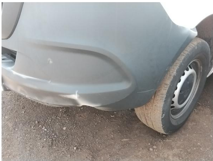
1: Bumper Front Dented With Paint Damage