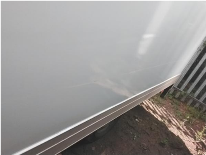
3: Qtr Panel nsr Scratched Over 25mm Thru Paint