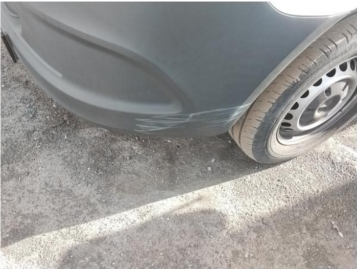
1: Bumper Front Scratched Over 100mm Thru Paint