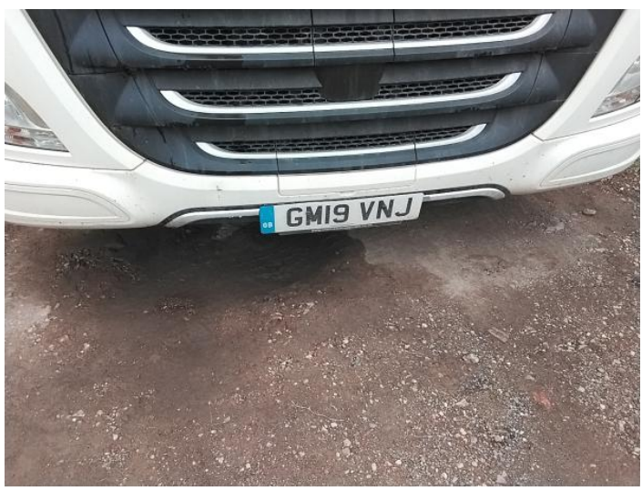
2: Bumper Front Chipped Multiple Chips