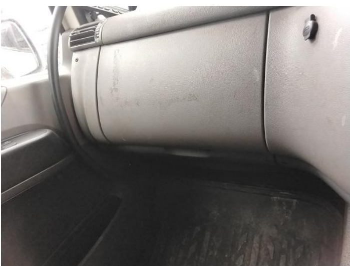
6: Fascia Panel Soiled Heavy