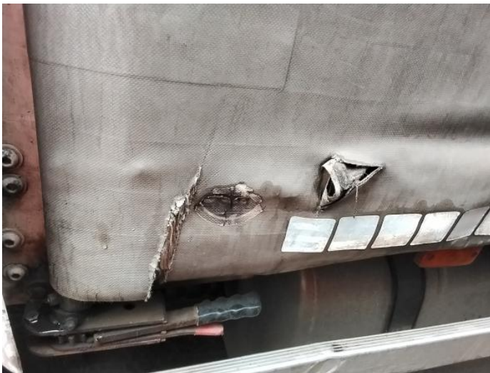
4: Qtr Panel nsr Hole Over 10mm