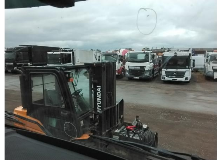
5: Screen Front Chipped Over 10mm