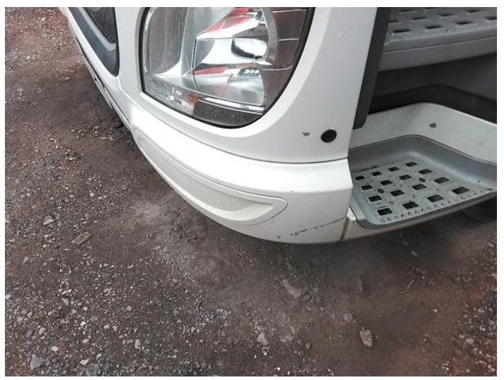
3: Bumper Front Scratched Over 100mm Thru Paint