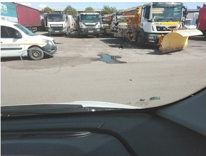
7: Screen Front Chipped Over 10mm