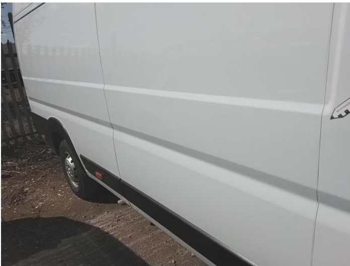
5: Qtr Panel osr Scratched Over 25mm Not Thru Paint