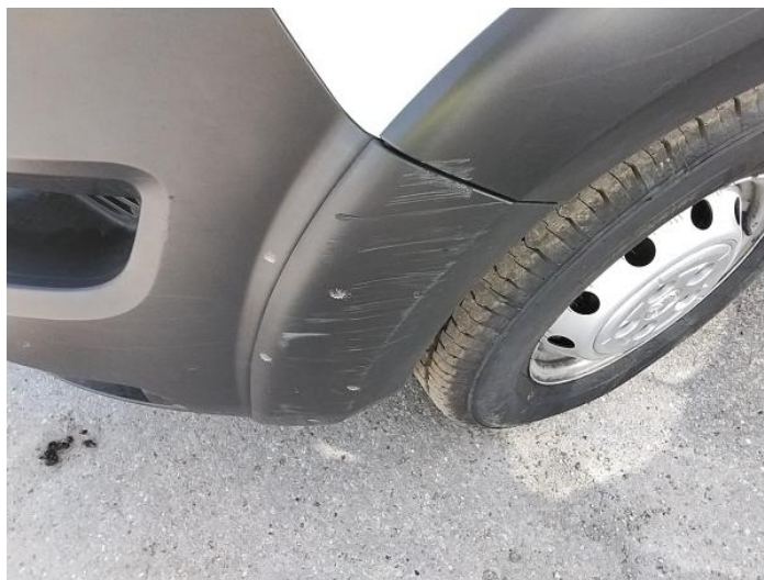
2: Bumper Front Moulding Scuffed (Unpainted) Over 100mm