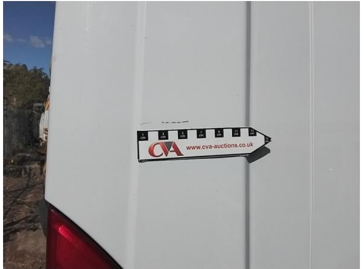
4: C Post os Scratched Over 25mm Thru Paint