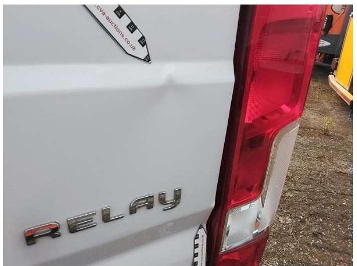
8: Door osr Dented Over 30mm