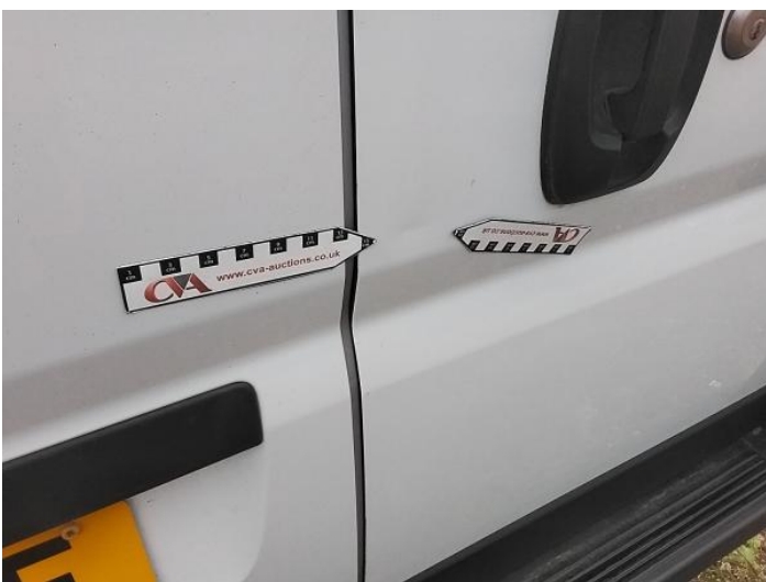
7: Door osr Dented Over 30mm