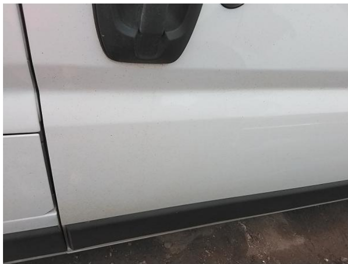
2: Qtr Panel nsr Chipped Multiple Chips