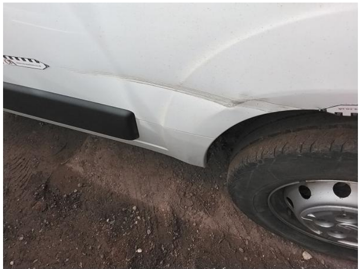
6: Qtr Panel nsr Dented With Paint Damage