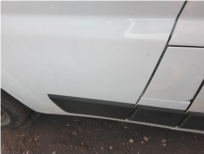
3: Door nsf Chipped Multiple Chips