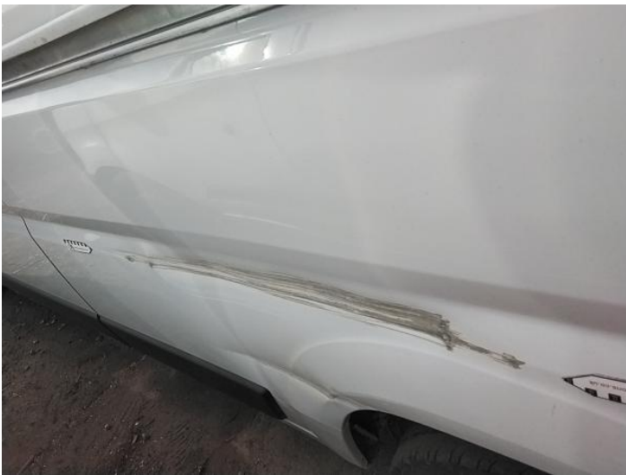
5: Qtr Panel nsr Dented With Paint Damage