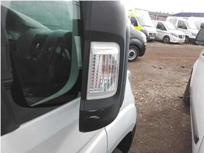
9: Door Mirror Assy osf Scuffed (Unpainted) UpTo 100mm