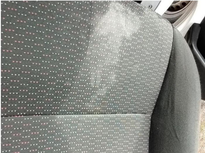
10: Seat Base Cover osf Soiled Heavy