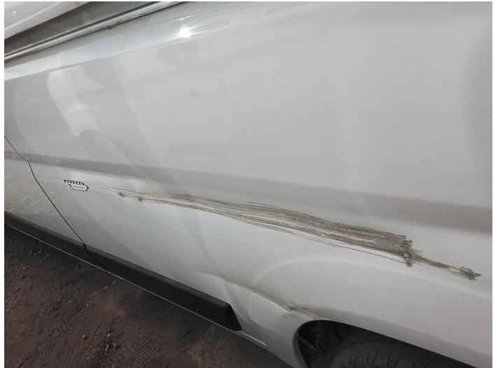
4: Qtr Panel nsr Chipped Multiple Chips