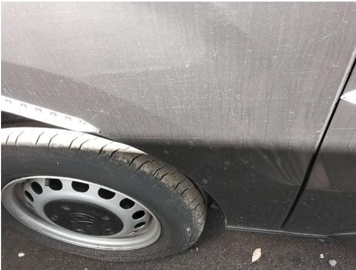
11: Qtr Panel osr Scratched Over 25mm Thru Paint