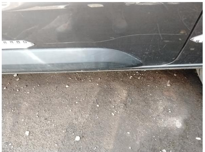
8: Qtr Panel nsr Scratched Over 25mm Thru Paint