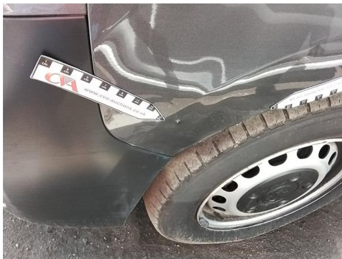
2: Wing nsf Dented With Paint Damage