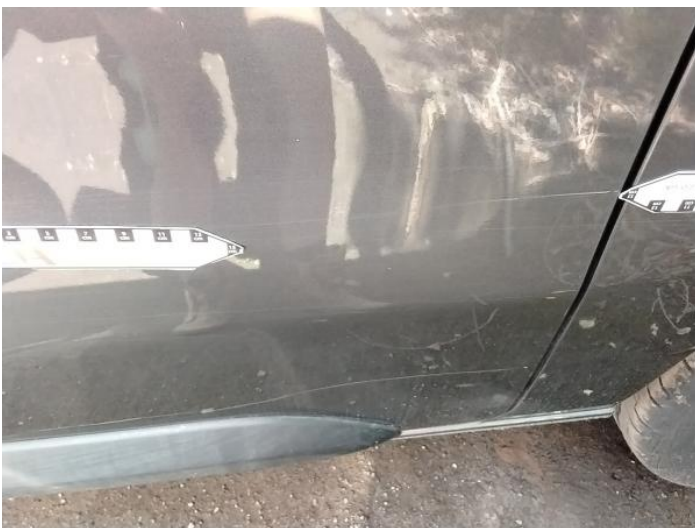
7: Qtr Panel nsr Scratched Over 25mm Thru Paint