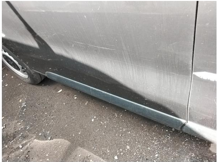
12: Qtr Panel osr Scratched Over 25mm Thru Paint