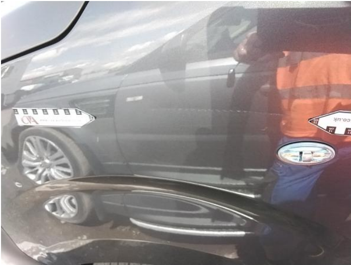
3: Wing nsf Dented With Paint Damage