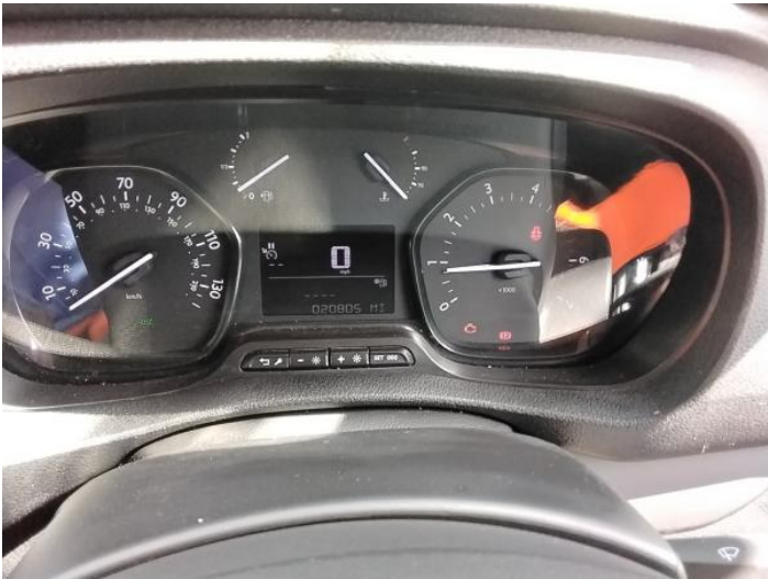
17: Dash Warning Lights Displayed No Action