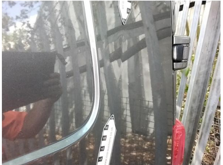
10: Qtr Panel nsr Dented Over 30mm