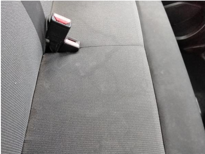
16: Seat Base Cover nsf Soiled Heavy