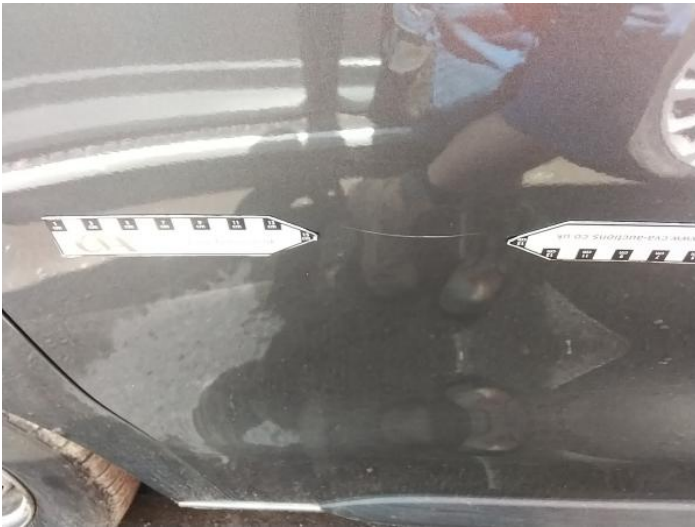
5: Door nsf Scratched Over 25mm Thru Paint