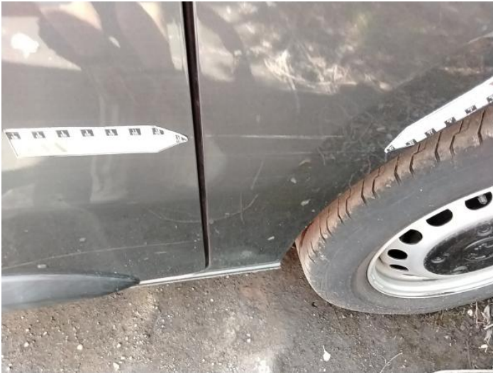
9: Qtr Panel nsr Scratched Over 25mm Thru Paint