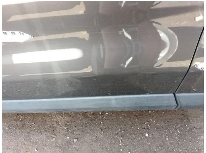
6: Door nsf Scratched Over 25mm Thru Paint