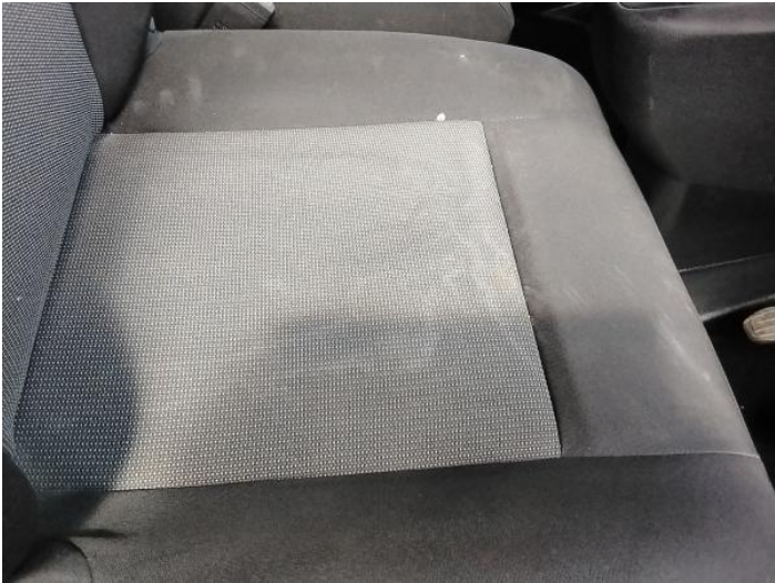
15: Seat Base Cover osf Soiled Heavy