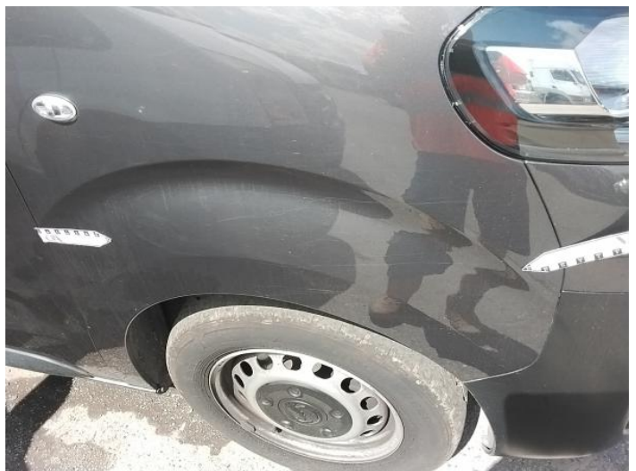
14: Wing osf Scratched Over 25mm Not Thru Paint