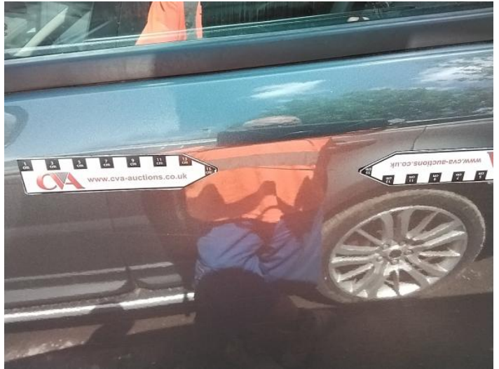
4: Door nsf Scratched Over 25mm Thru Paint