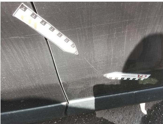
13: Door osf Scratched Over 25mm Thru Paint