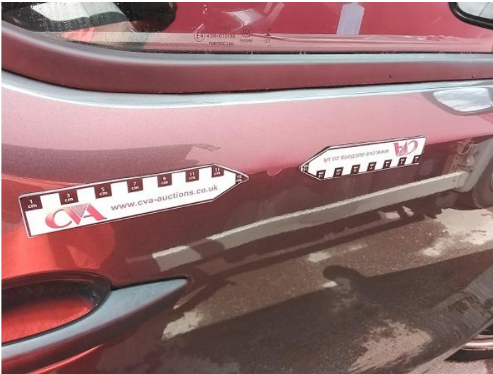
5: Door osf Dented Over 30mm