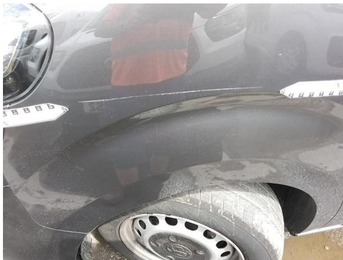
2: Wing nsf Scratched Over 25mm Thru Paint