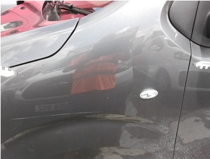
3: Wing nsf Scratched Over 25mm Thru Paint