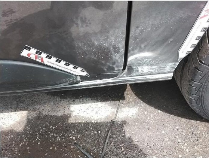
4: Qtr Panel nsr Dented With Paint Damage