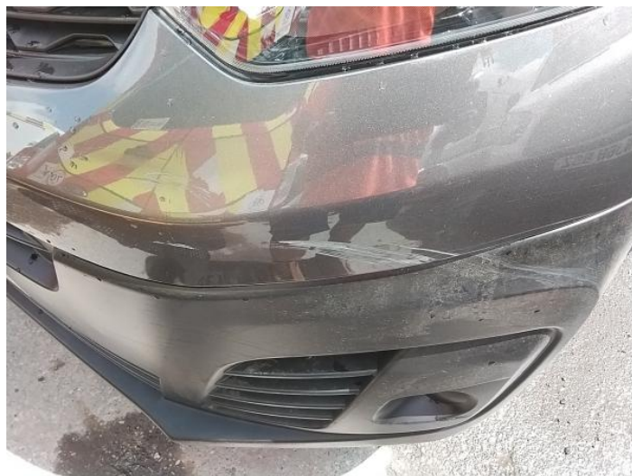
1: Panel Front Scratched Over 25mm Thru Paint