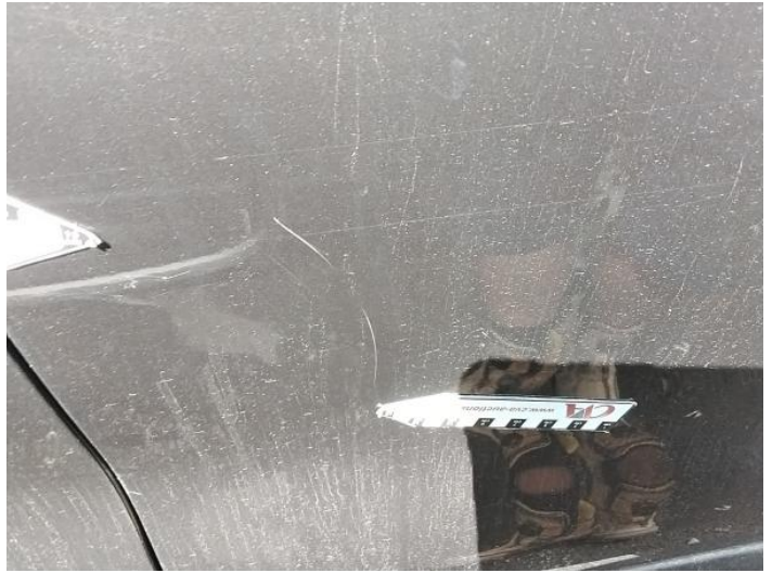
4: Door osf Scratched Over 25mm Thru Paint