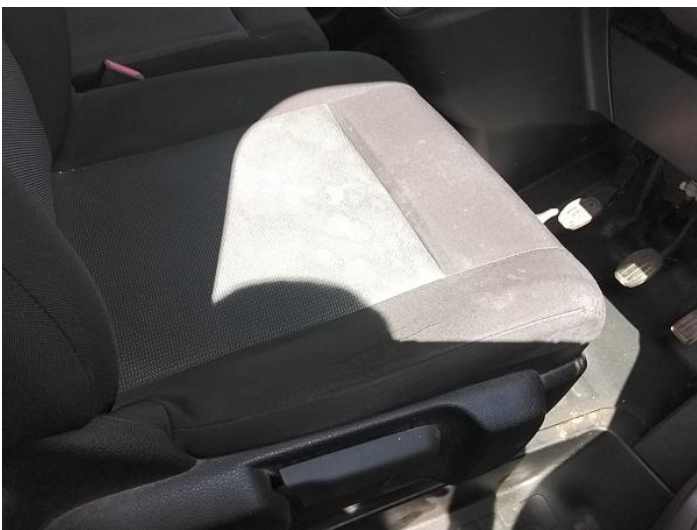
7: Seat Base Cover osf Soiled Heavy