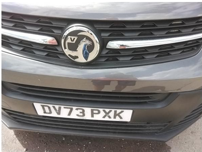
1: Panel Front Chipped Multiple Chips