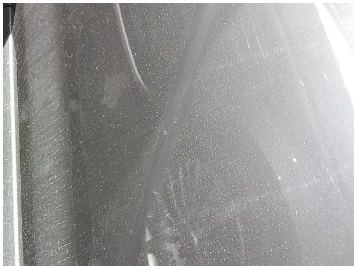
6: Door osf Scratched Over 25mm Not Thru Paint