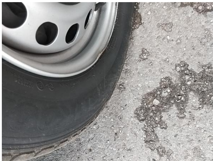
2: Wheel nsf Dented Over 30mm (Steel)