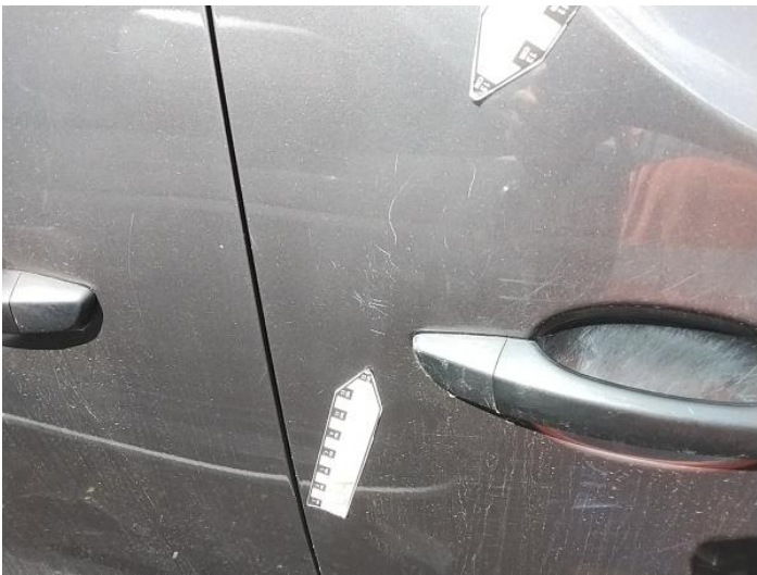
5: Door osf Scratched Over 25mm Thru Paint