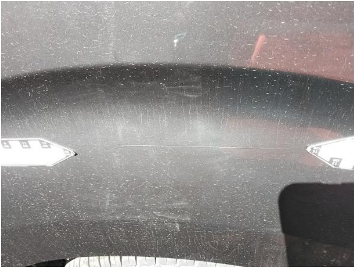
3: Qtr Panel osr Scratched Over 25mm Thru Paint