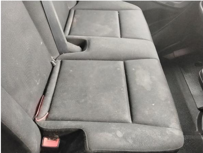
40: Seat Base Cover nsf Soiled Heavy