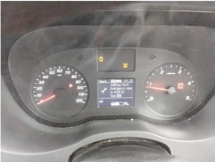
41: Dash Warning Lights Displayed No Action