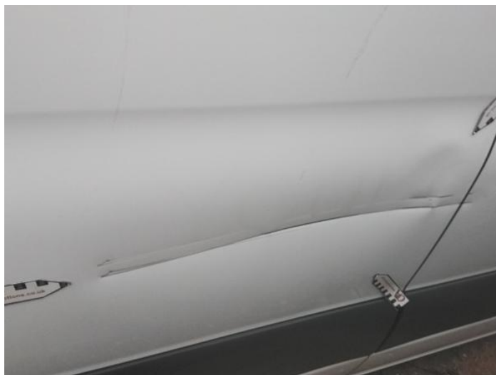
28: Qtr Panel osr Dented With Paint Damage