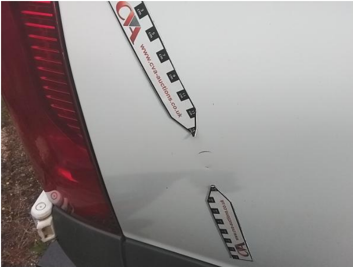
21: Qtr Panel osr Dented With Paint Damage