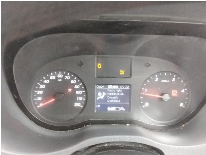
42: Dash Warning Lights Displayed No Action