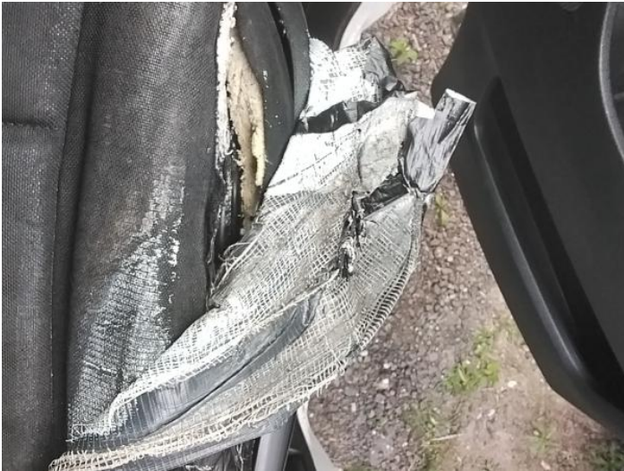
39: Seat Base Cover osf Holed Over 3mm