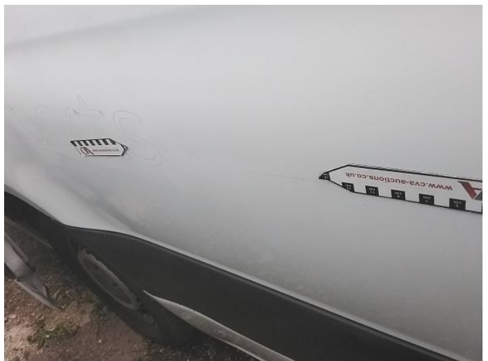
8: Qtr Panel nsr Dented Over 30mm