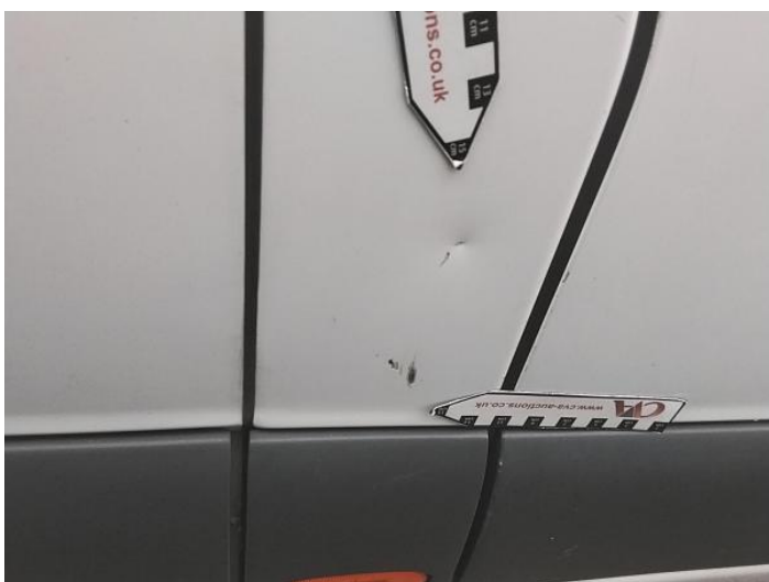
29: C Post os Dented With Paint Damage