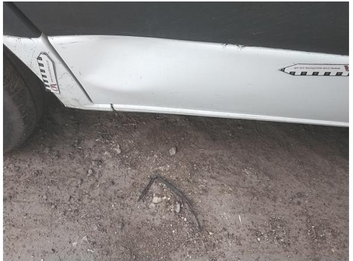
6: Door nsf Dented Over 30mm