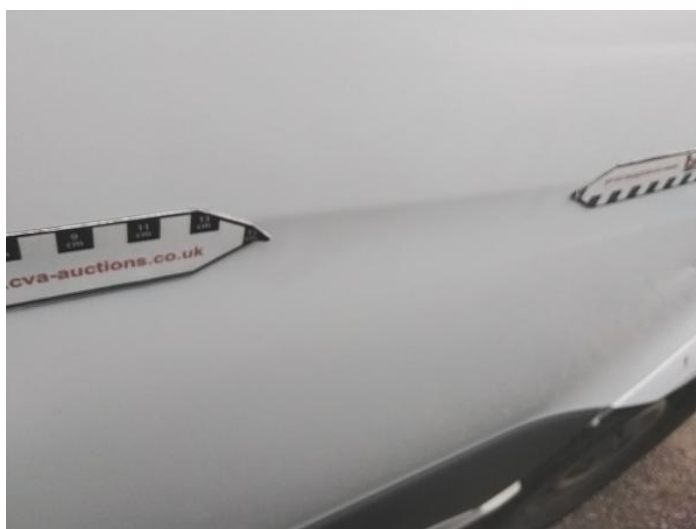
30: Door osf Dented Over 30mm