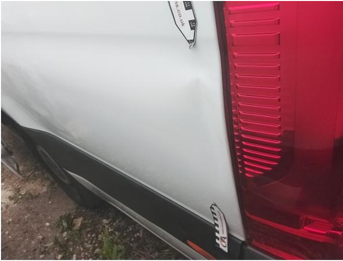
9: Qtr Panel nsr Dented Over 30mm