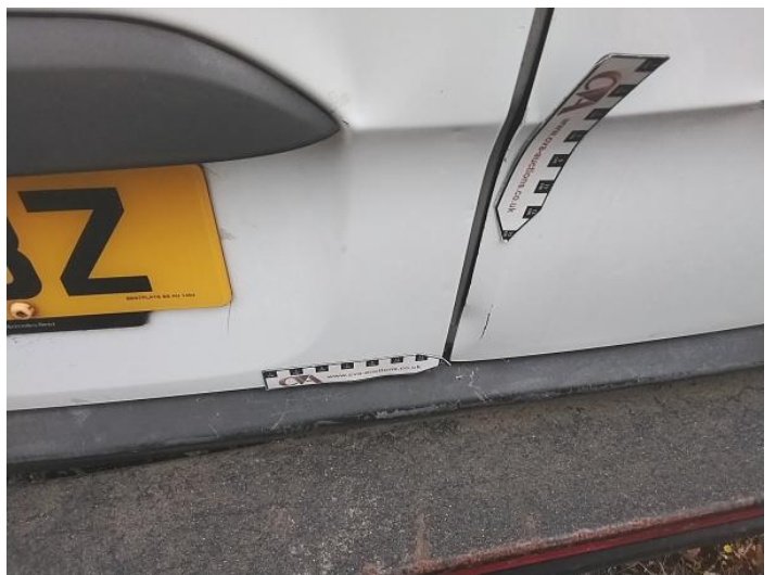
14: Door osr Dented With Paint Damage