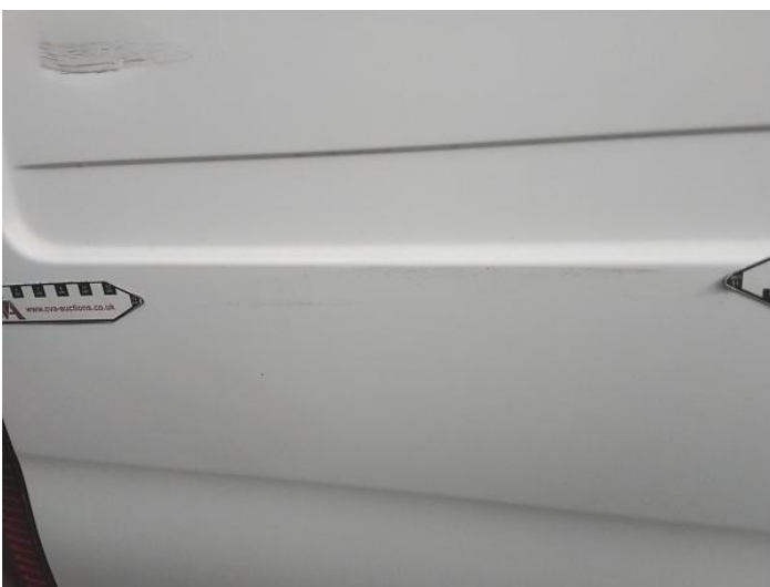
19: Qtr Panel osr Scratched Over 25mm Thru Paint