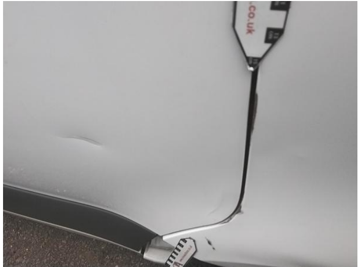
34: Wing osf Dented With Paint Damage