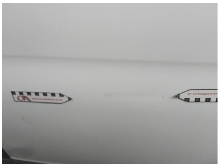
20: Qtr Panel osr Dented With Paint Damage