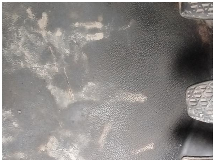
38: Carpets Front Torn Over 10mm