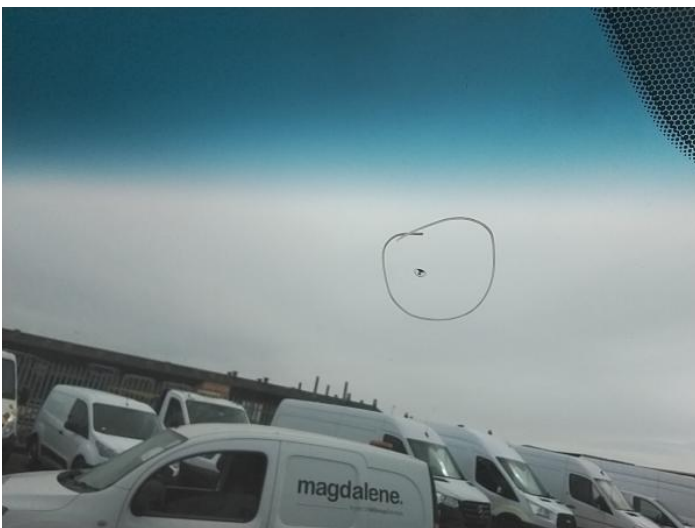
37: Screen Front Chipped UpTo 10mm