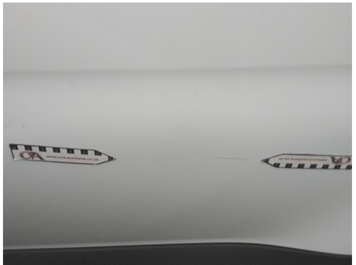
24: Qtr Panel osr Scratched Over 25mm Thru Paint