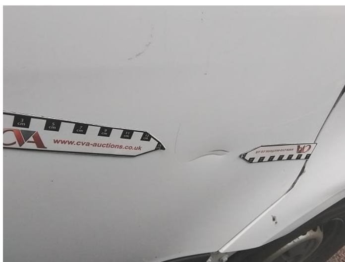
32: Door osf Dented With Paint Damage