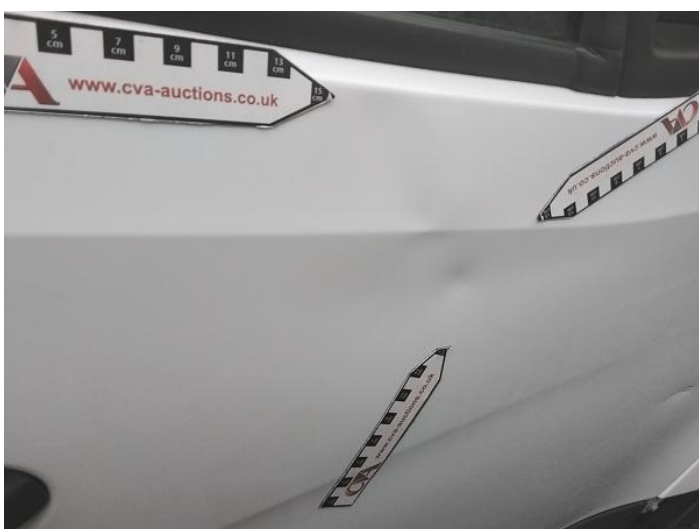
31: Door osf Dented Over 30mm