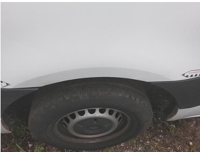
25: Qtr Panel osr Scratched Over 25mm Thru Paint