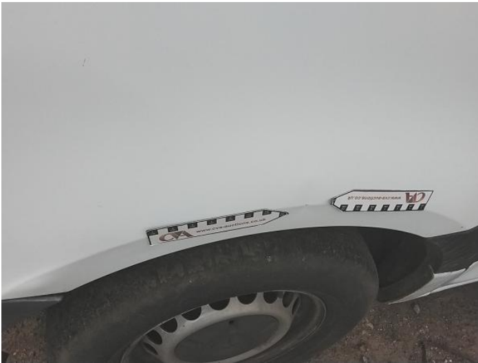
5: Wing nsf Dented Over 30mm