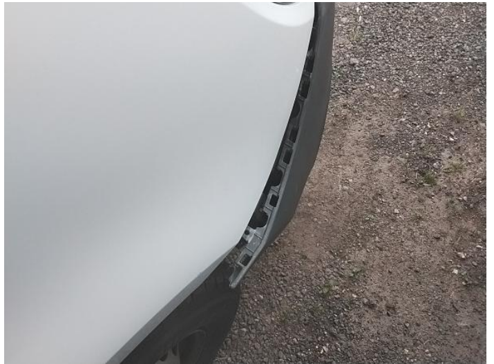
36: Bumper Front Insecure Action Required