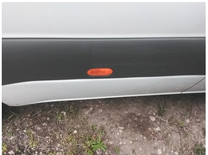
26: Qtr Panel Moulding os Scuffed (Unpainted) Over 100mm