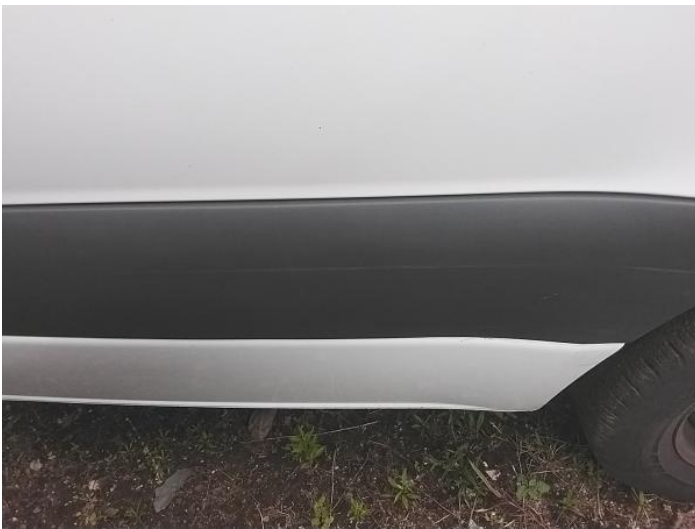
23: Qtr Panel Moulding os Scuffed (Unpainted) Over 100mm