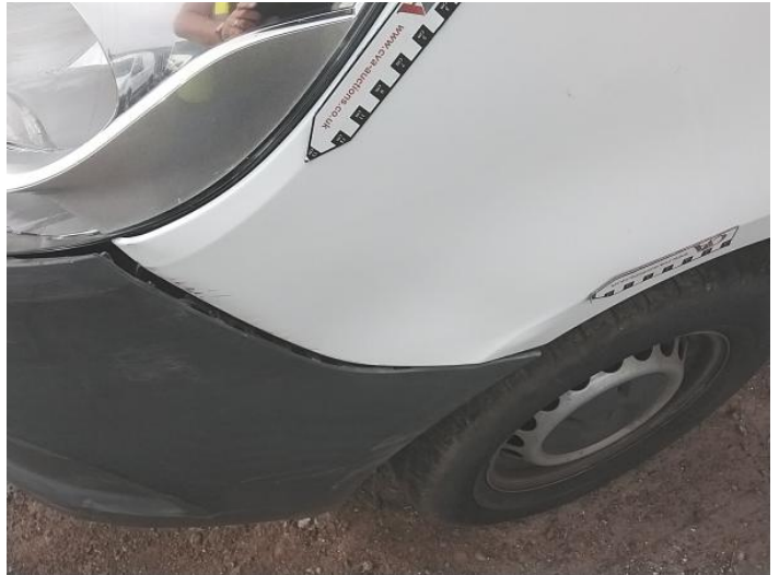
4: Wing nsf Dented Over 30mm