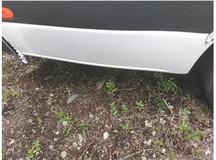
22: Qtr Panel osr Scratched Over 25mm Thru Paint