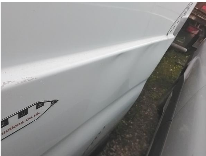
7: Qtr Panel nsr Dented Over 30mm