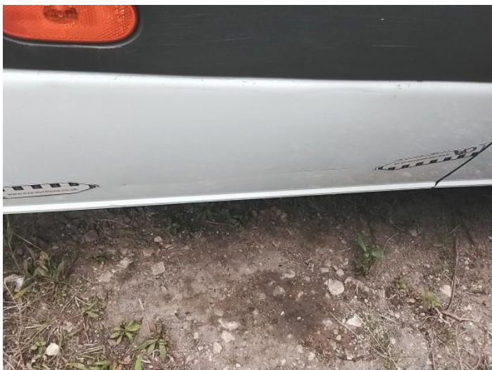
27: Qtr Panel osr Dented With Paint Damage