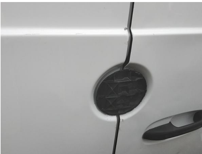
13: Badgedecal Rear Broken Replace