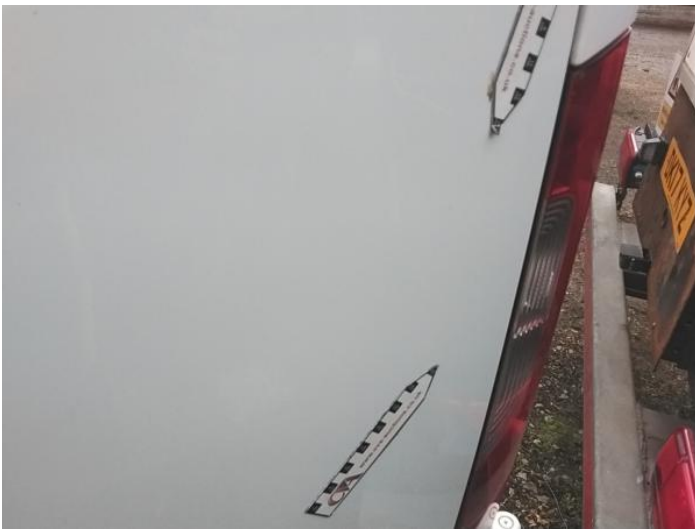
17: Door osr Dented Over 30mm