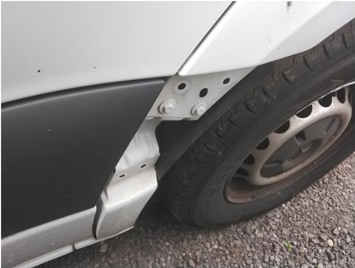
33: Door Moulding osf Missing Replace