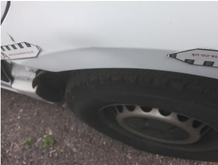
35: Wing osf Dented Over 30mm