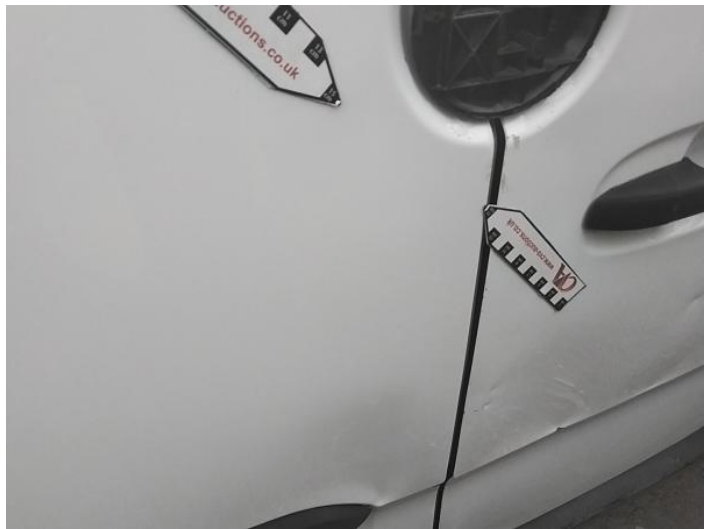
12: Door nsr Dented Over 30mm