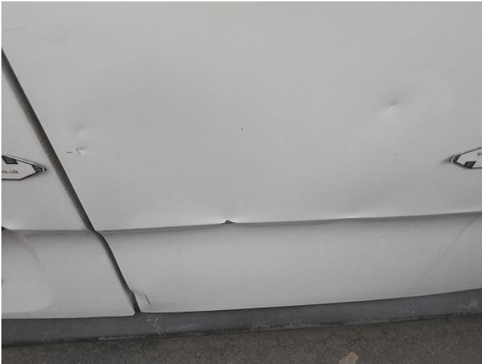
15: Door osr Dented With Paint Damage