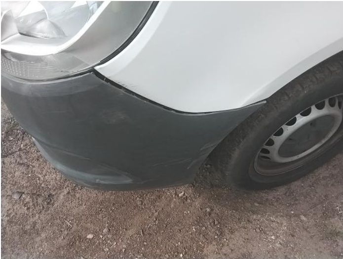
3: Bumper Front Insecure Action Required