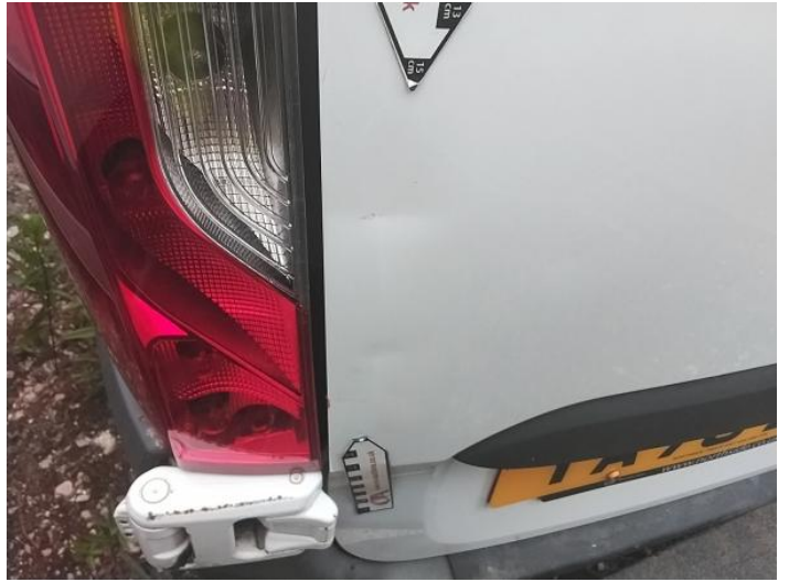
10: Door nsr Dented Over 30mm