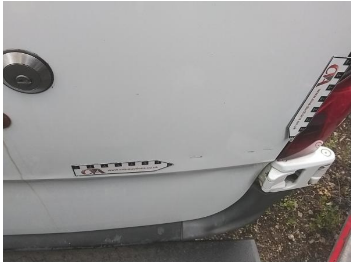
16: Door osr Dented With Paint Damage