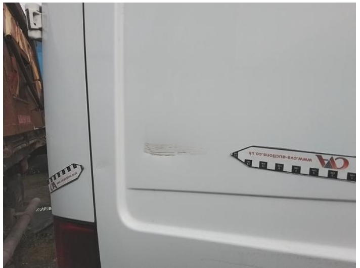
18: Qtr Panel osr Dented With Paint Damage