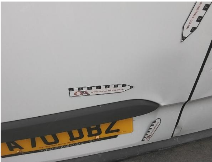
11: Door nsr Dented Over 30mm