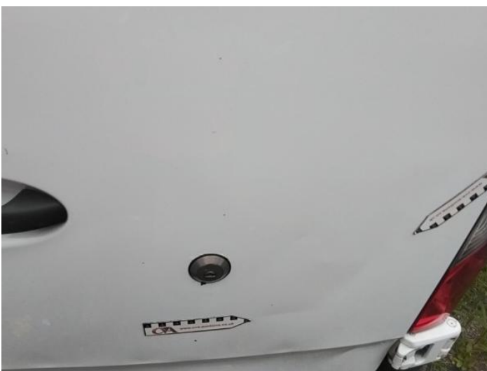
37: Door osr Dented Over 30mm