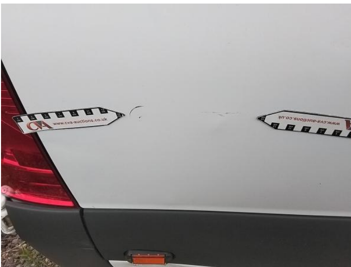
43: Qtr Panel osr Dented With Paint Damage