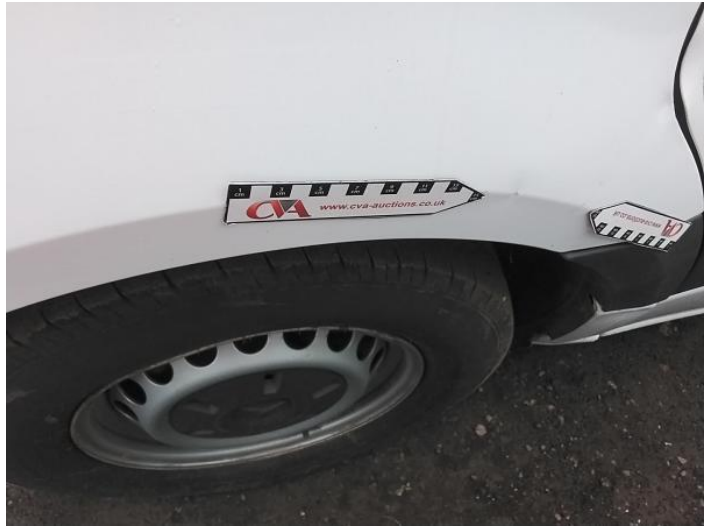
10: Wing nsf Dented Over 30mm