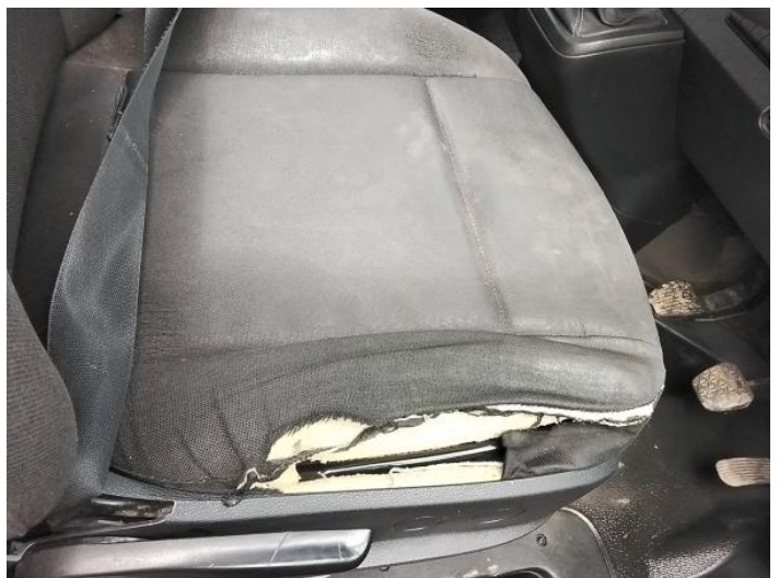
56: Seat Base Cover osf Torn Over 3mm