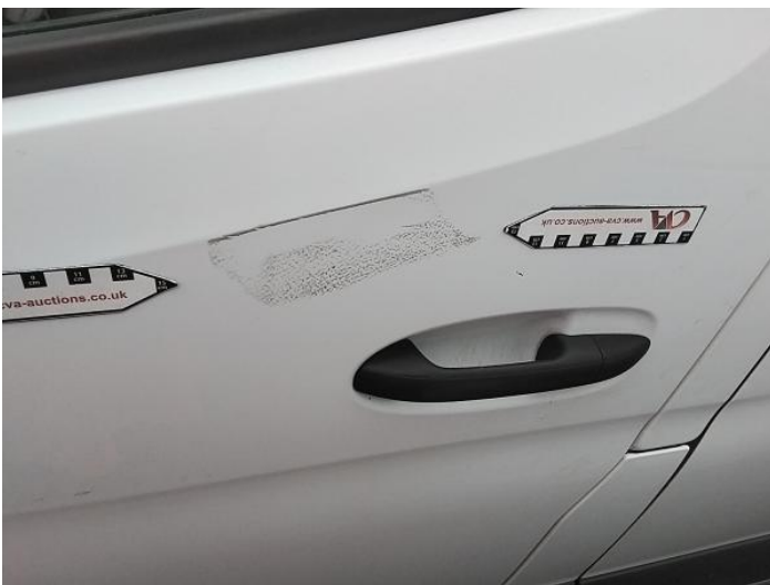
13: Door nsf Dented With Paint Damage