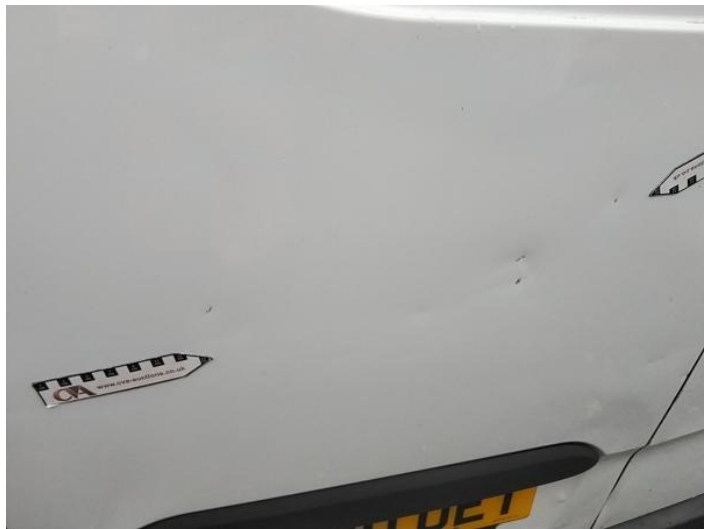
30: Door nsr Dented With Paint Damage