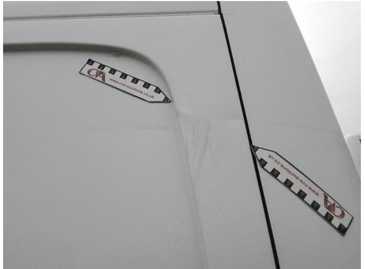
28: Qtr Panel nsr Dented Over 30mm