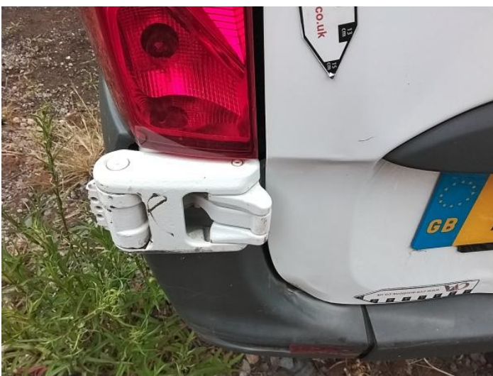
31: Door nsr Dented Over 30mm