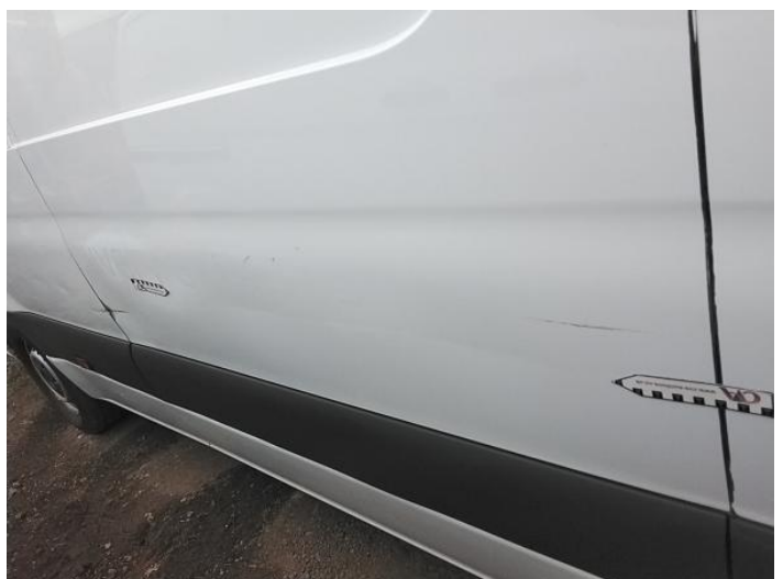
50: Qtr Panel osr Dented Over 30mm