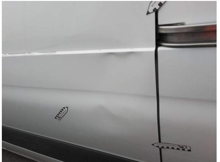
18: Qtr Panel nsr Dented Over 30mm