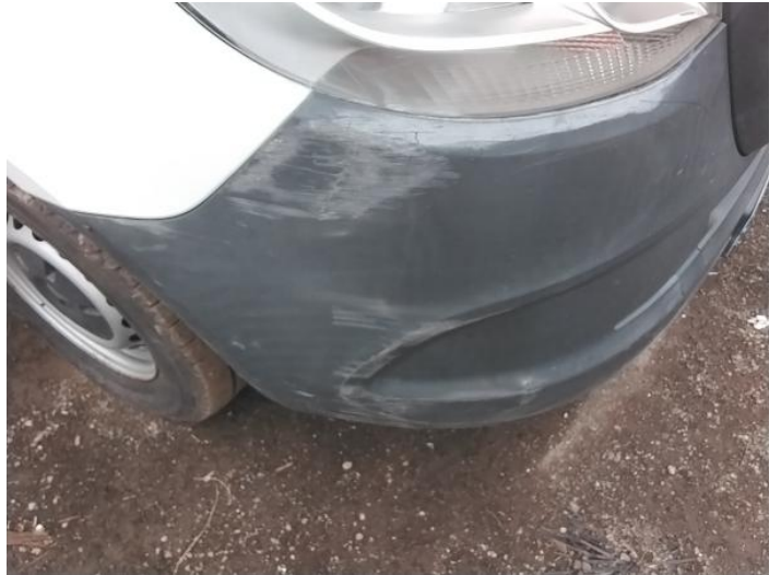
4: Bumper Front Scratched Over 100mm Thru Paint