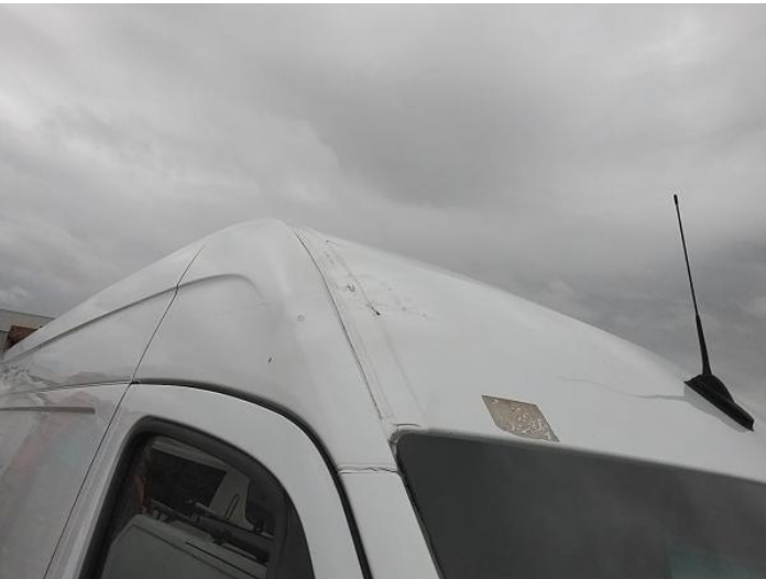
1: Roof Dented With Paint Damage