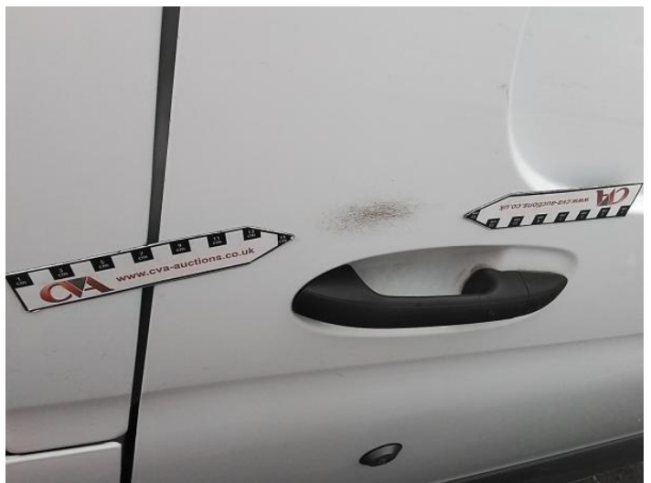
14: Qtr Panel nsr Scratched Over 25mm Thru Paint