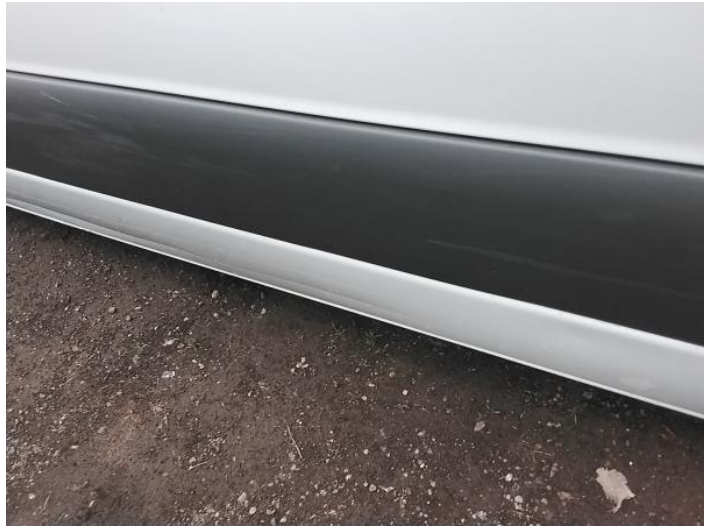
16: Qtr Panel Moulding ns Scuffed (Unpainted) Over 100mm