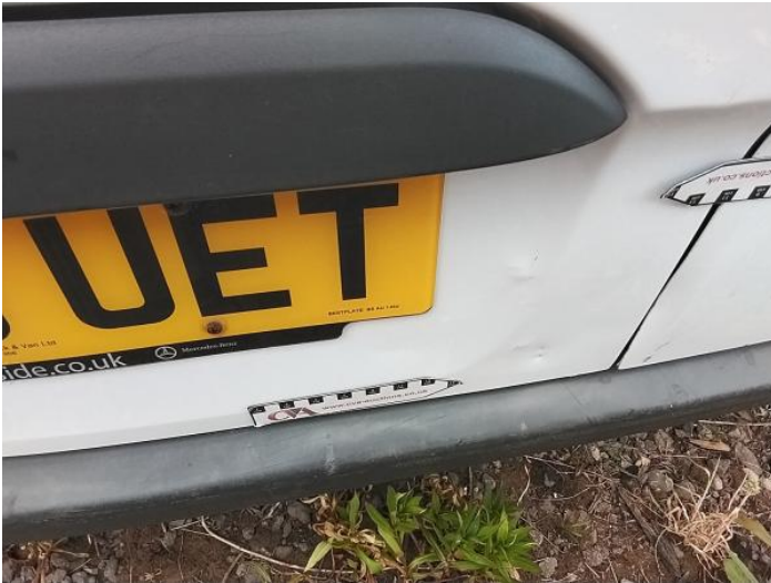
33: Door nsr Dented Over 30mm