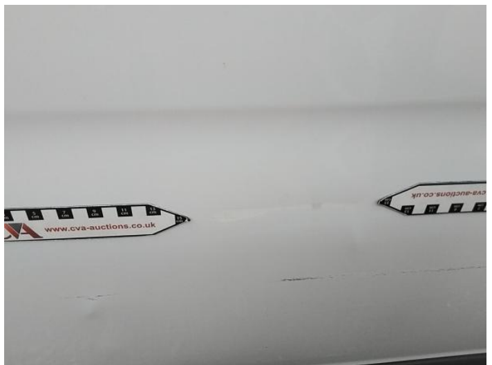
44: Qtr Panel osr Dented With Paint Damage