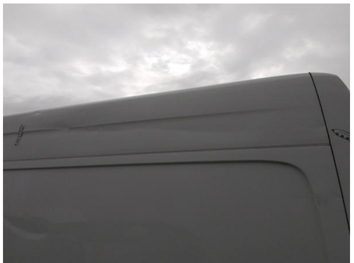
26: Qtr Panel nsr Dented With Paint Damage