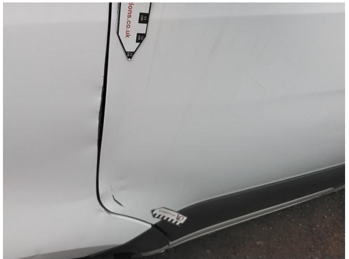
12: Door nsf Dented With Paint Damage