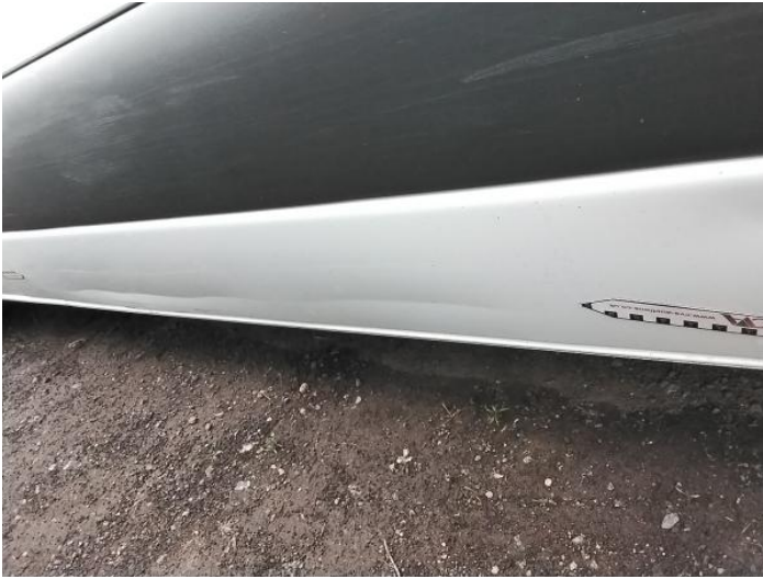
15: Qtr Panel nsr Dented Over 30mm