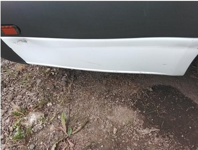
41: Qtr Panel osr Dented With Paint Damage