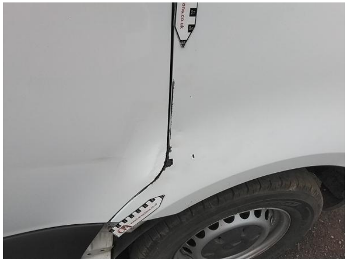
54: Wing osf Dented With Paint Damage