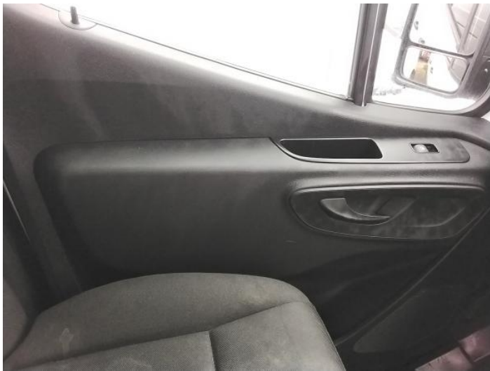
59: Door Pad nsf Soiled Heavy