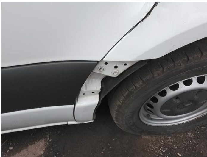
55: Door Moulding osf Missing Replace