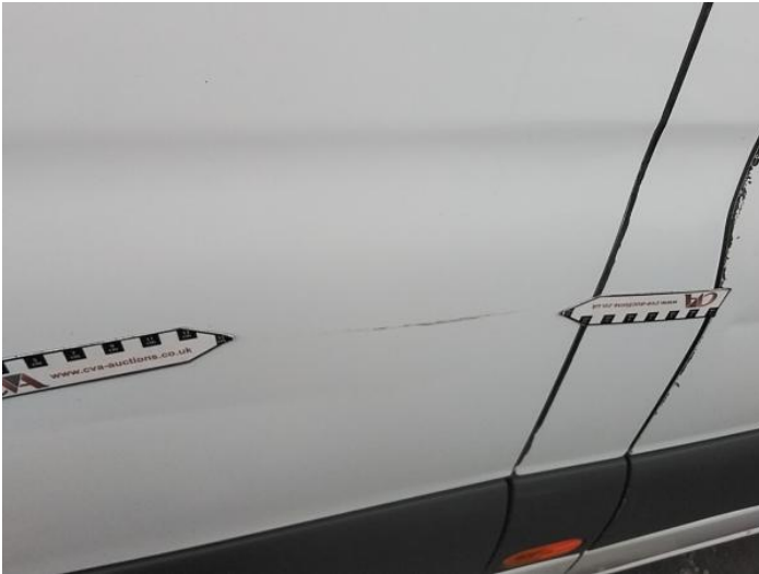
51: Qtr Panel osf Scratched Over 25mm Thru Paint