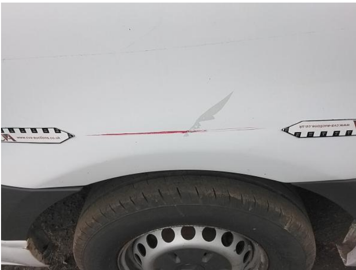
47: Qtr Panel osr Scratched Over 25mm Thru Paint