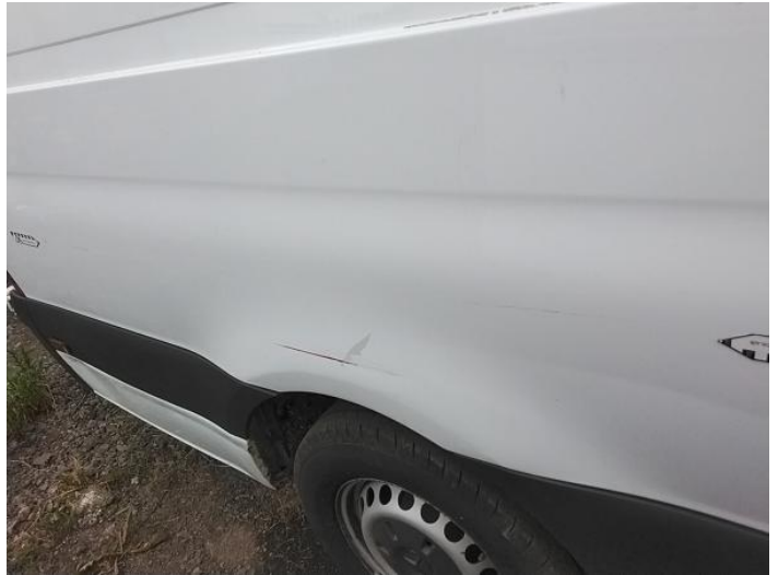
46: Qtr Panel osr Scratched Over 25mm Thru Paint