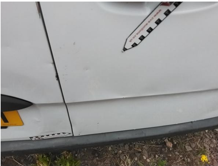
35: Door osr Dented Over 30mm