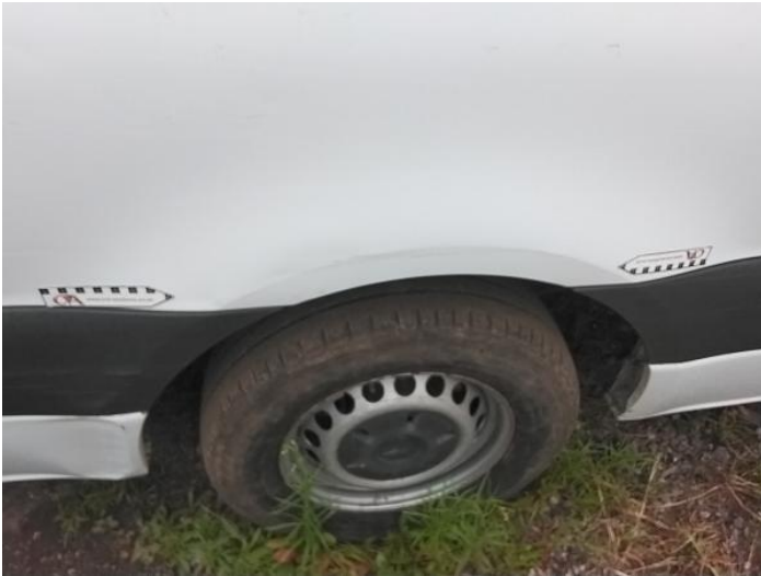
27: Qtr Panel nsr Dented With Paint Damage