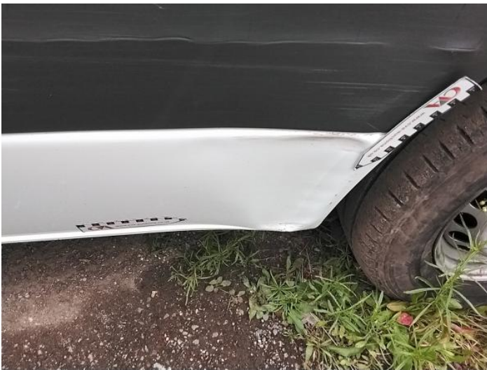
23: Qtr Panel nsr Dented With Paint Damage