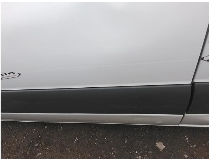
19: Qtr Panel nsr Scratched Over 25mm Thru Paint