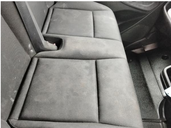
58: Seat Base Cover nsf Soiled Heavy