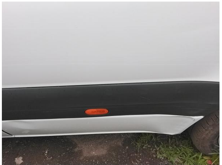
24: Qtr Panel Moulding ns Scuffed (Unpainted) Over 100mm