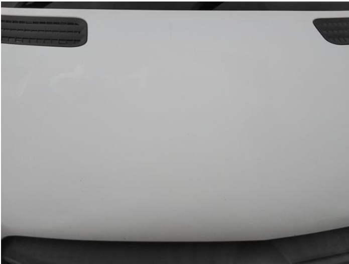
5: Bonnet Chipped Multiple Chips