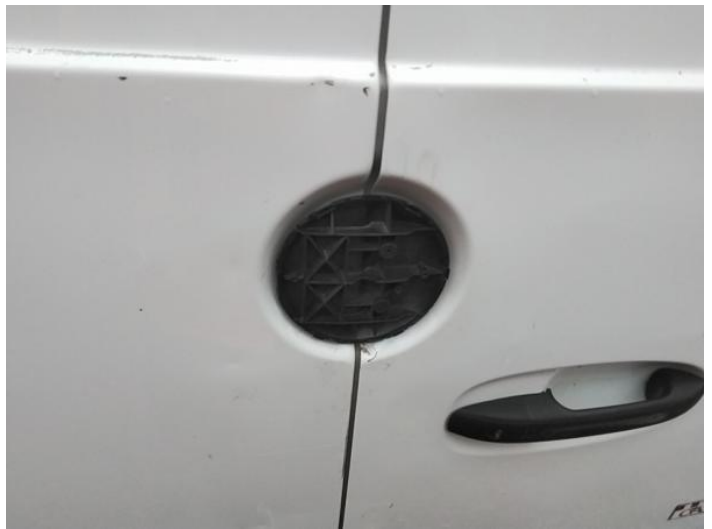
36: Badgedecal Rear Broken Replace