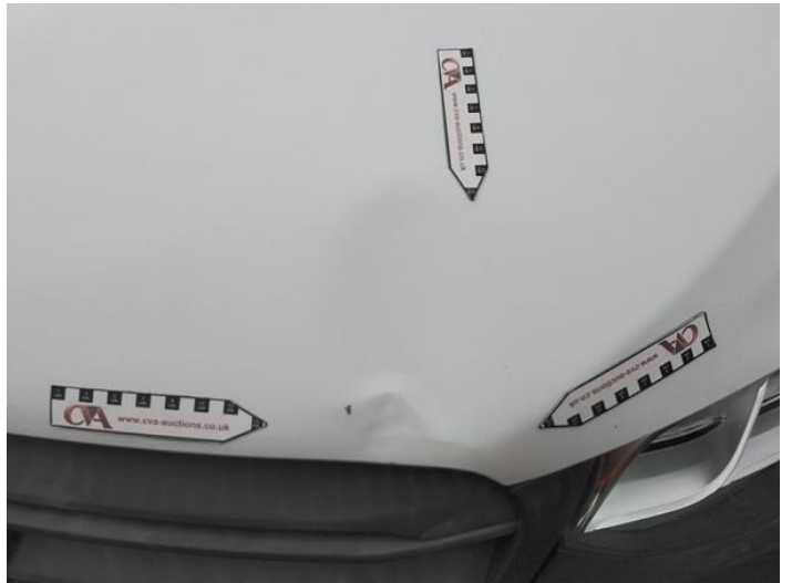
6: Bonnet Dented With Paint Damage