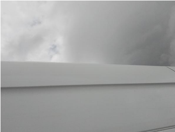
39: Qtr Panel osr Dented Over 30mm