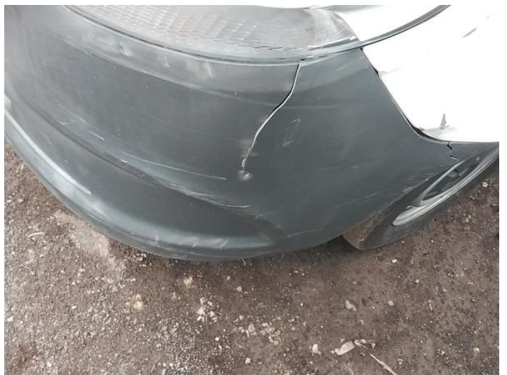
8: Bumper Front Cracked Over 25mm