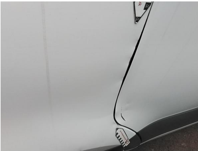
11: Wing nsf Dented With Paint Damage