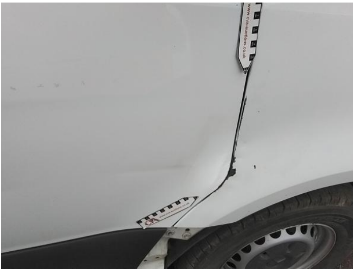
53: Door osf Dented With Paint Damage