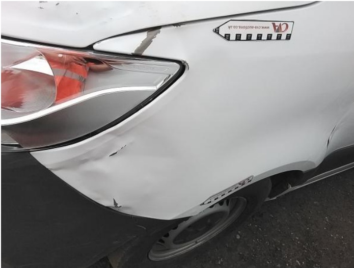
9: Wing nsf Dented With Paint Damage