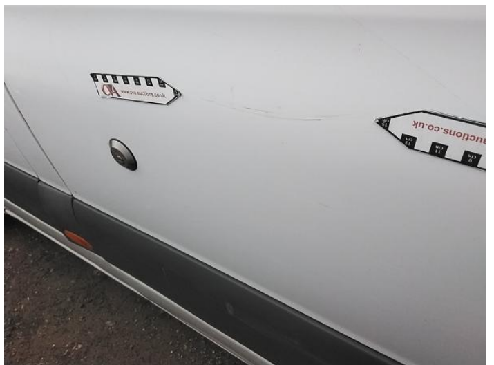
20: Qtr Panel nsr Dented With Paint Damage