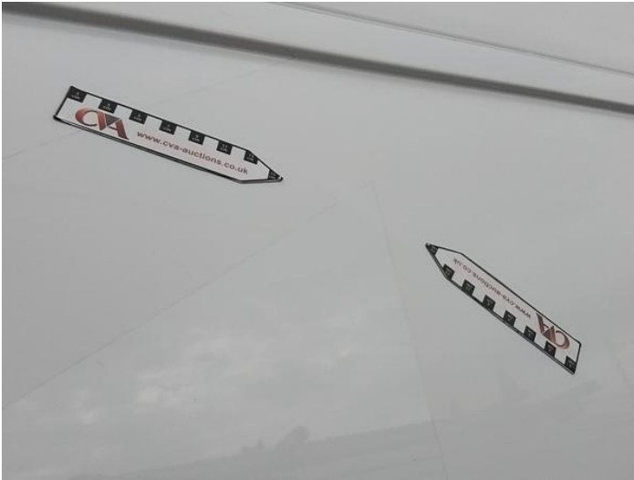
45: Qtr Panel osr Dented Over 30mm