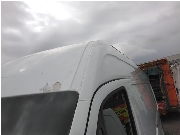
2: Roof Dented With Paint Damage