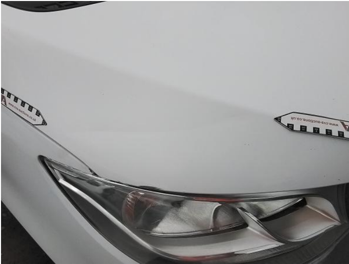
3: Bonnet Dented Over 30mm