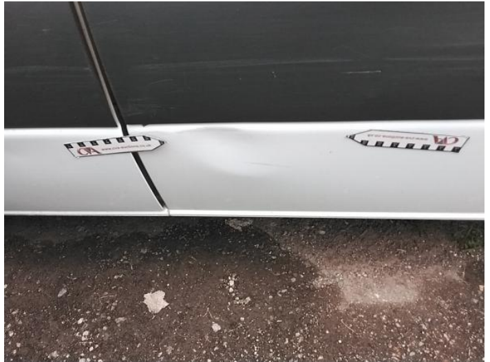
22: Qtr Panel nsr Dented Over 30mm