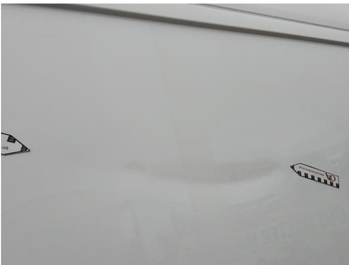
25: Qtr Panel nsr Dented Over 30mm