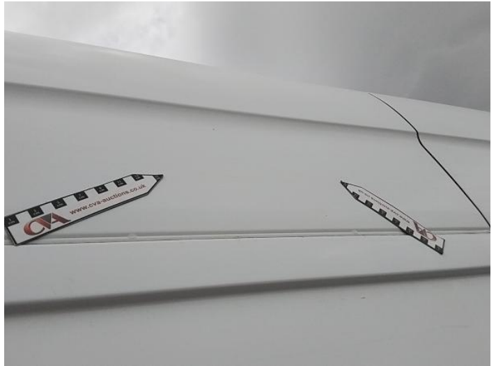
40: Qtr Panel osr Dented Over 30mm