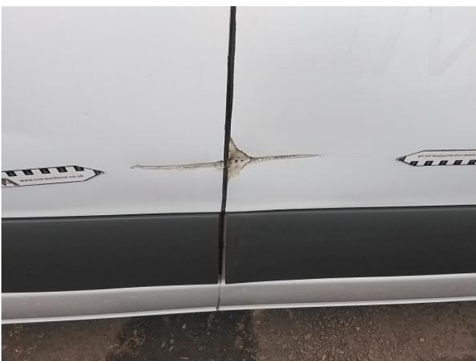
49: Qtr Panel osr Dented With Paint Damage