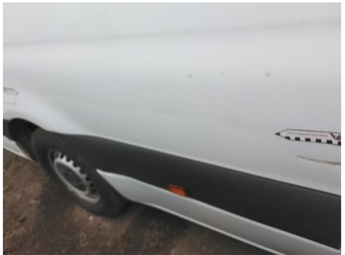
48: Qtr Panel osr Dented Over 30mm