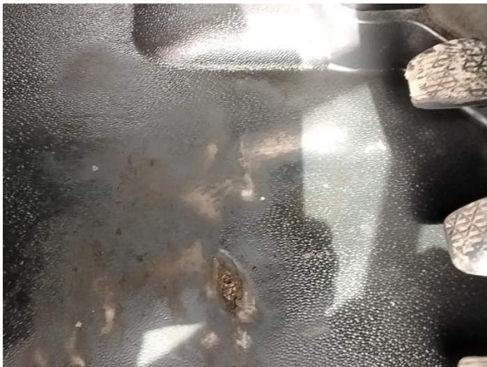
57: Carpets Front Torn Over 10mm