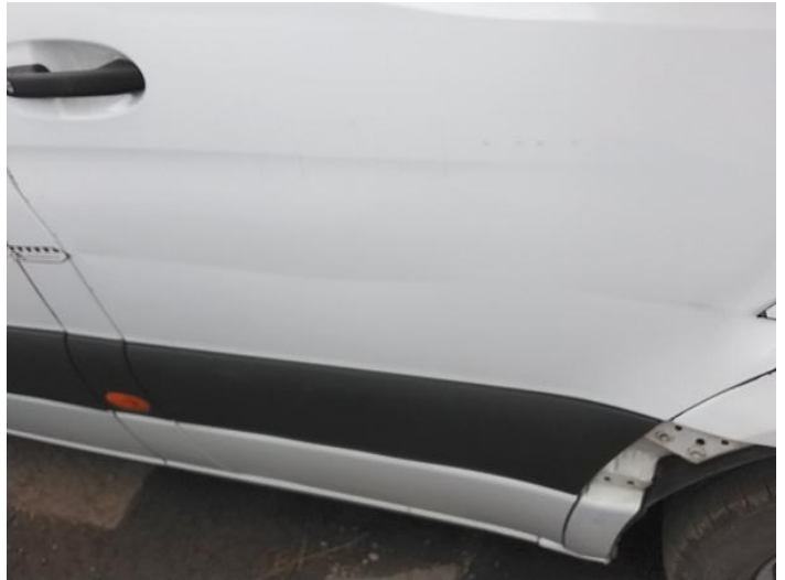
52: Door osf Dented Over 30mm