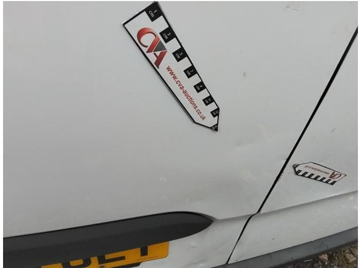
34: Door nsr Dented Over 30mm