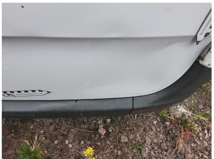
38: Door osr Dented Over 30mm