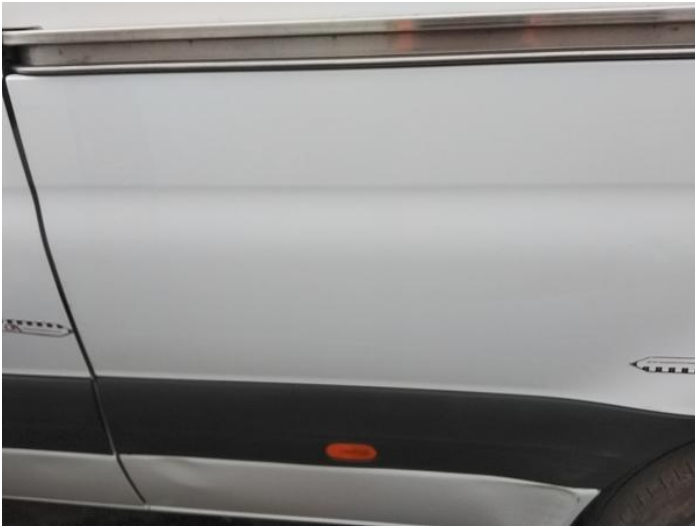
21: Qtr Panel nsr Scratched Over 25mm Thru Paint