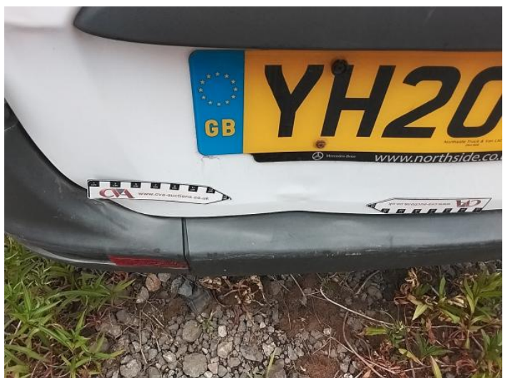
32: Door nsr Dented Over 30mm