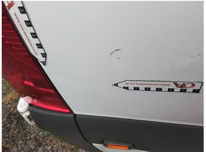
42: Qtr Panel osr Dented Over 30mm