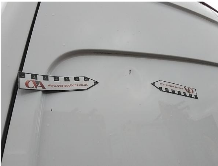
29: Door nsr Dented With Paint Damage