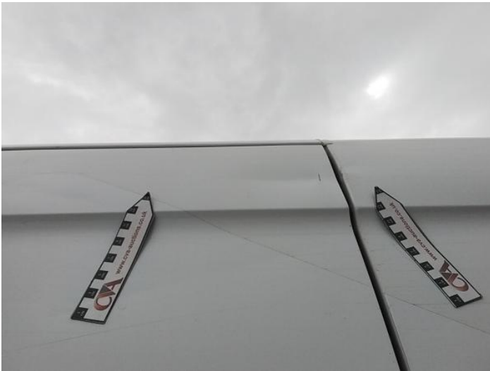
17: Qtr Panel nsr Dented With Paint Damage