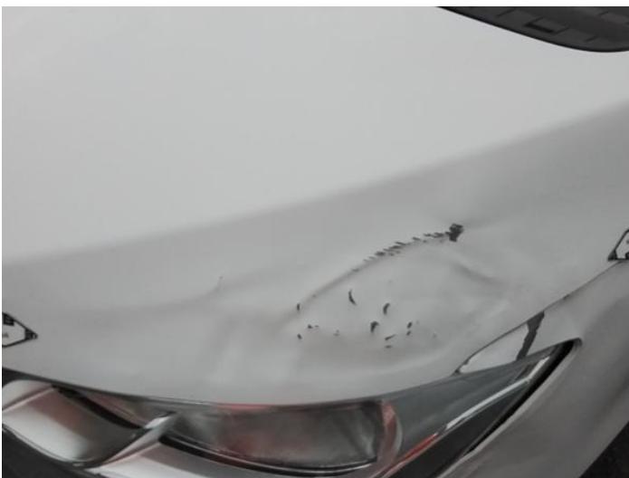
7: Bonnet Dented With Paint Damage