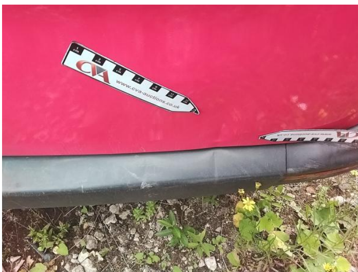
19: Door osr Dented Over 30mm