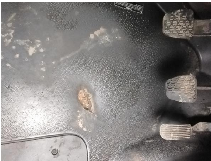
29: Carpets Front Holed Over 3mm