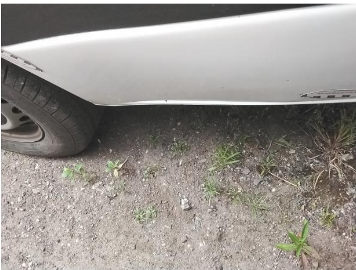
13: Qtr Panel nsr Dented Over 30mm