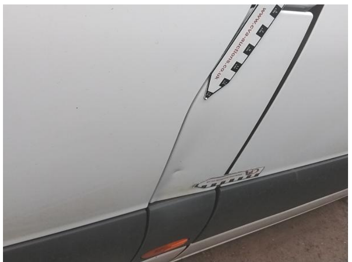
8: Fuel Flap Dented Over 30mm