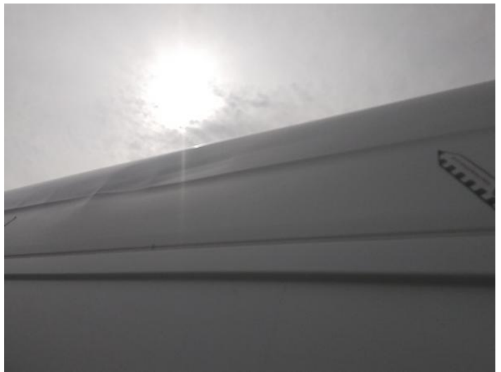
12: Qtr Panel nsr Dented Over 30mm