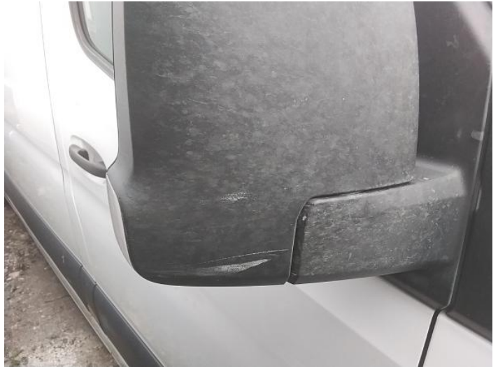
28: Door Mirror Assy osf Scuffed (Unpainted) UpTo 100mm