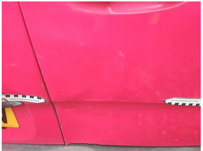
16: Door osr Dented Over 30mm