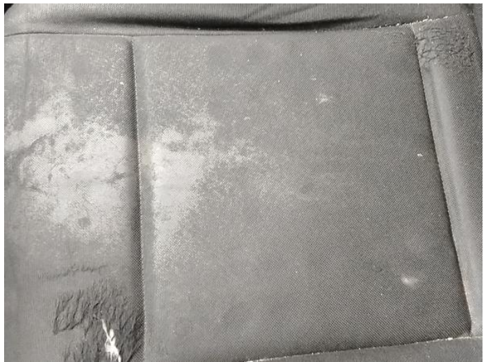
30: Seat Base Cover osf Torn Over 3mm