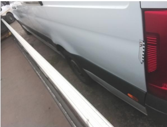
11: Qtr Panel nsr Scratched Over 25mm Thru Paint