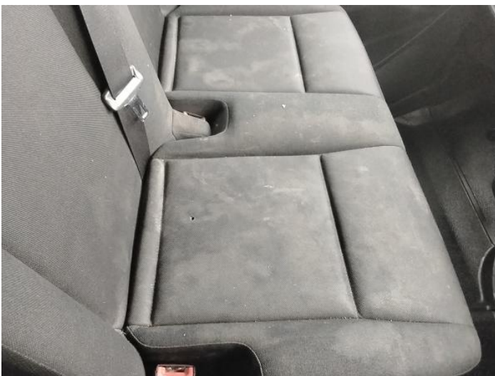
31: Seat Base Cover nsf Holed Over 3mm