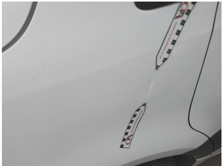
6: Wing nsf Dented Over 30mm