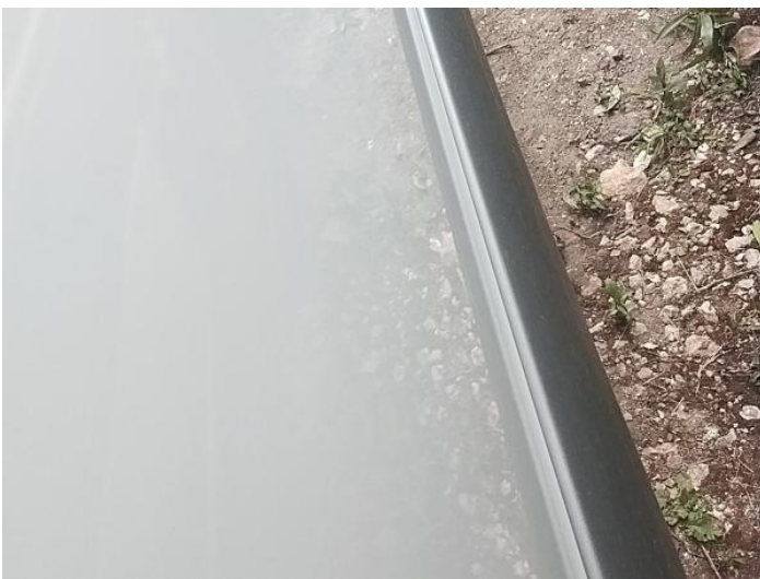
25: Qtr Panel Moulding os Scuffed (Unpainted) Over 100mm