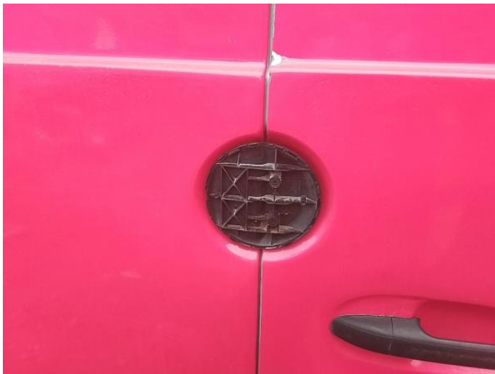
17: Badgedecal Rear Broken Replace