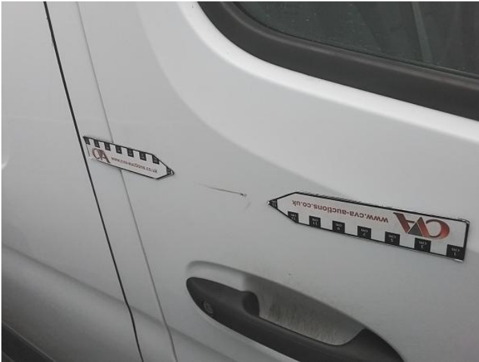
27: Door osf Scratched Over 25mm Thru Paint