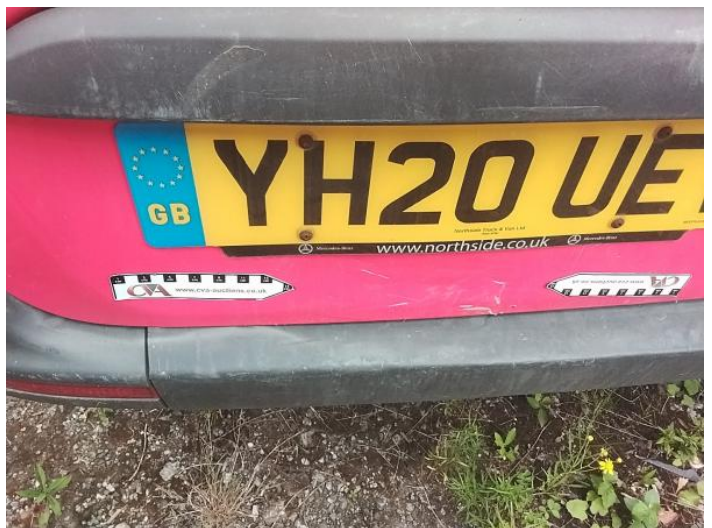
14: Door nsr Dented With Paint Damage