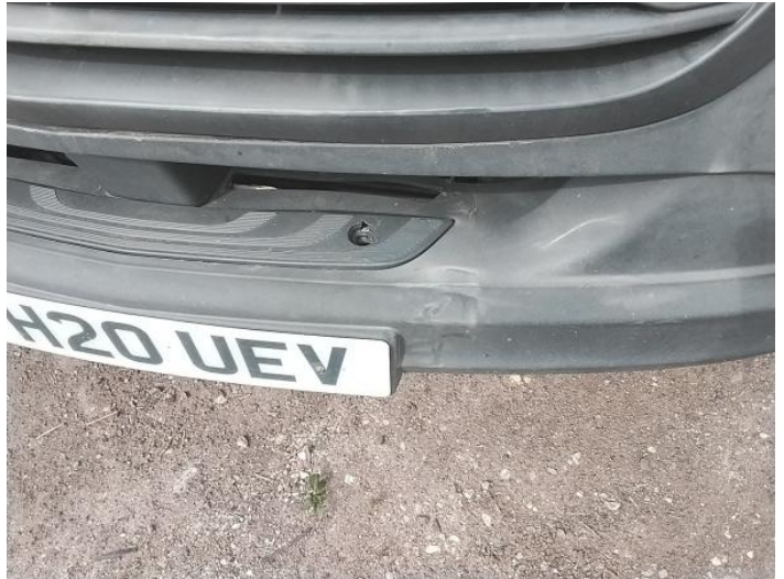
4: Bumper Front Dented Over 30mm