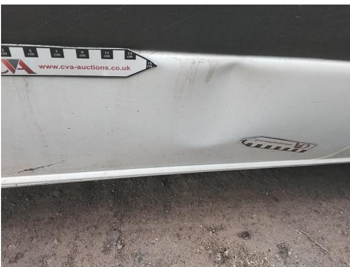
7: Door nsf Dented Over 30mm