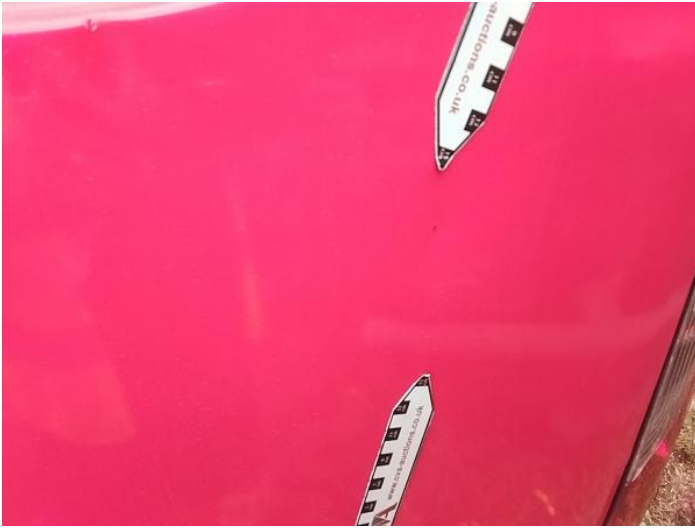
21: Door osr Dented Over 30mm