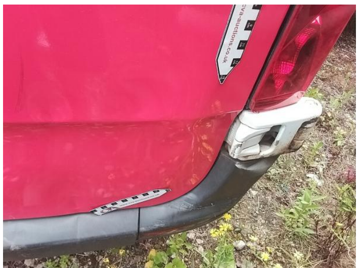
20: Door osr Dented Over 30mm