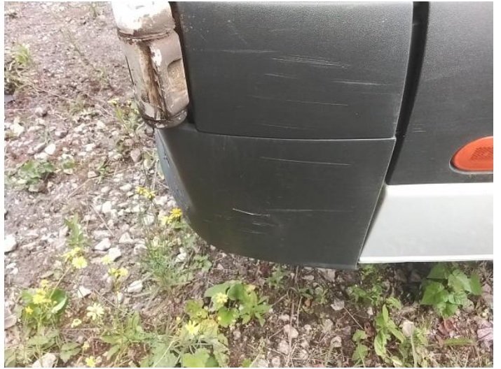
22: Bumper Rear Scratched Over 100mm Thru Paint