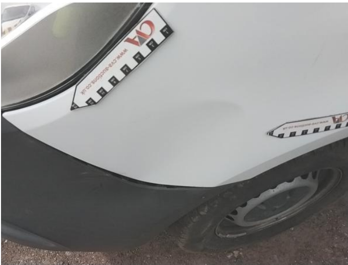
5: Wing nsf Dented Over 30mm