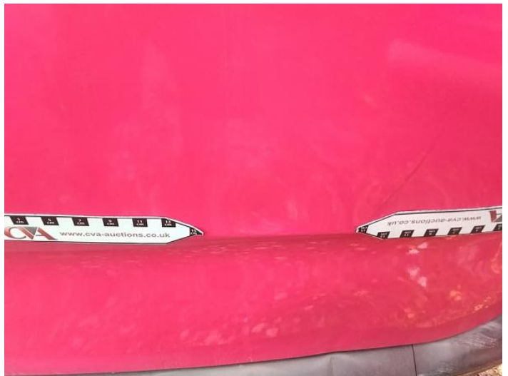
18: Door osr Dented Over 30mm