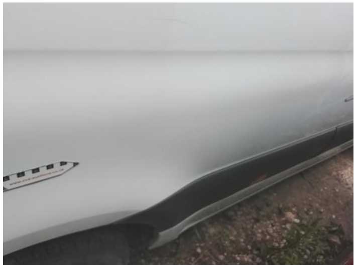
24: Qtr Panel osr Scratched Over 25mm Thru Paint