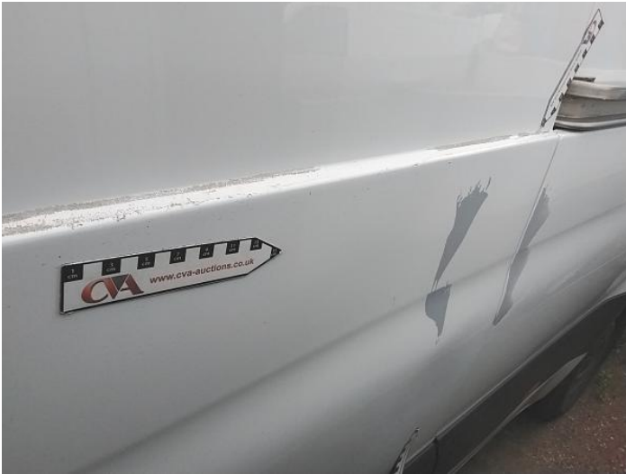
9: Qtr Panel nsr Dented With Paint Damage