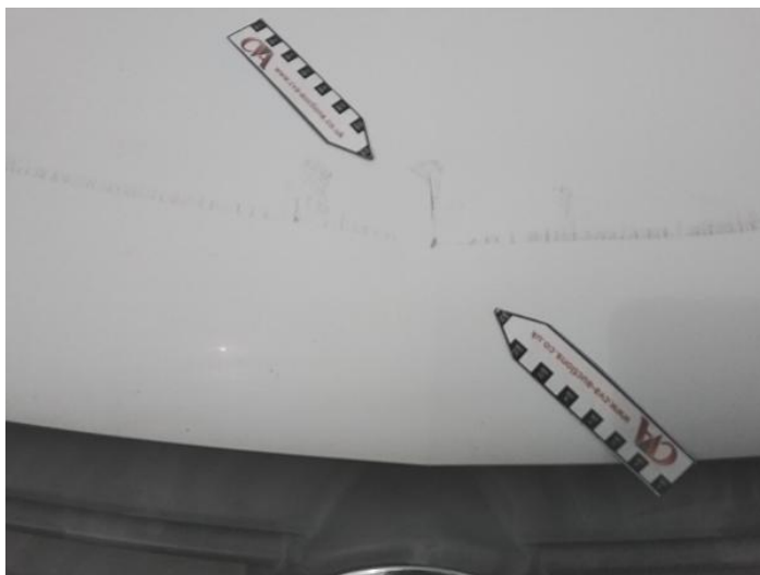
1: Bonnet Dented With Paint Damage