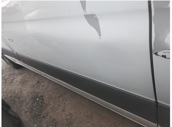
10: Qtr Panel nsr Scratched Over 25mm Thru Paint