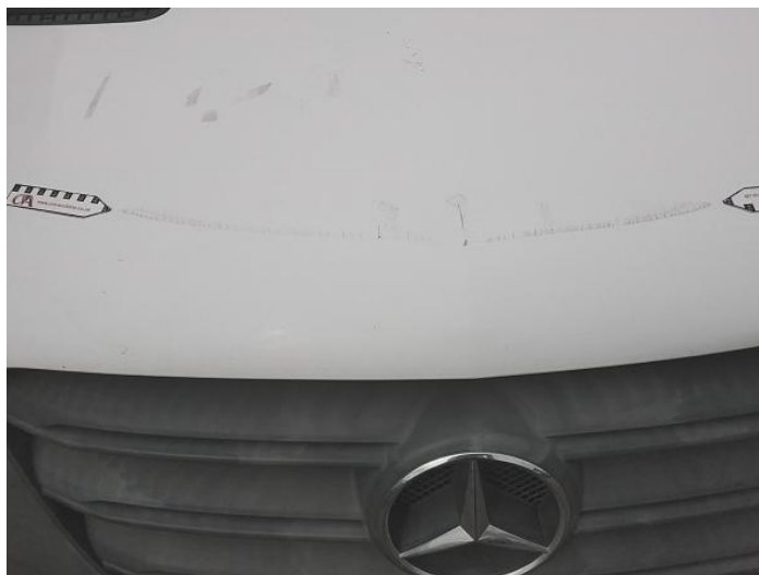
2: Bonnet Scratched Over 25mm Thru Paint