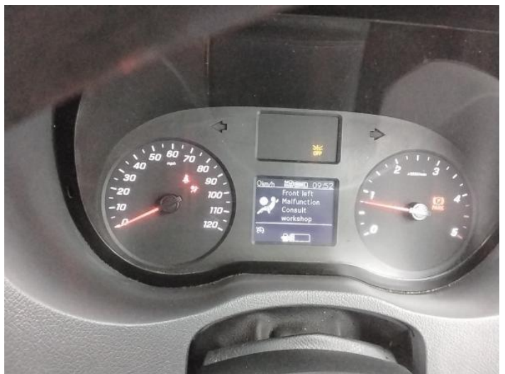
32: Dash Warning Lights Displayed No Action