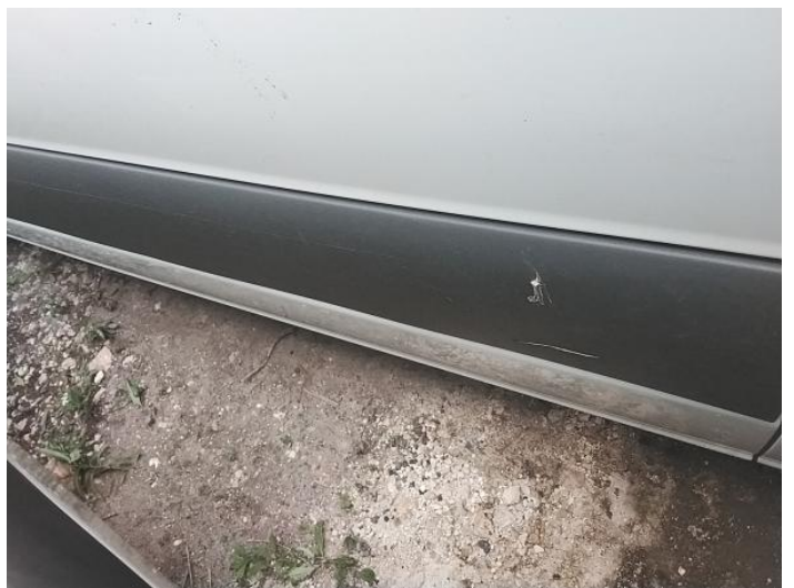
26: Qtr Panel Moulding os Scuffed (Unpainted) Over 100mm