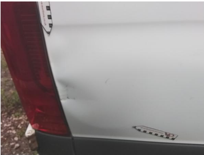
23: Qtr Panel osr Dented With Paint Damage