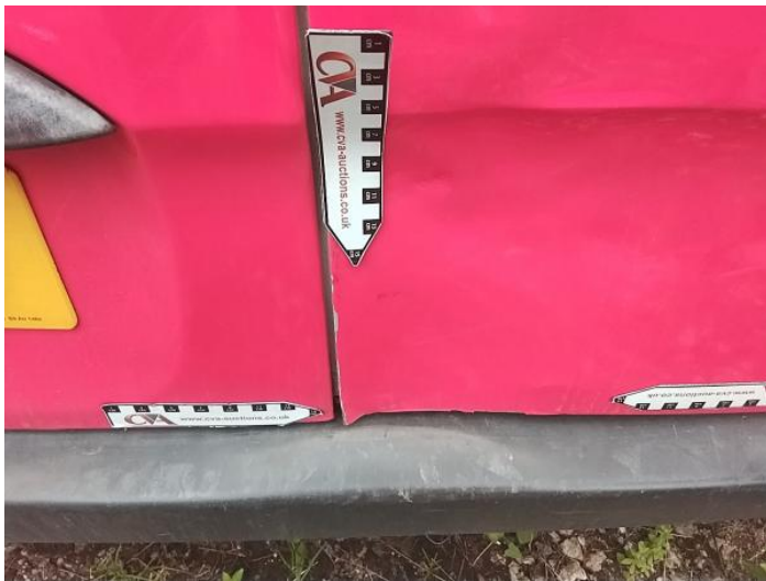
15: Door osr Dented With Paint Damage