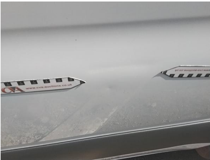
17: Qtr Panel osr Dented Over 30mm