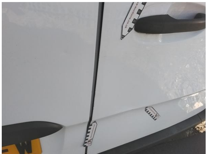
14: Door osr Dented Over 30mm