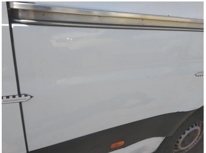
6: Qtr Panel nsr Dented With Paint Damage