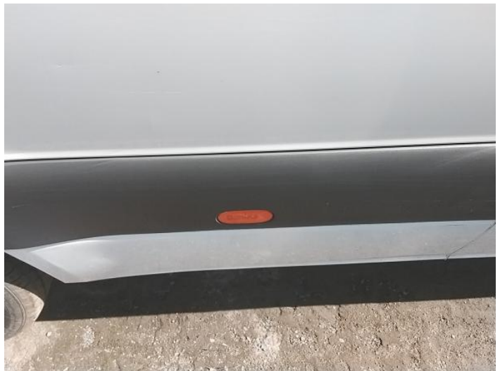
22: Qtr Panel Moulding os Scuffed (Unpainted) Over 100mm