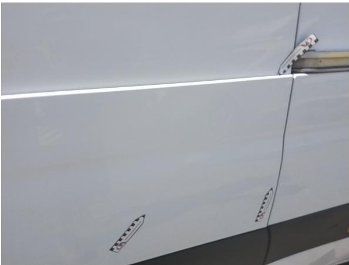
5: Qtr Panel nsr Dented Over 30mm