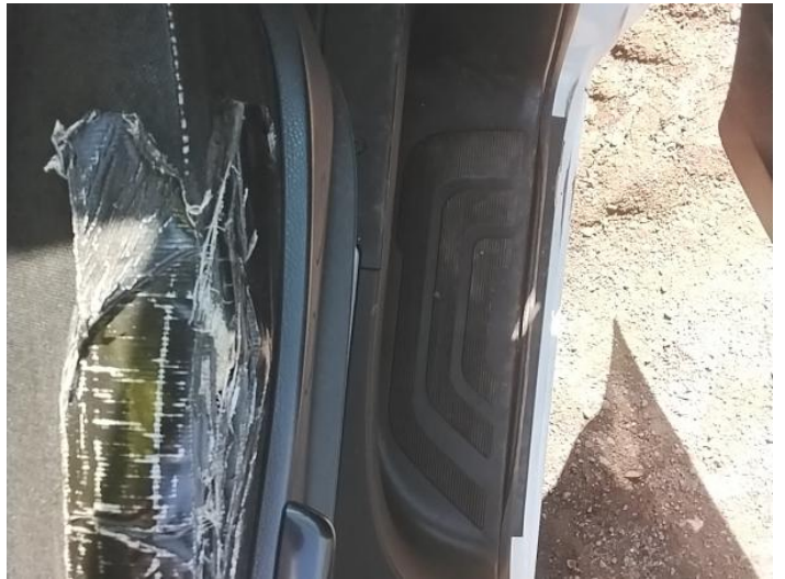
30: Seat Base Cover osf Torn Over 3mm