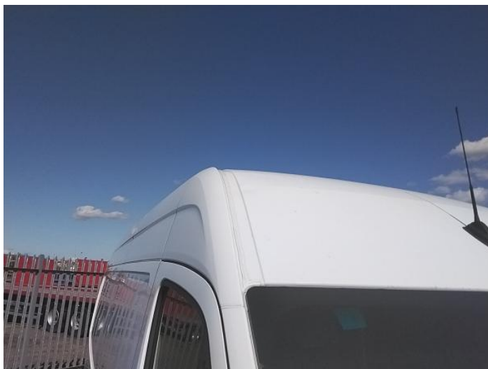
1: Roof Dented Over 30mm