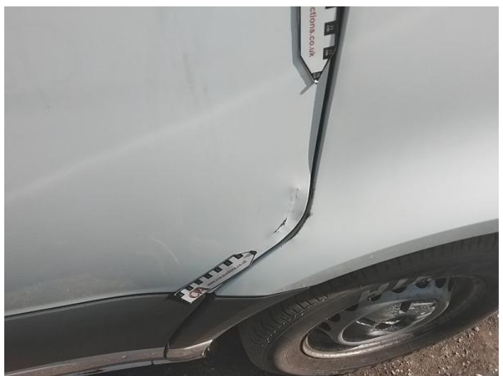
26: Door osf Dented With Paint Damage