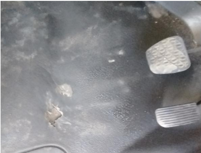
29: Carpets Front Holed Over 3mm