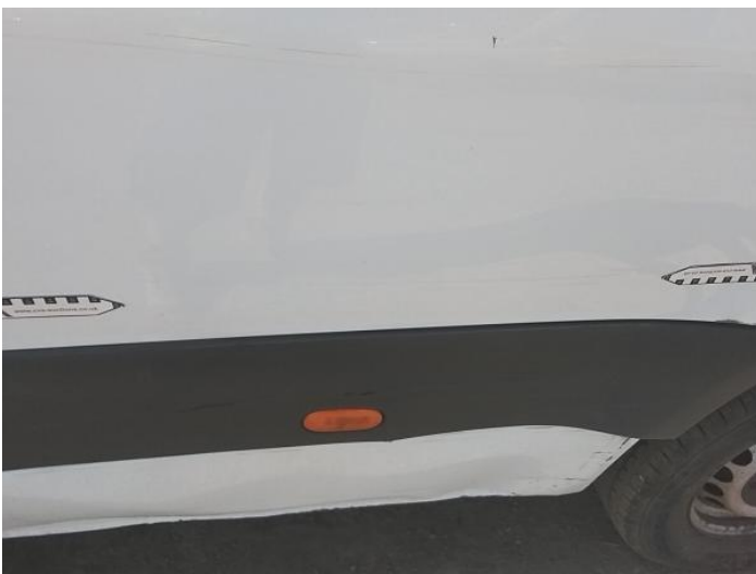
7: Qtr Panel nsr Dented With Paint Damage