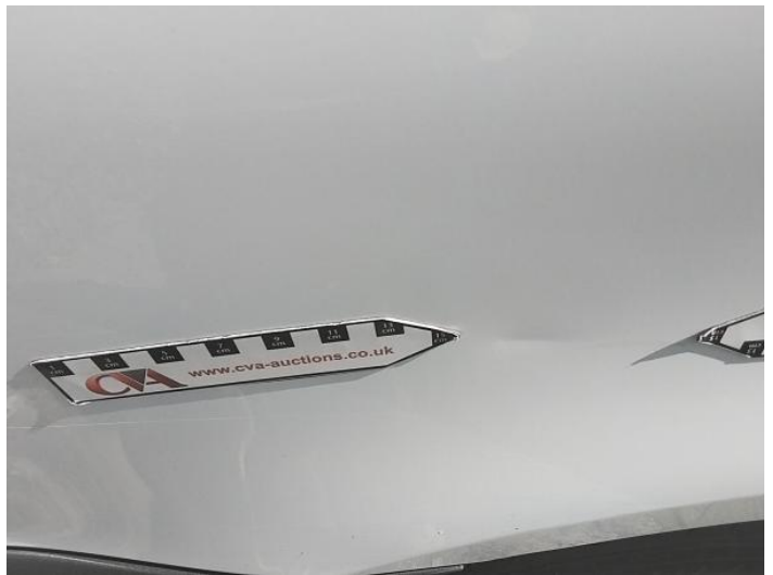
18: Qtr Panel osr Dented Over 30mm