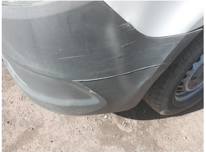
4: Bumper Front Scratched Over 100mm Thru Paint