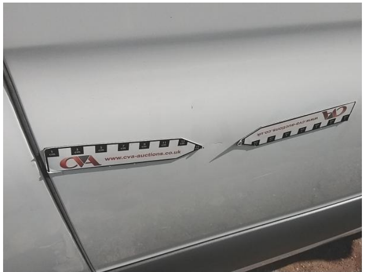
24: Qtr Panel osr Dented With Paint Damage