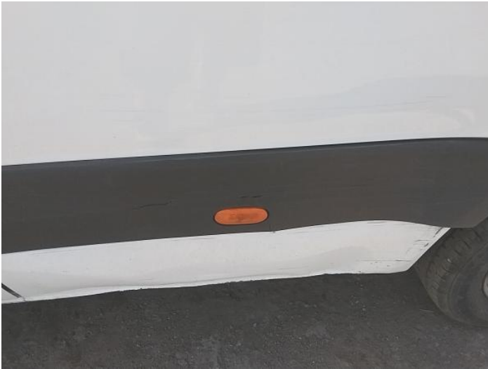
9: Qtr Panel Moulding ns Broken Replace