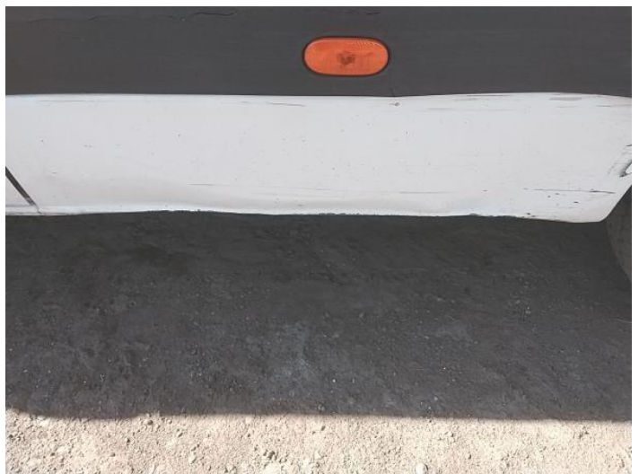
8: Qtr Panel nsr Dented With Paint Damage