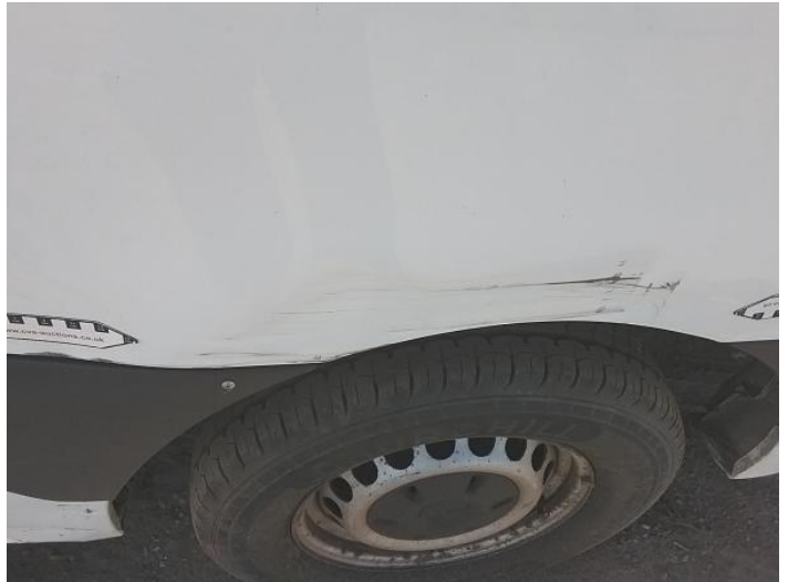
10: Qtr Panel nsr Dented With Paint Damage