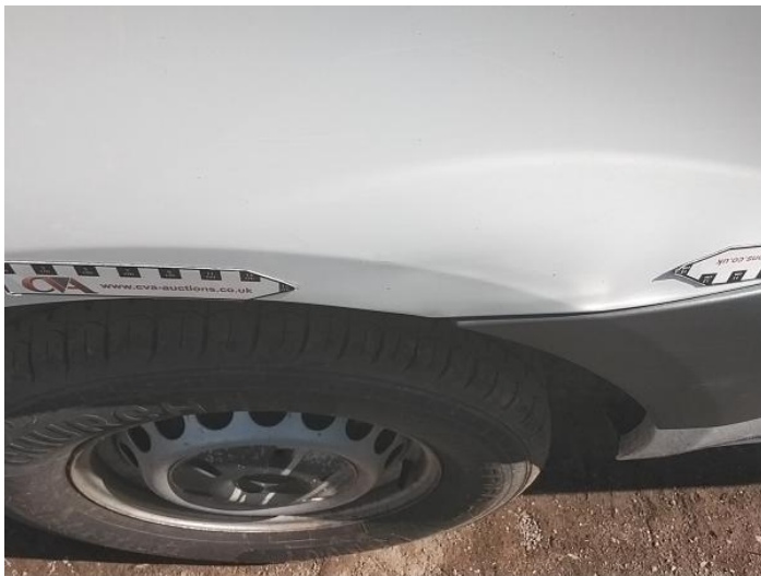
21: Qtr Panel osr Dented With Paint Damage