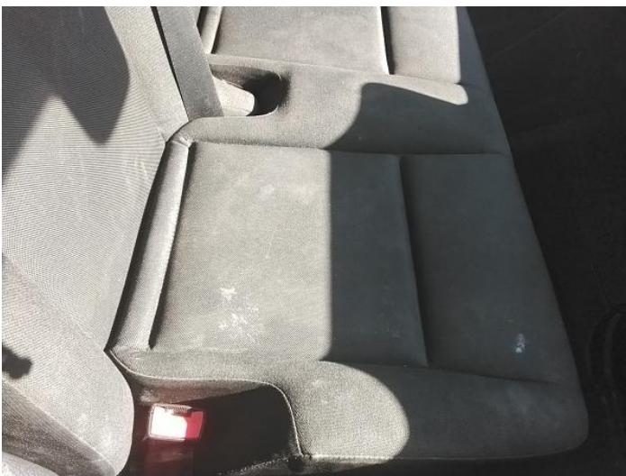
31: Seat Base Cover nsf Soiled Heavy