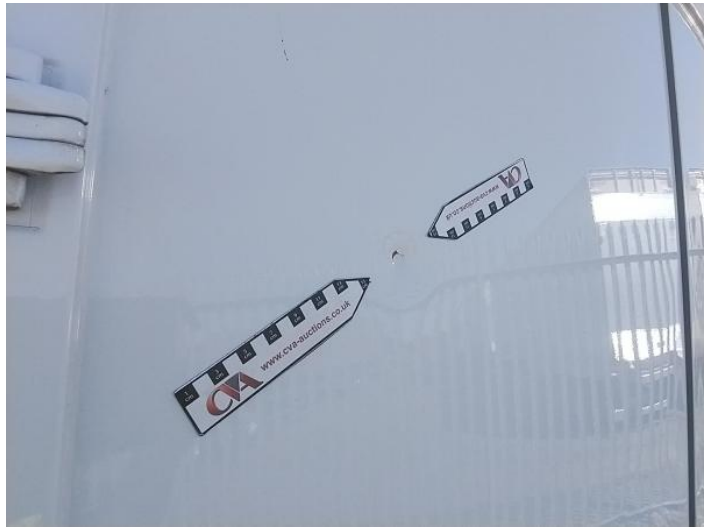
12: Door nsr Dented With Paint Damage