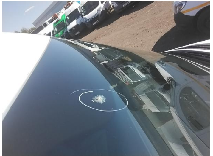
28: Screen Front Chipped Over 10mm