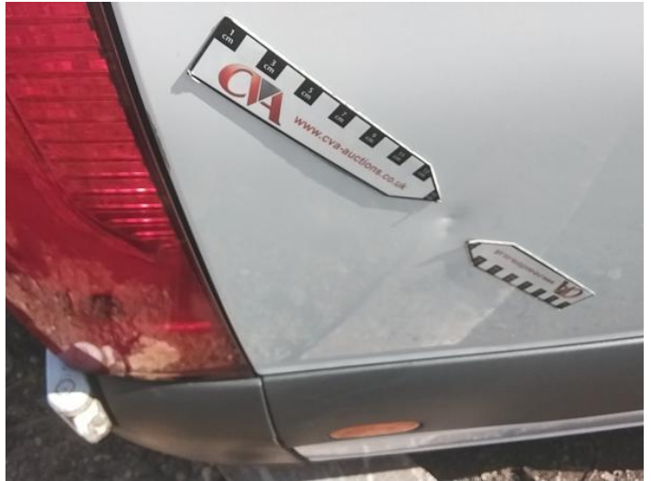
16: Qtr Panel osr Dented Over 30mm