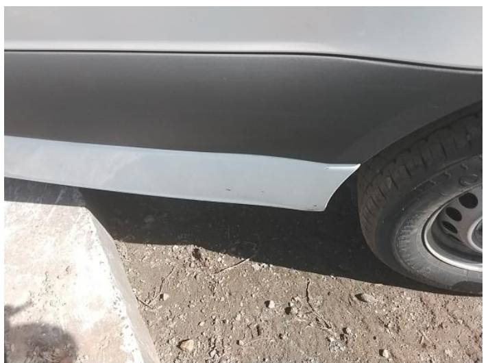
20: Qtr Panel Moulding os Scuffed (Unpainted) Over 100mm