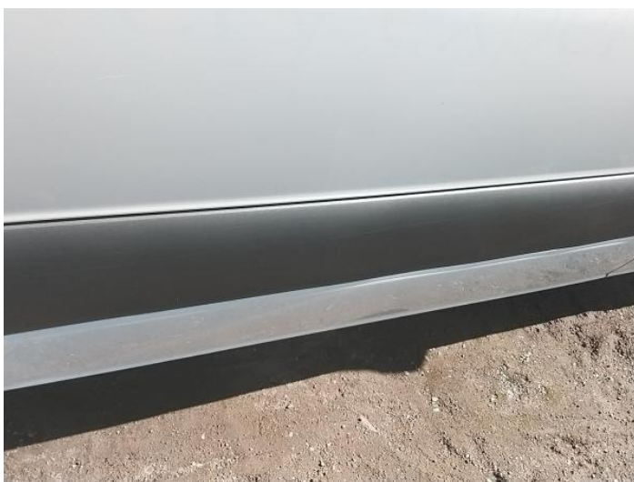
25: Qtr Panel Moulding os Scuffed (Unpainted) Over 100mm