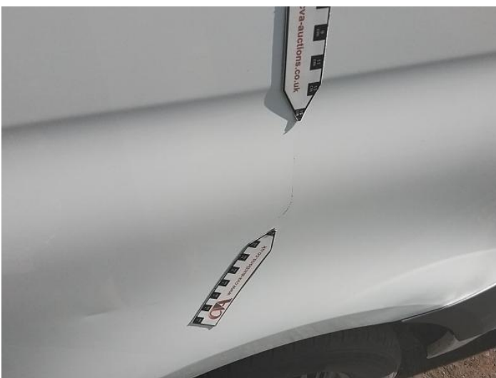
19: Qtr Panel osr Scratched Over 25mm Thru Paint