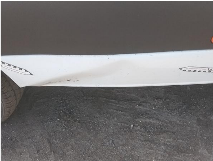
11: Qtr Panel nsr Dented With Paint Damage