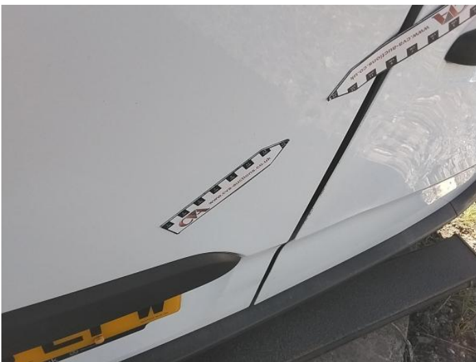
13: Door nsr Dented Over 30mm