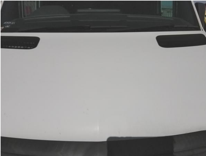
3: Bonnet Chipped Multiple Chips