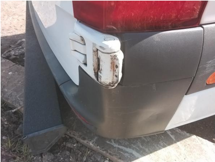
15: Bumper Rear Moulding Scuffed (Unpainted) Over 100mm