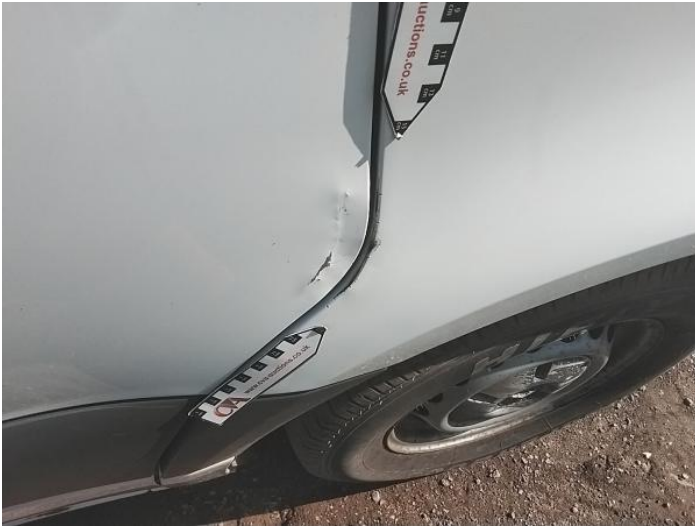
27: Wing osf Dented With Paint Damage