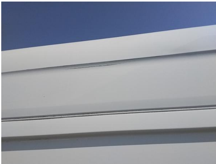
23: Qtr Panel osr Scratched Over 25mm Thru Paint