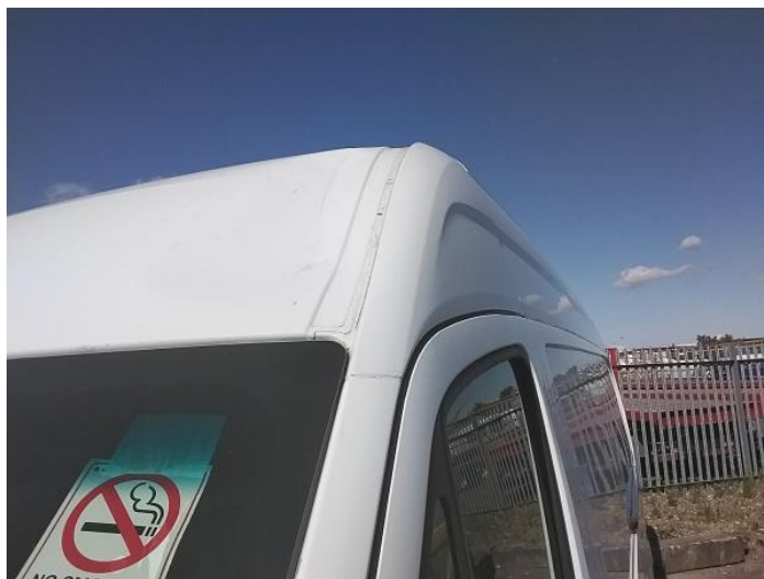
2: Roof Dented With Paint Damage