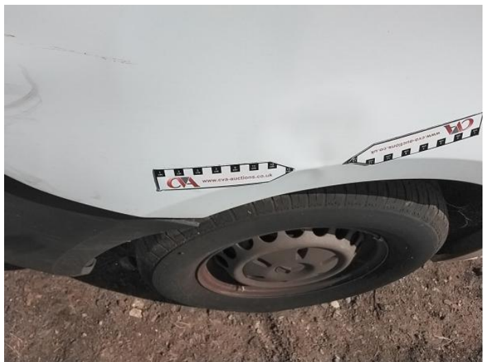
8: Wing nsf Dented Over 30mm