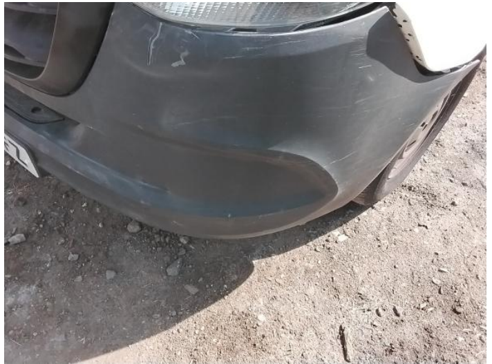
6: Bumper Front Scratched Over 100mm Thru Paint