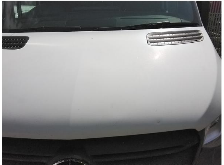
4: Bonnet Chipped Multiple Chips