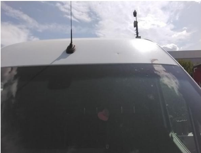
5: Roof Dented With Paint Damage