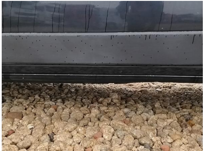
6: Sill ns Chipped Multiple Chips