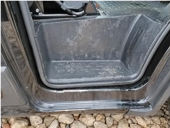
18: Sill os Rusted Over 5mm

Carpet Condition Average Seat Condition Average