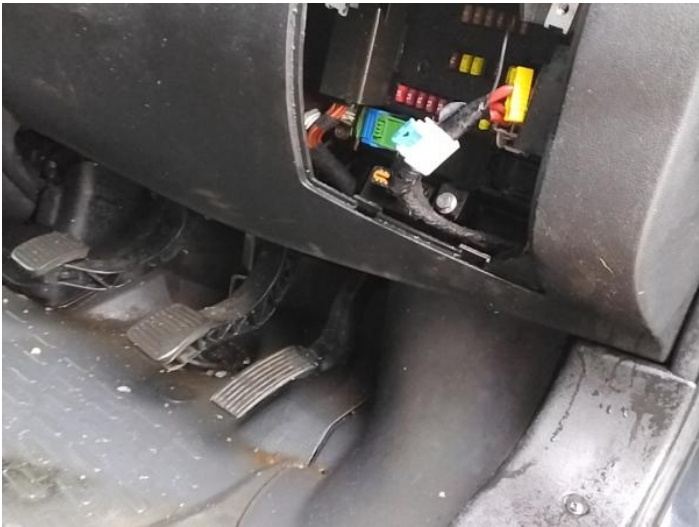
17: Other N/A N/A