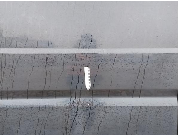
5: Door nsr Chipped Multiple Chips