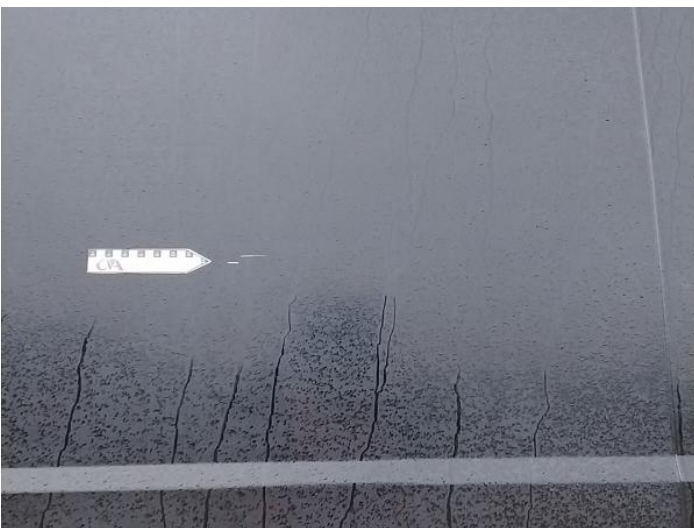
7: Qtr Panel nsr Scratched UpTo 25mm Thru Paint