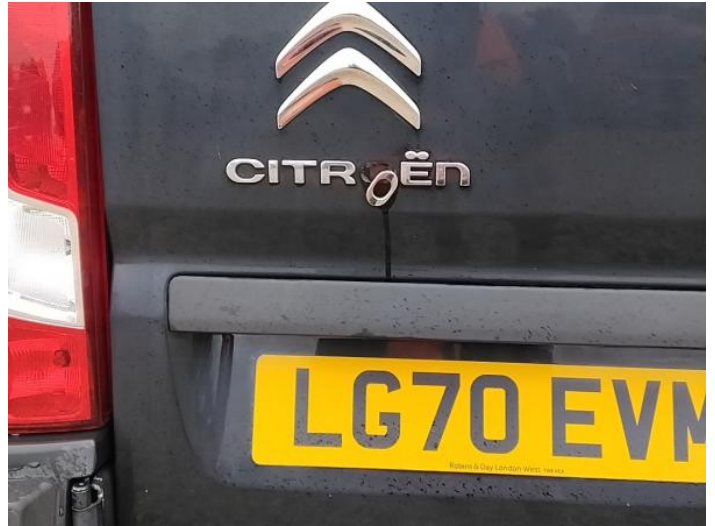
10: Badgedecal Rear Broken Replace