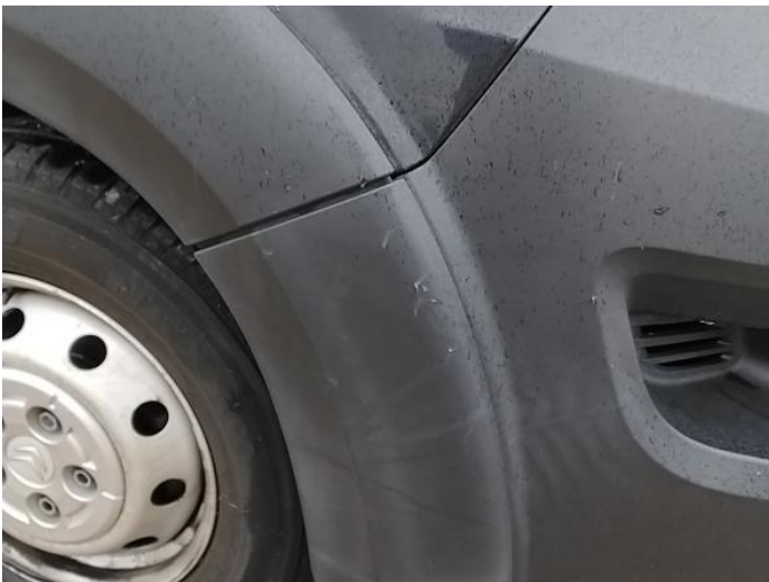
1: Wing Front Arch Extension os Scuffed (Unpainted) UpTo 100mm