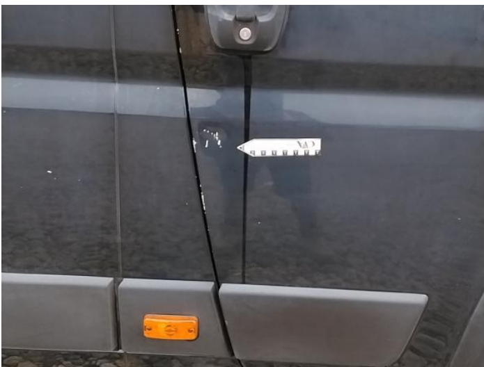
13: Door osf Scratched Over 25mm Thru Paint