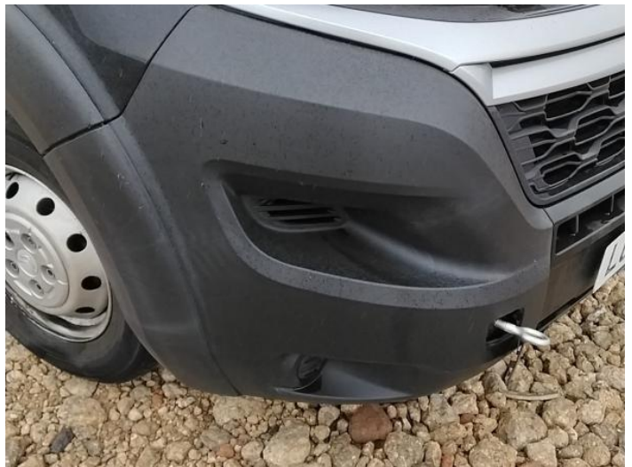
2: Bumper Front Moulding Scuffed (Unpainted) UpTo 100mm