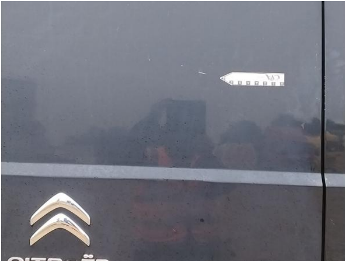
9: Door nsr Scratched UpTo 25mm Thru Paint