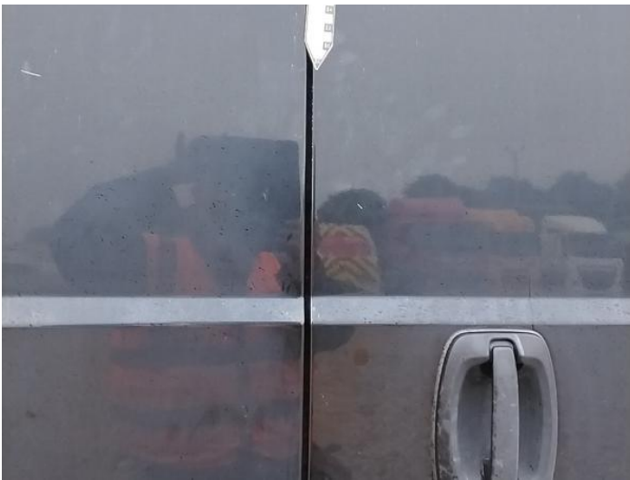
11: Door osr Chipped Edge Chip