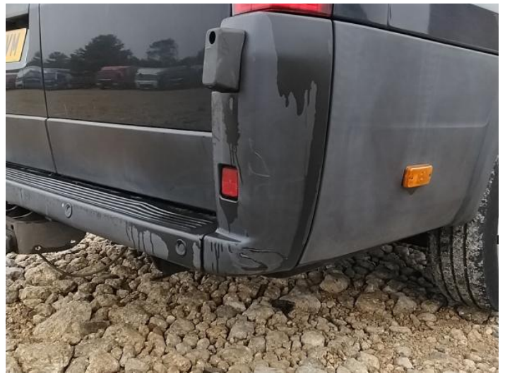
12: Bumper Rear Moulding Scuffed (Unpainted) UpTo 100mm