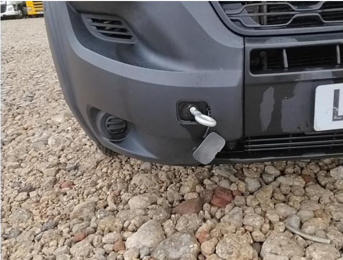
3: Other N/A N/A