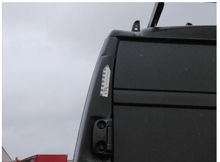
8: Panel Rear Dented Between 10mm + 30mm