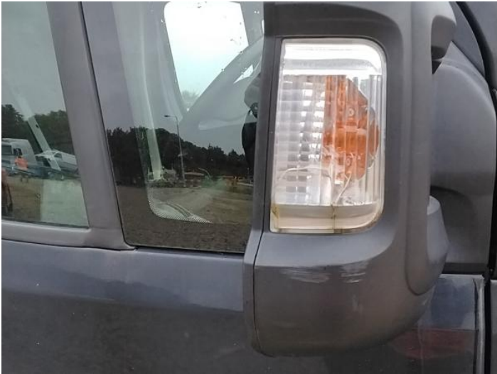
15: Flasher Side Repeater os Broken Replace