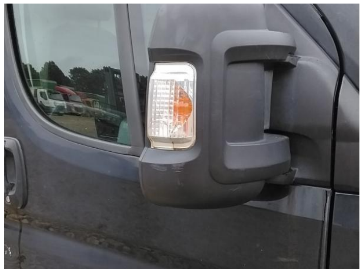
14: Door Mirror Assy osf Scuffed (Unpainted) UpTo 100mm