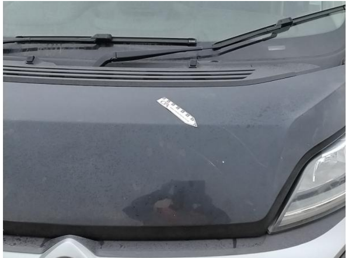
4: Bonnet Scratched UpTo 25mm Thru Paint