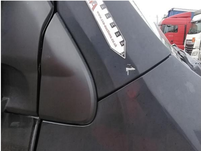
16: A Post os Scratched UpTo 25mm Thru Paint