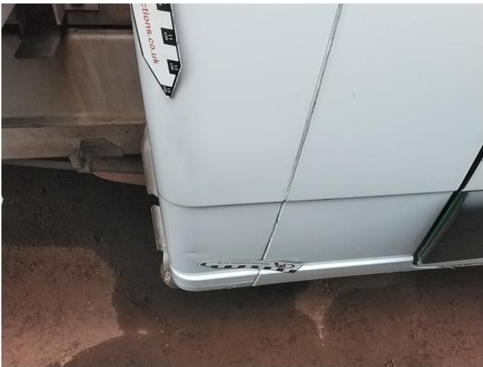
5: B Post os Dented Over 30mm