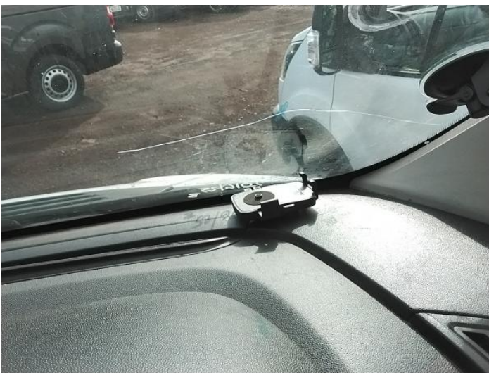
7: Screen Front Cracked Replace