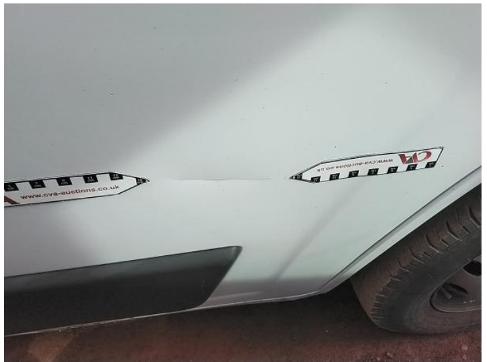
6: Door osf Dented With Paint Damage