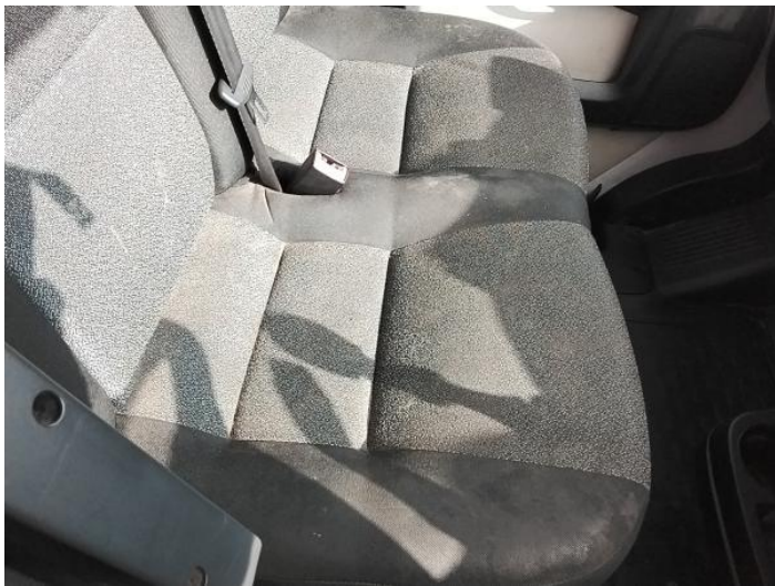
11: Seat Base Cover nsf Soiled Heavy