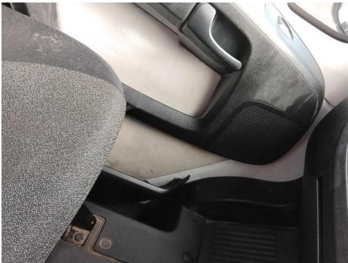
12: Door Pad nsf Soiled Heavy