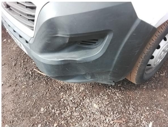
2: Bumper Front Cracked Over 25mm