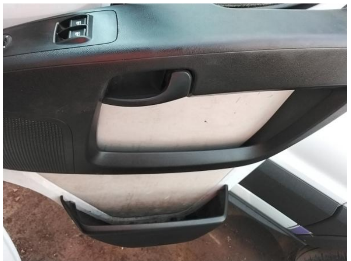
8: Door Pad osf Soiled Heavy