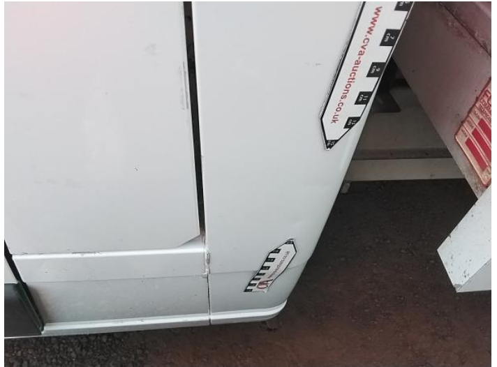
4: B Post ns Dented Over 30mm