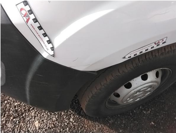
3: Wing nsf Dented With Paint Damage