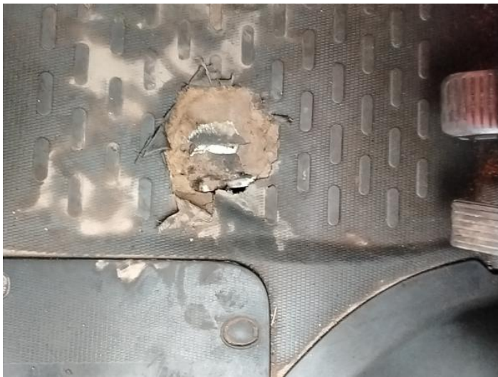
9: Carpets Front Holed Over 3mm