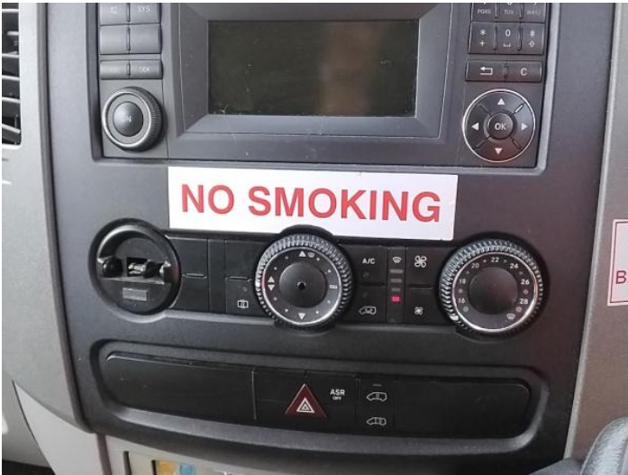
11: Other N/A N/A