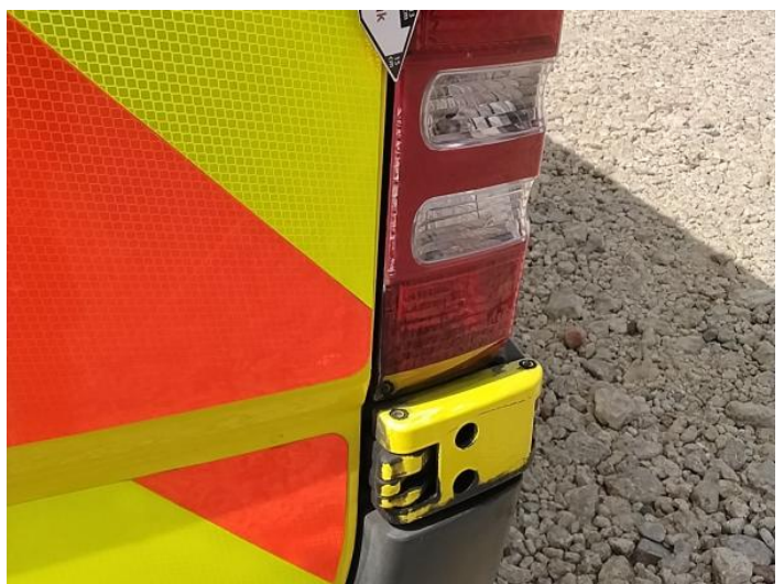
8: Lamp osr Broken Replace