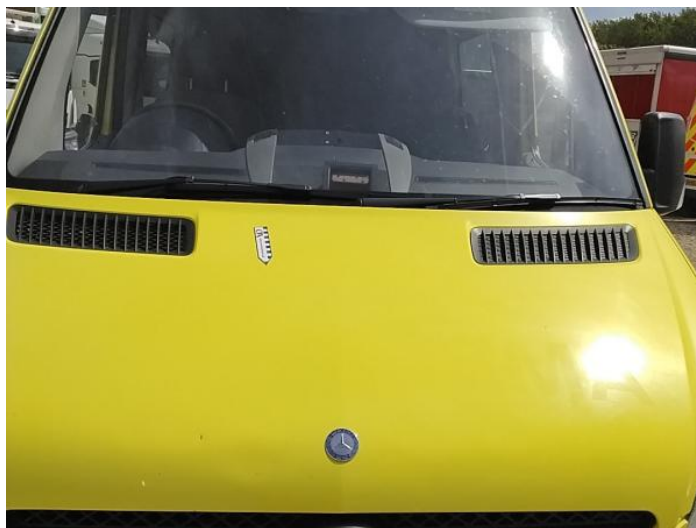
2: Bonnet Chipped Multiple Chips