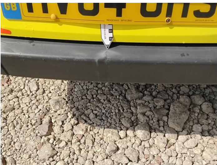
7: Bumper Rear Dented Over 2 UpTo 10mm