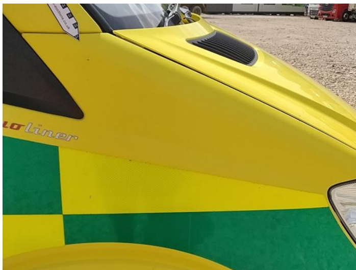
1: Wing of Chipped 1 To 5