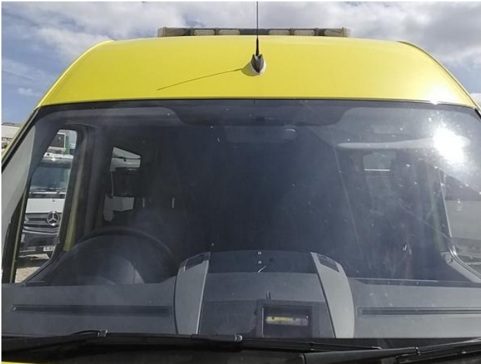
3: Screen Front Chipped UpTo 10mm