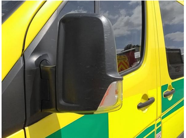
4: Door Mirror Assy nsf Scuffed (Unpainted) Over 100mm