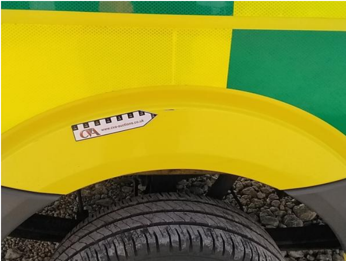
9: Other N/A N/A