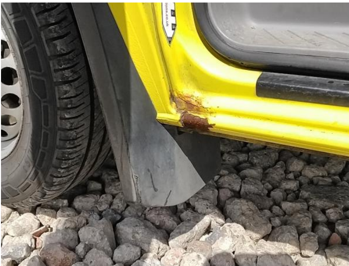
5: Sill ns Rusted Over 5mm