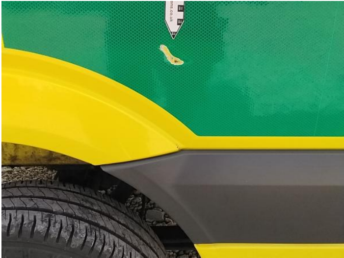
10: Qtr Panel osr Dented With Paint Damage