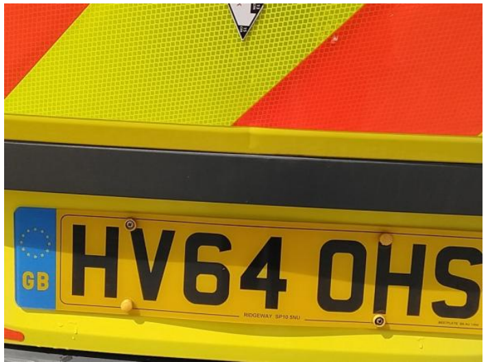
6: Door nsr Dented 2 Or Less UpTo 10mm