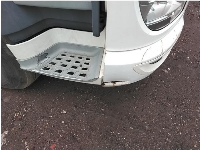
4: Bumper Front Dented With Paint Damage