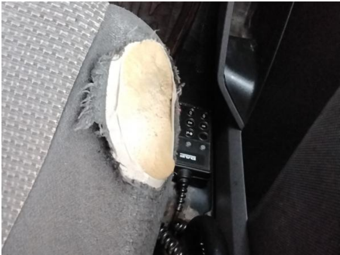
6: Seat Base Cover osf Holed Over 3mm