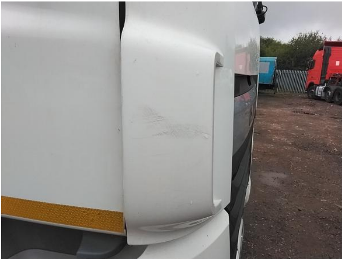
5: Panel Front Scratched Over 25mm Not Thru Paint