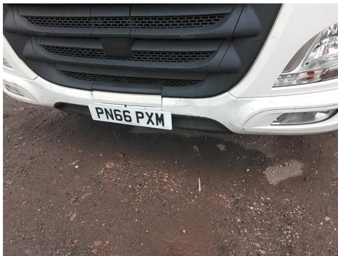
2: Bumper Front Chipped Multiple Chips