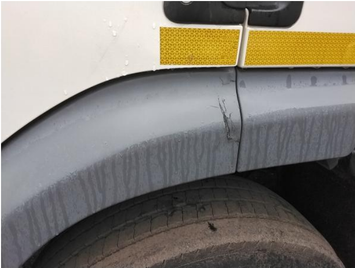
3: Wing nsf Cracked Replace