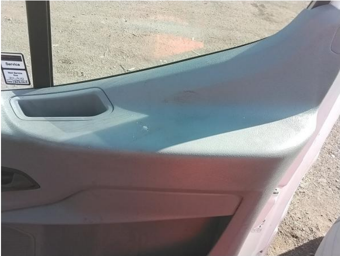
5: Door Pad osf Soiled Heavy