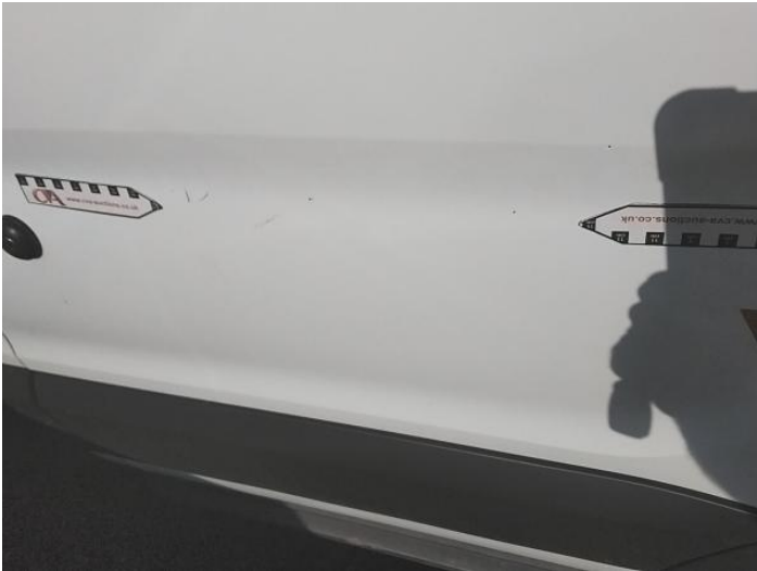
3: Door osf Scratched Over 25mm Thru Paint