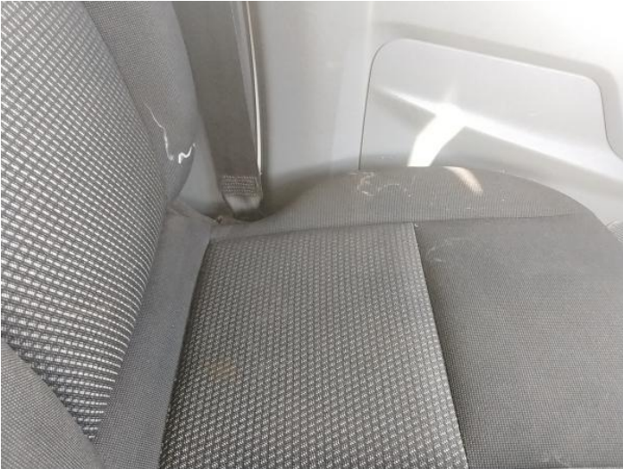
6: Seat Base Cover nsf Soiled Heavy