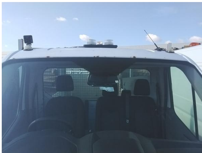
2: Roof Chipped Multiple Chips