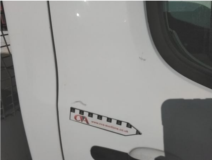
4: Door osf Scratched Over 25mm Not Thru Paint