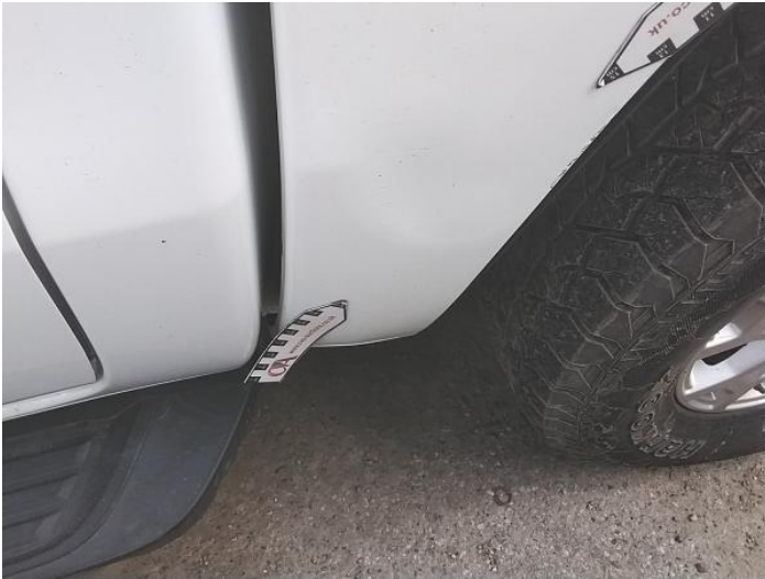
3: Qtr Panel nsr Dented Over 30mm