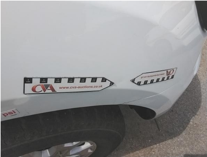
9: Wing osf Dented Over 30mm