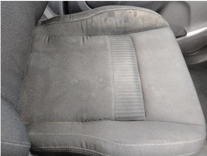
17: Seat Base Cover nsf Soiled Heavy