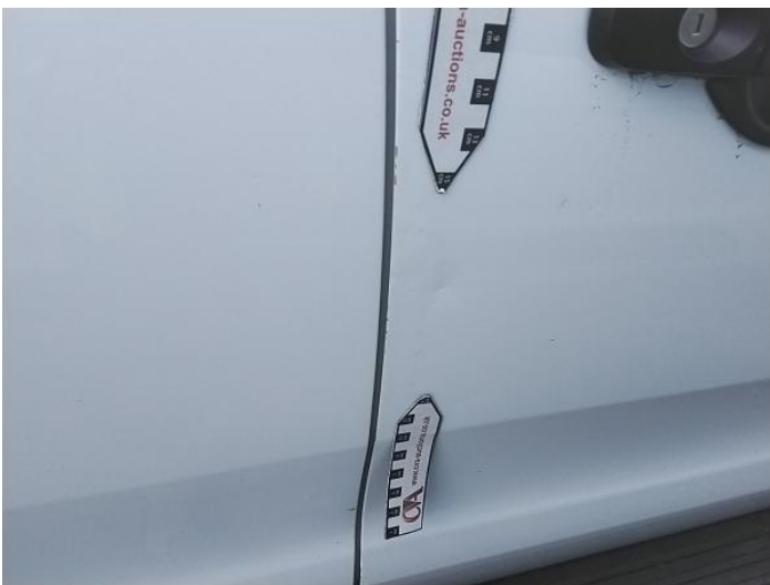
7: Door osf Dented Over 30mm