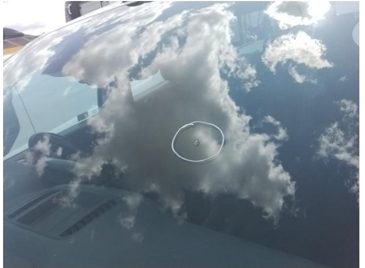
10: Screen Front Chipped Over 10mm