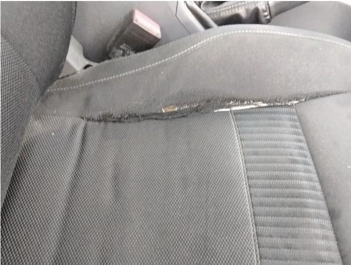
16: Seat Base Cover osf Torn Over 3mm