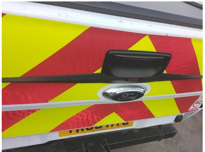
6: Tailgate Chipped Multiple Chips