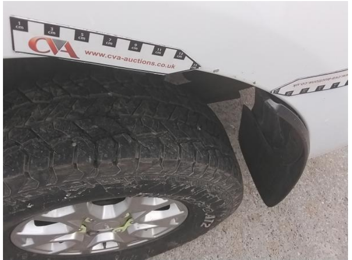
4: Qtr Panel nsr Scratched Over 25mm Thru Paint