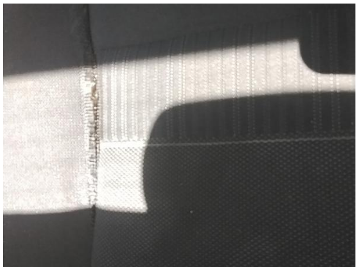
14: Seat Base Cover osr Soiled Heavy