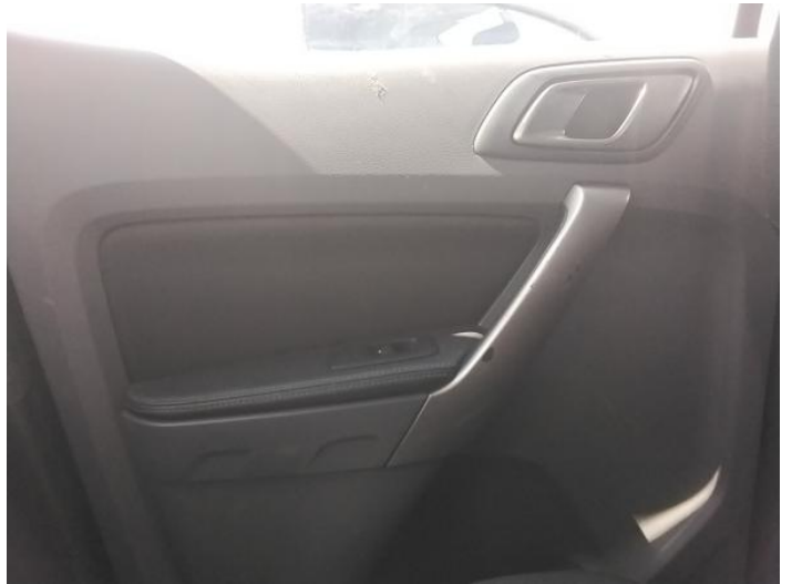
12: Door Pad nsr Scuffed Over 25mm