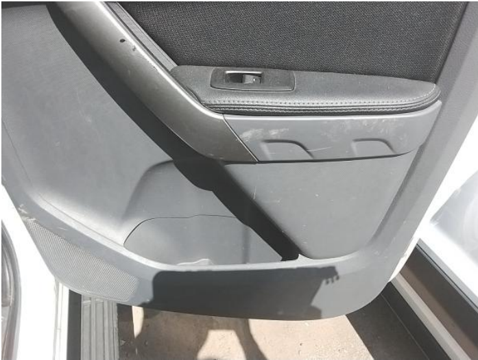
15: Door Pad osr Scuffed Over 25mm