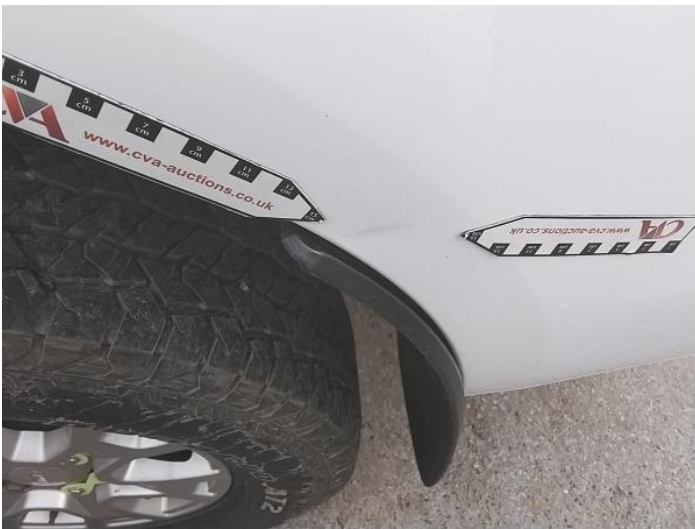
5: Qtr Panel nsr Dented With Paint Damage