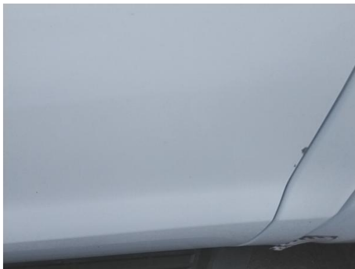
2: Door nsr Chipped Edge Chip