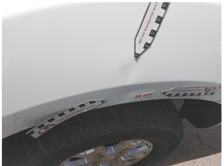
8: Wing osf Dented Over 30mm