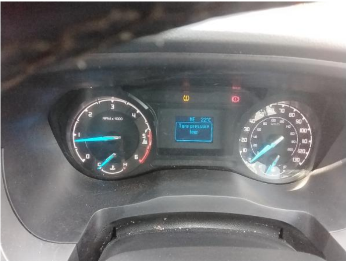
18: Dash Warning Lights Displayed No Action