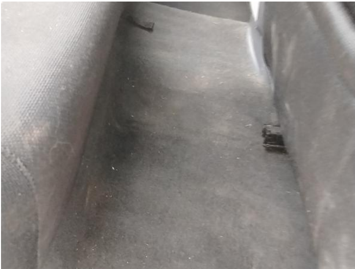
11: Carpets Rear Soiled Heavy