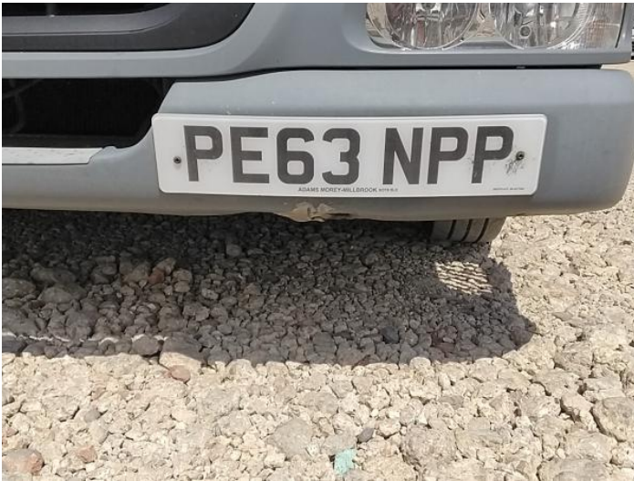
5: Bumper Front Dented With Paint Damage