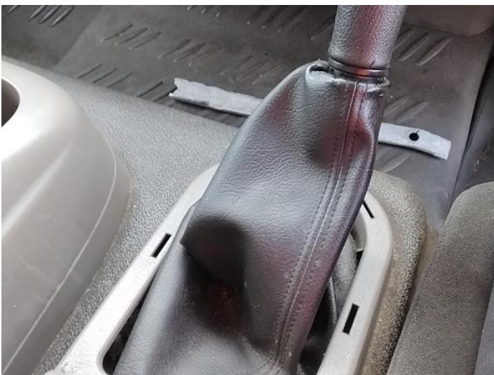
13: Other N/A N/A