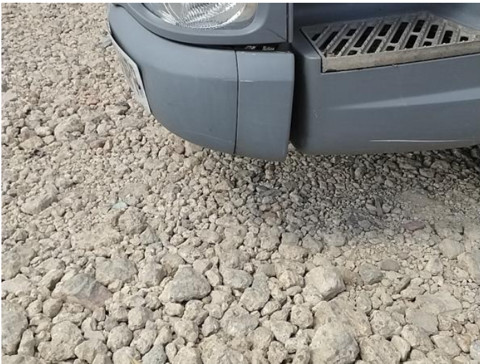
7: Bumper Front Scratched 25 to 100mm Thru Paint