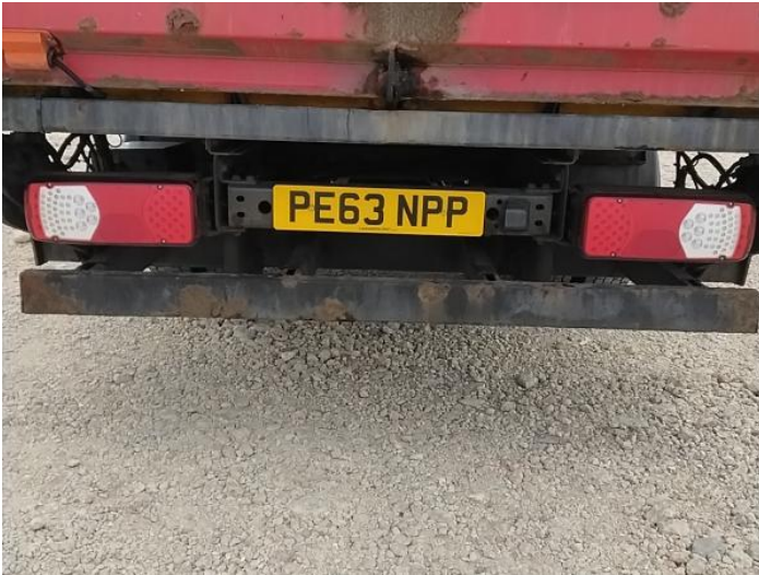
9: Bumper Rear Rusted Over 5mm