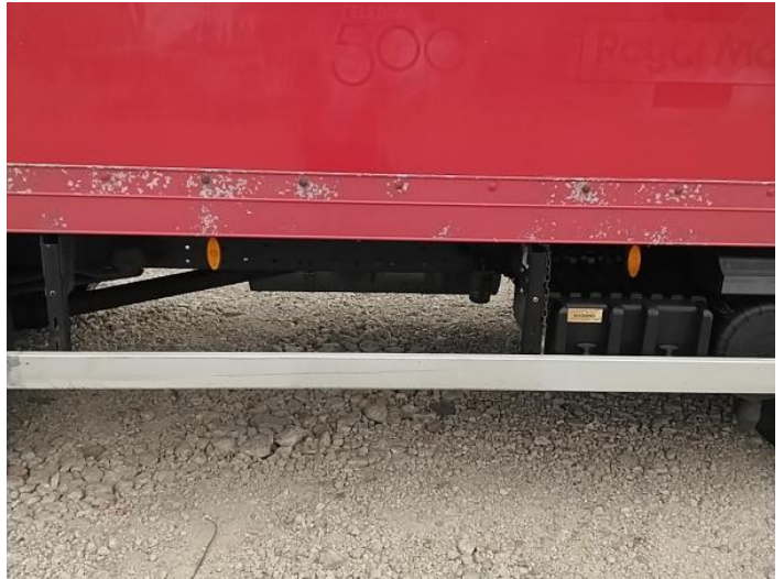
10: Other N/A N/A