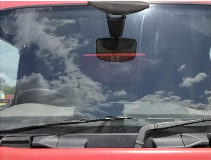
4: Screen Front Chipped UpTo 10mm