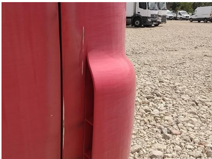
1: Wing osf Scratched Over 25mm Thru Paint