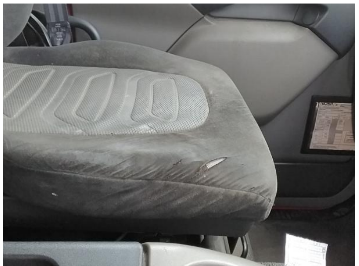
14: Seat Base Cover nsf Torn Over 3mm