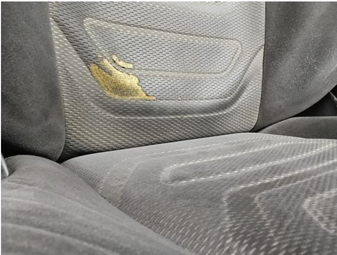
11: Seat Back Cover osf Scuffed Over 25mm