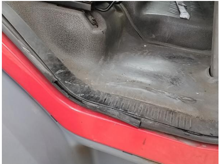
12: Other N/A N/A