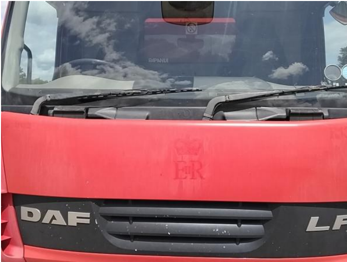
3: Bonnet Chipped Multiple Chips