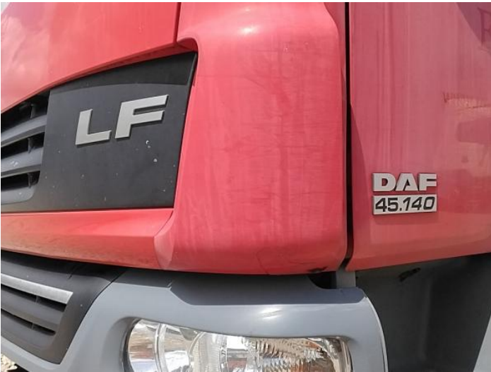
6: Wing nsf Cracked Replace