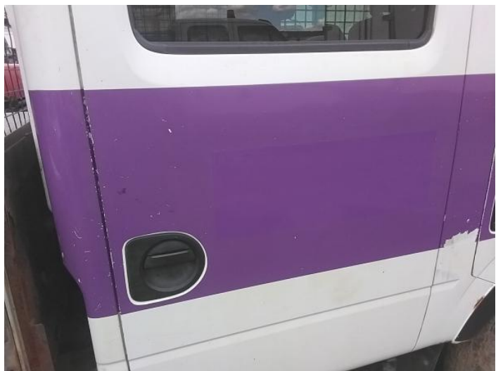
8: Door osr Chipped Multiple Chips