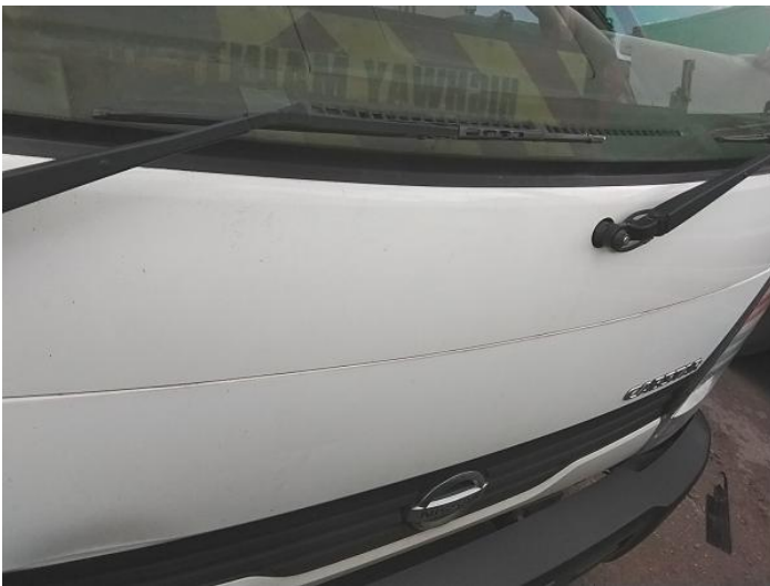
11: Bonnet Chipped Multiple Chips