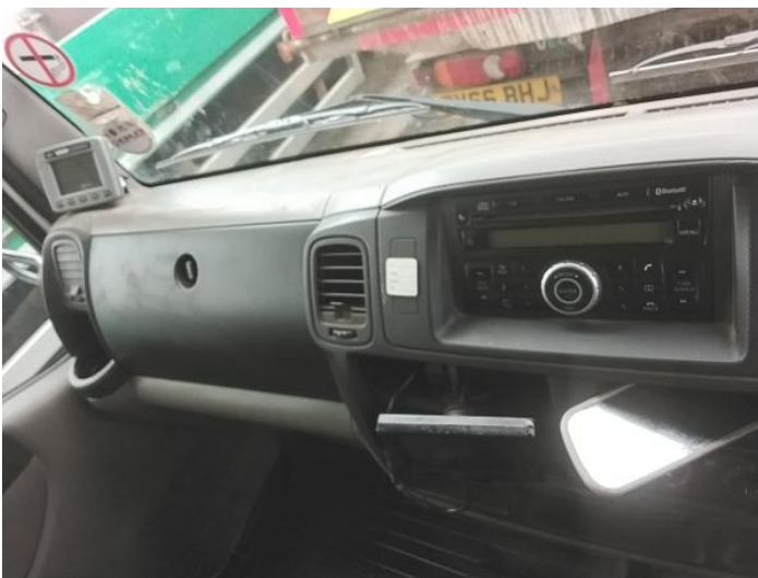
19: Fascia Panel Soiled Heavy