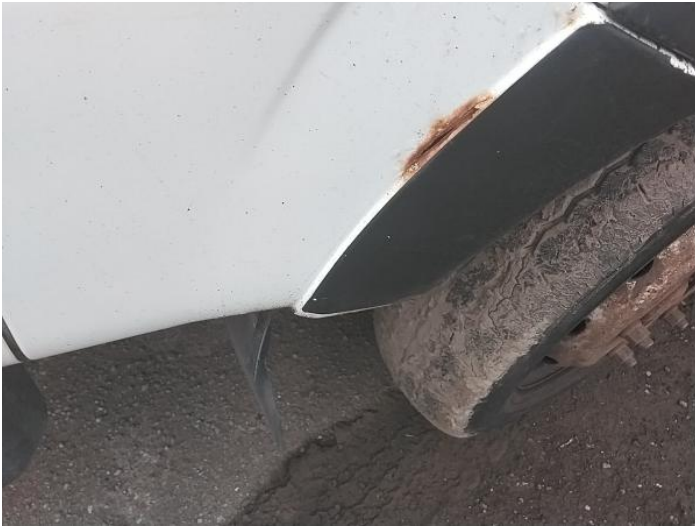
9: B Post os Rusted Holed