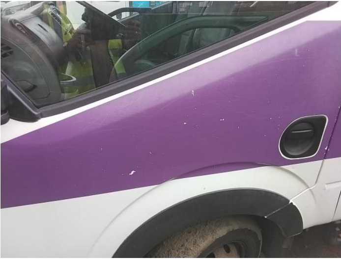
3: Door nsf Chipped Multiple Chips