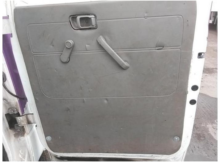
16: Door Pad osr Holed Over 3mm