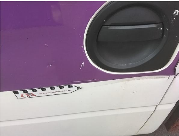
5: Door nsr Dented With Paint Damage