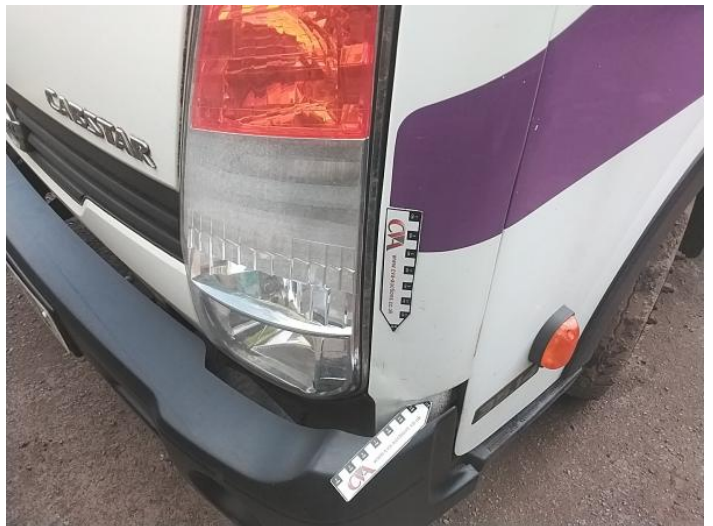
2: Panel Front Dented With Paint Damage