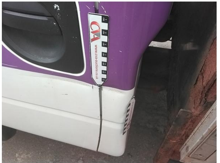
6: C Post ns Dented With Paint Damage