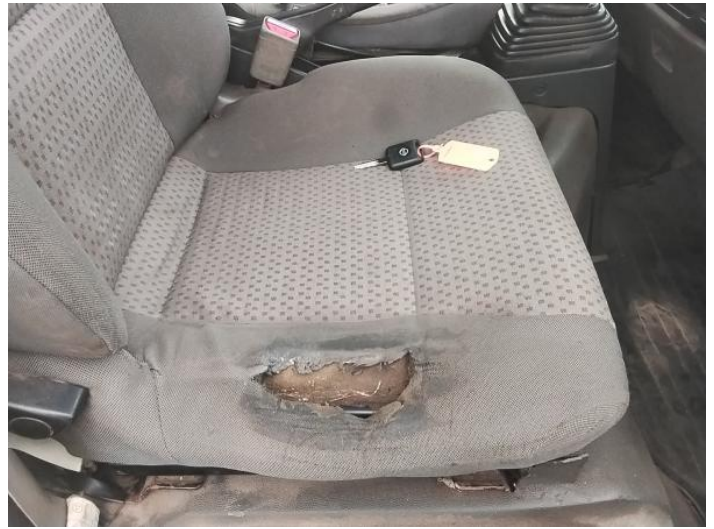
18: Seat Base Cover osf Holed Over 3mm