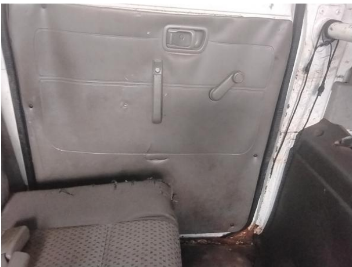
13: Door Pad nsr Holed Over 3mm