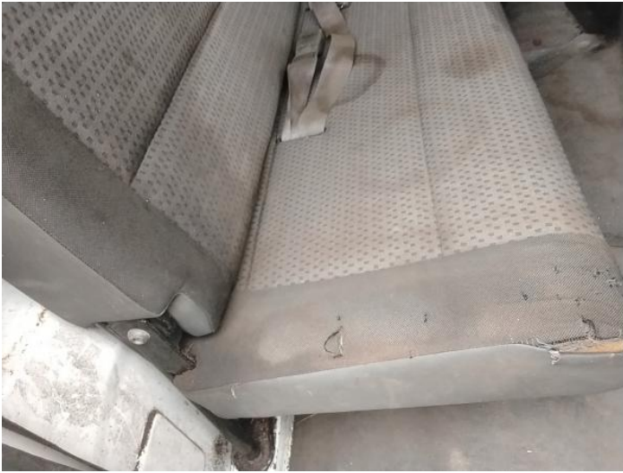
15: Seat Base Cover osr Torn Over 3mm