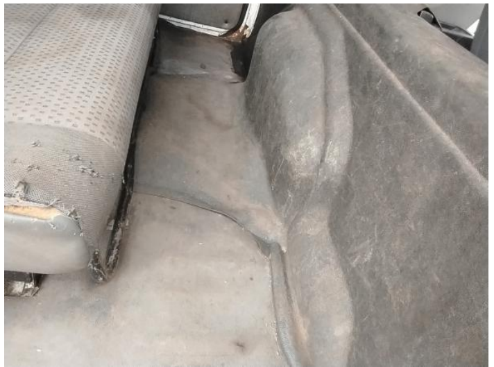
12: Carpets Rear Soiled Heavy