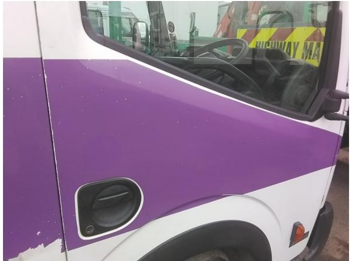
10: Door osf Chipped Multiple Chips