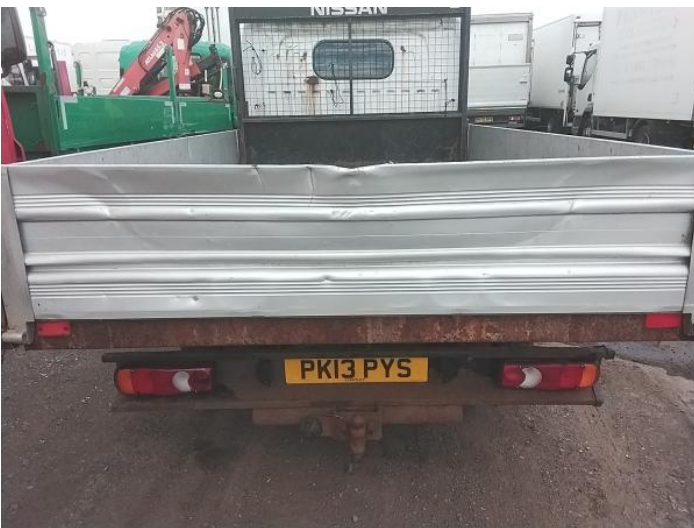
7: Tailgate Dented Over 30% Of Panel