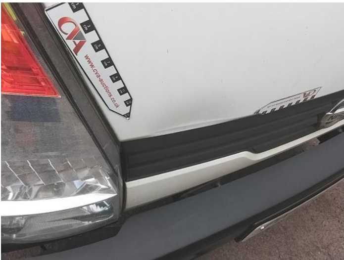
1: Bonnet Dented Over 30mm