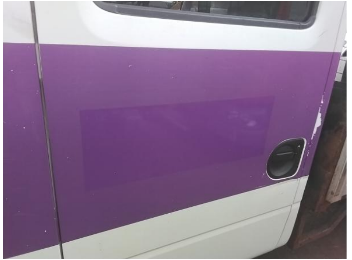
4: Door nsr Chipped Multiple Chips