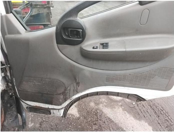
17: Door Pad osf Soiled Heavy