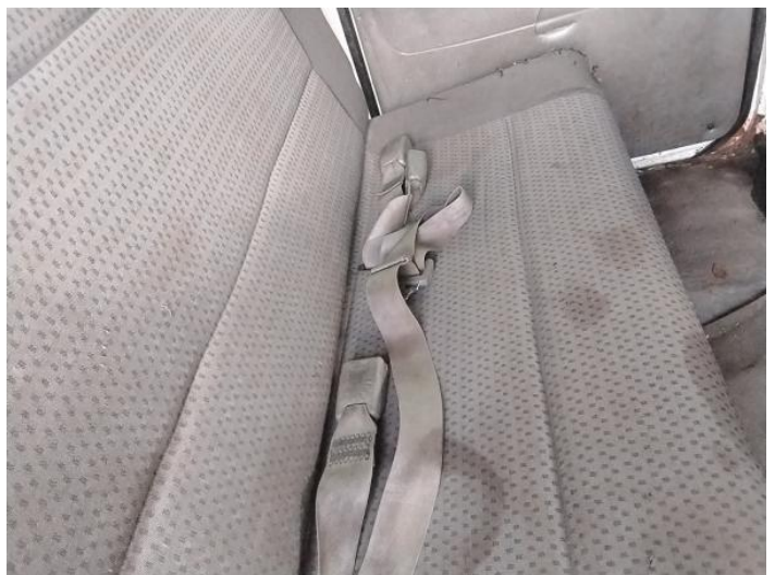
14: Seat Base Cover nsr Soiled Heavy