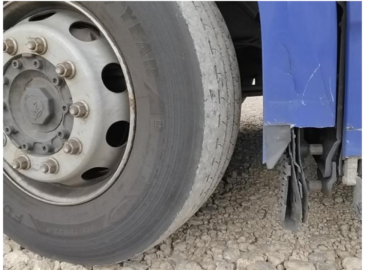
10: Wing Front Arch Extension ns Broken Replace