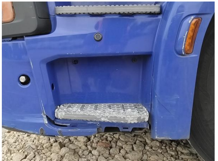
6: Other N/A N/A