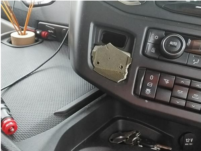
16: Other N/A N/A