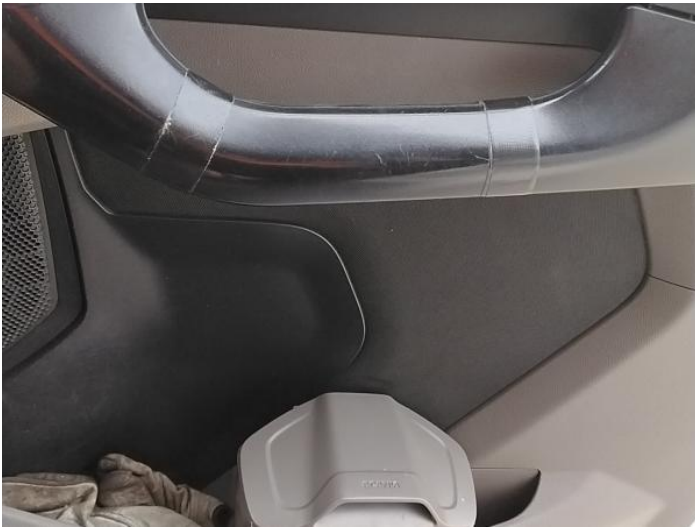
17: Handle Inner osf Damaged Replace