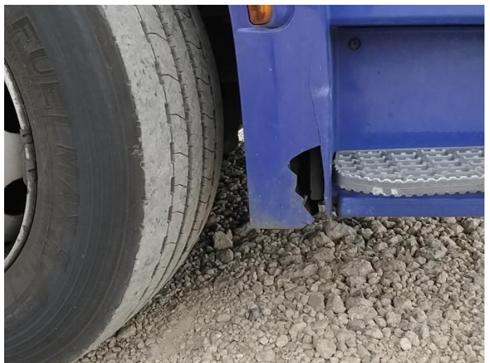
14: Other N/A N/A