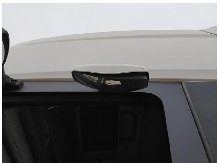
8: Door Mirror Assy nsf Scratched (Painted) UpTo 25mm Thru Paint