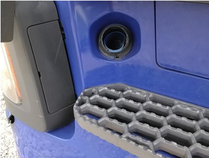
9: Other N/A N/A