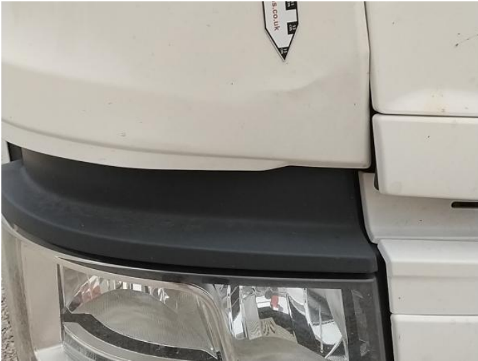
3: Wing osf Dented Over 30mm