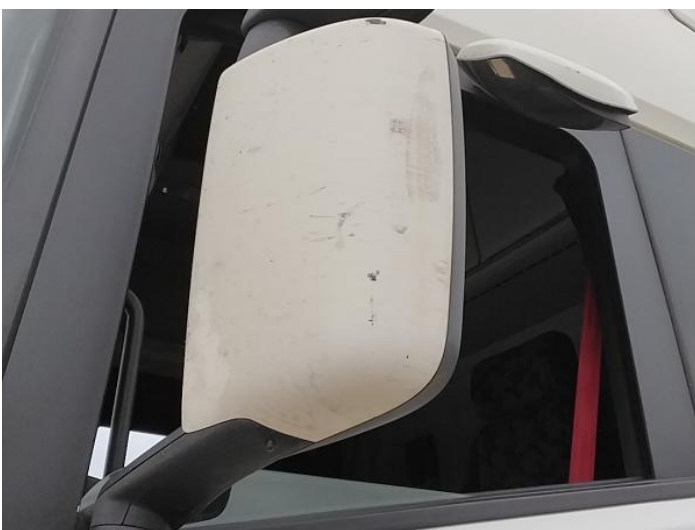
7: Door Mirror Assy nsf Scratched (Painted) Over 25mm Thru Paint