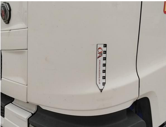
5: Wing nsf Poor Previous Repair Poor Paint