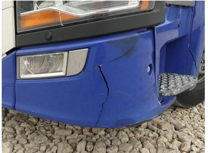
4: Bumper Front Cracked Over 25mm