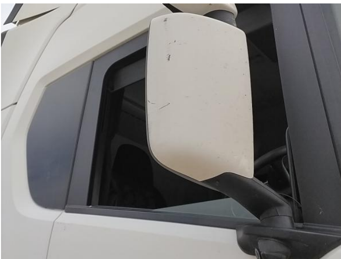
13: Door Mirror Assy osf Scratched (Painted) Over 25mm Thru Paint