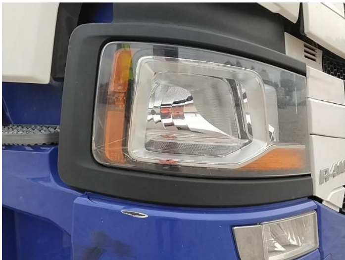
1: Headlamp os Broken Replace