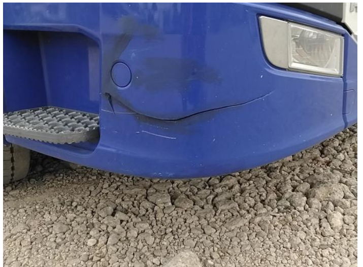
2: Bumper Front Cracked Over 25mm