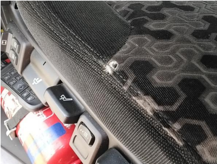
15: Seat Base Cover nsf Holed Over 3mm