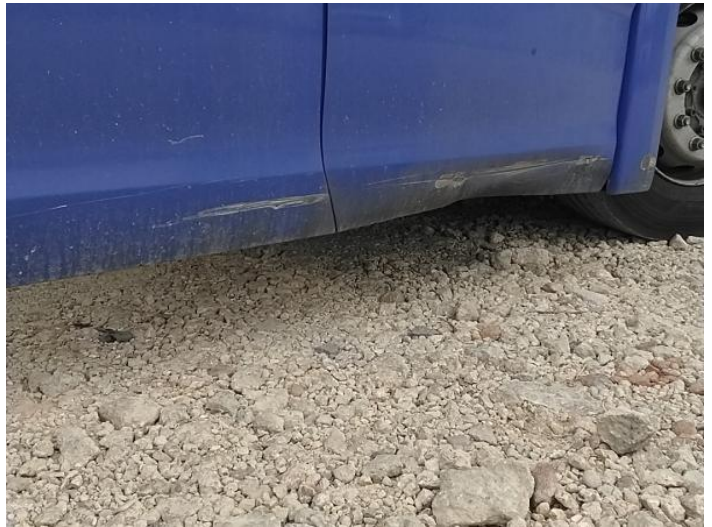
12: Other N/A N/A