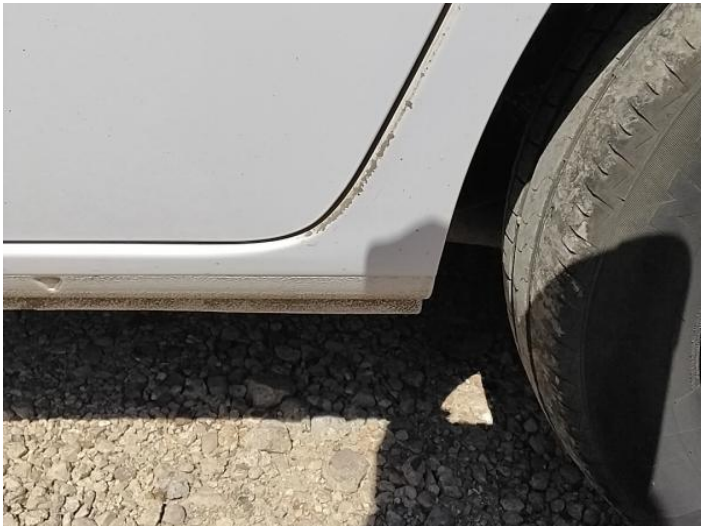
2: Door nsr Chipped Edge Chip

Carpet Condition Average Seat Condition Average