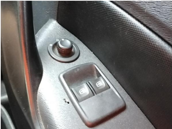
2: Door Pad osf Holed Over 3mm

Carpet Condition Average Seat Condition Average