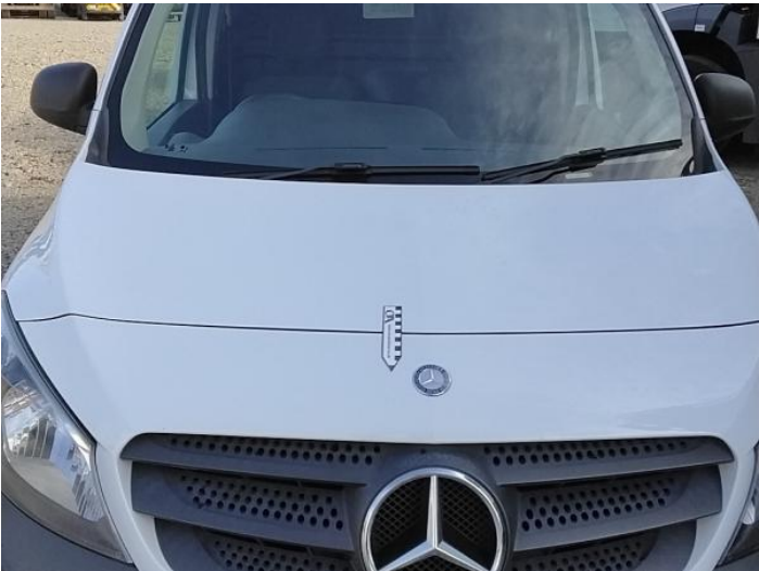
1: Panel Front Chipped Multiple Chips