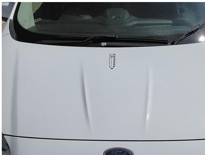
2: Bonnet Chipped Multiple Chips