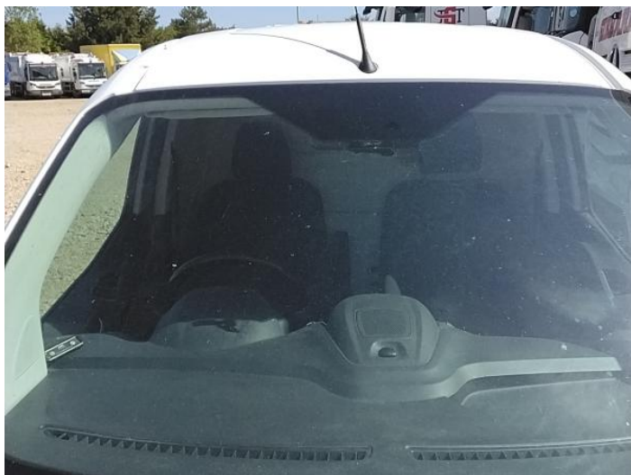
1: Screen Front Chipped Over 10mm