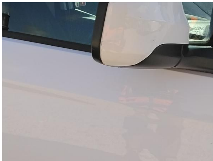
4: Door Mirror Assy osf Scratched (Painted) UpTo 25mm Thru Paint