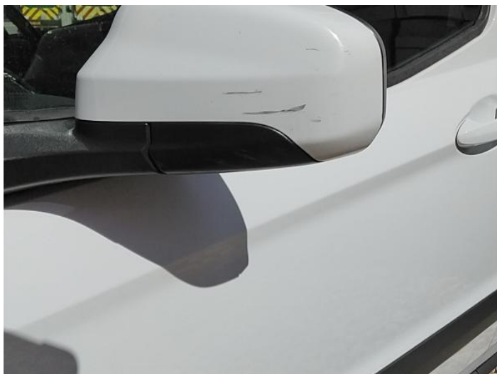
3: Door Mirror Assy nsf Scratched (Painted) Over 25mm Not Thru Paint