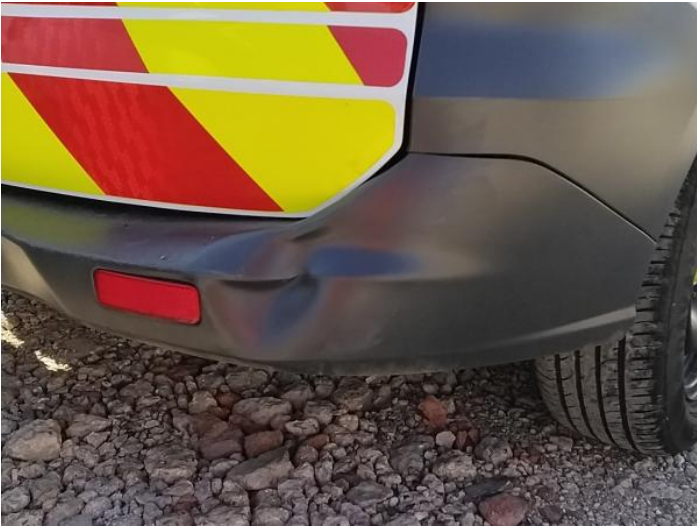
4: Bumper Rear Dented Over 30mm