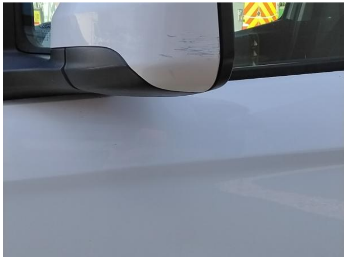
2: Door Mirror Assy nsf Scratched (Painted) Over 25mm Thru Paint