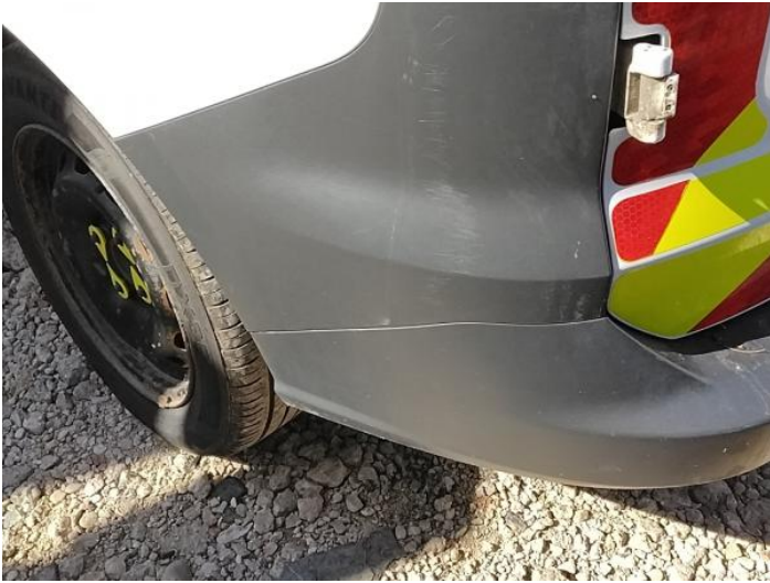
3: Qtr Panel Arch Extension ns Scuffed (Unpainted) Over 100mm