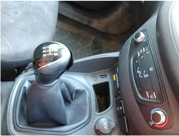
5: Other N/A N/A