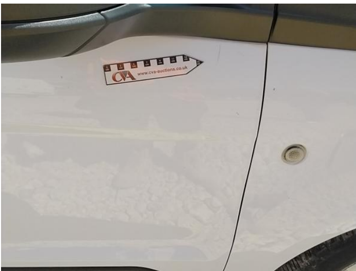
7: Door osf Scratched UpTo 25mm Thru Paint