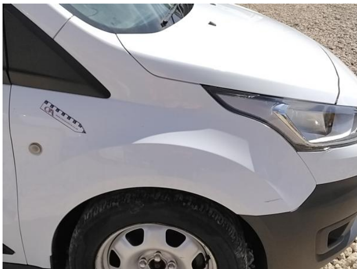
1: Wing of Scratched Over 25mm Not Thru Paint