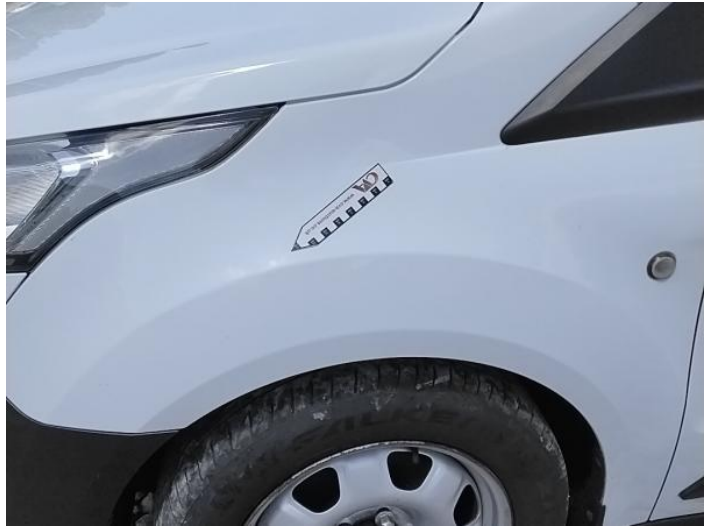
4: Wing nsf Chipped Multiple Chips