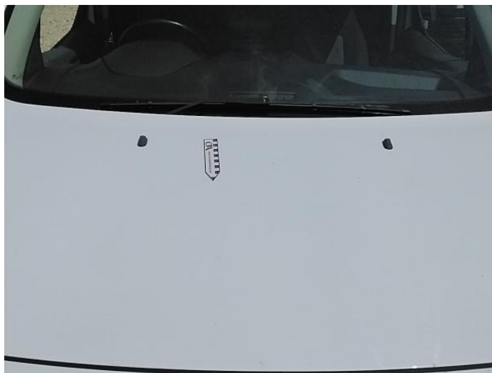
2: Bonnet Chipped Multiple Chips