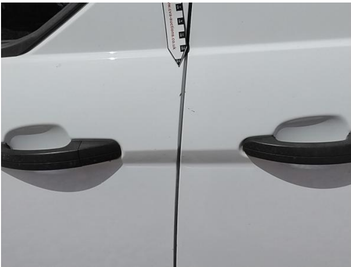
5: Door nsf Chipped Edge Chip