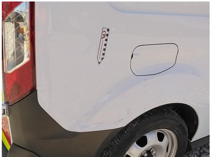
6: Qtr Panel osr Dented With Paint Damage