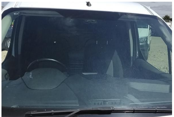
8: Screen Front Chipped UpTo 10mm