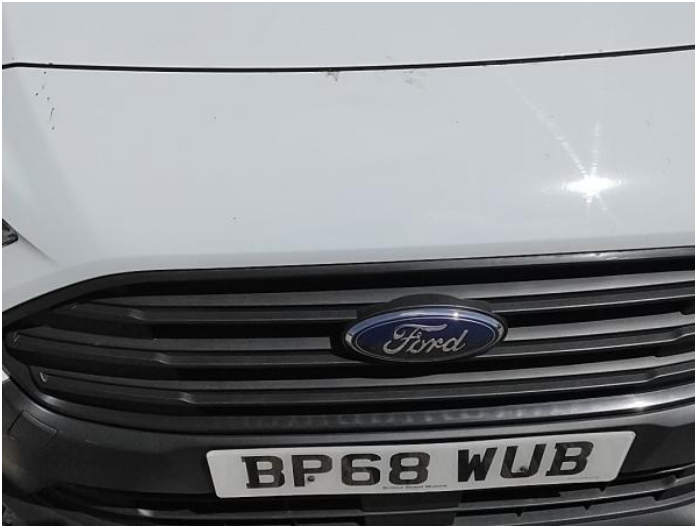
3: Panel Front Chipped Multiple Chips