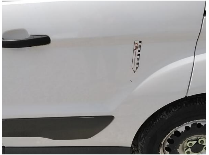
10: Door nsr Scratched UpTo 25mm Thru Paint