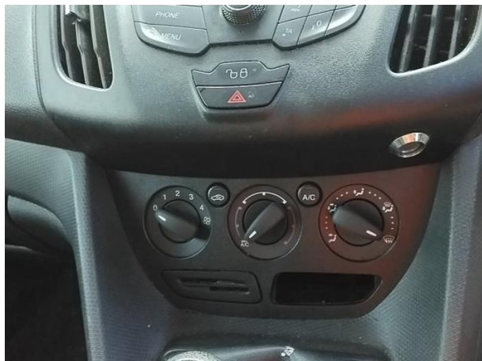
15: Centre Console Front