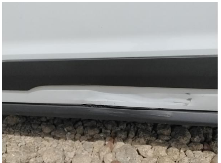
8: Door nsf Dented With Paint Damage