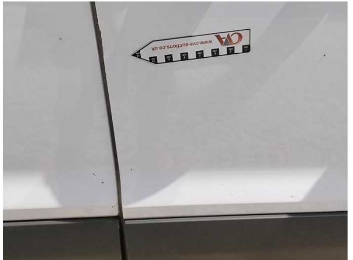
12: Door osf Dented With Paint Damage