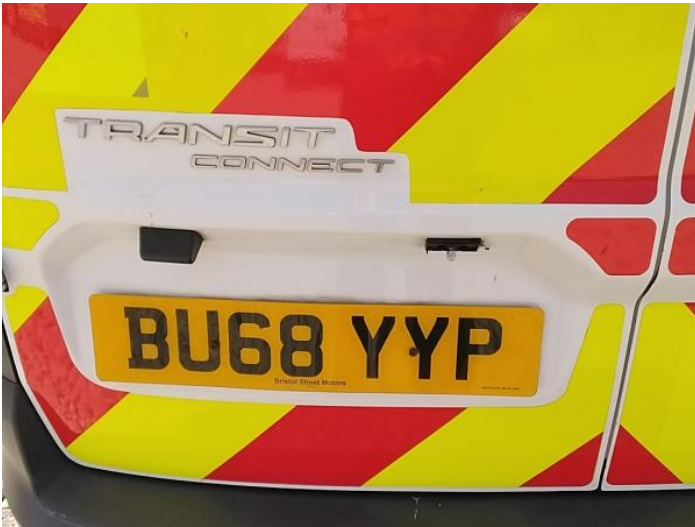
11: Other N/A N/A