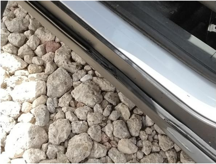
9: Other N/A N/A