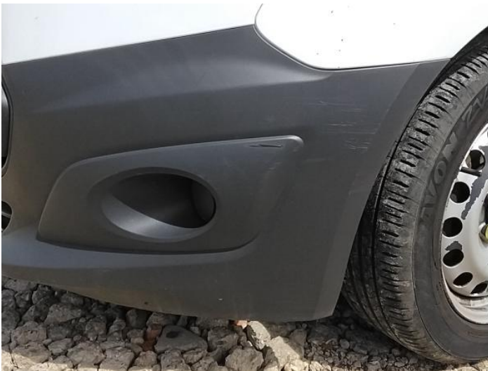
5: Bumper Front Scratched Over 25mm Not Thru Paint