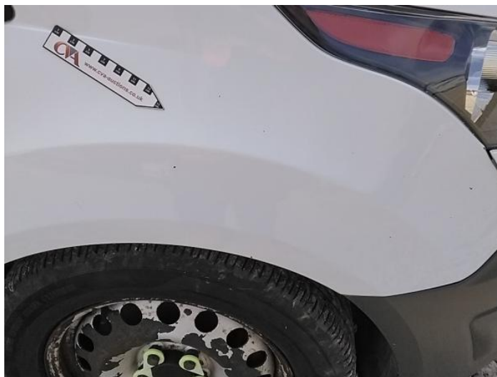
2: Wing osf Chipped Multiple Chips