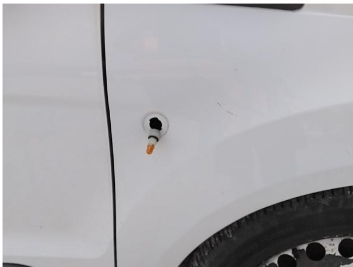
1: Flasher Side Repeater os Broken Replace