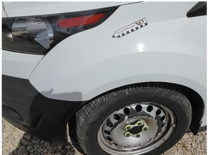
6: Wing nsf Chipped Multiple Chips