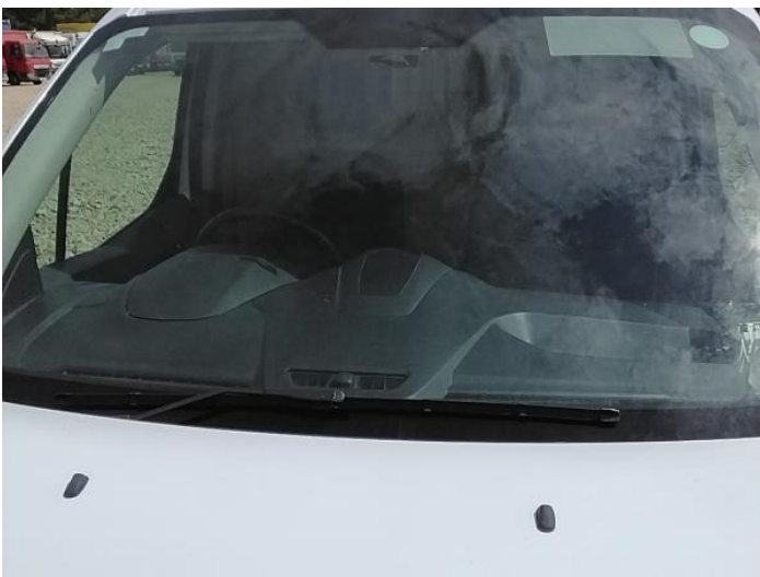
7: Screen Front Chipped UpTo 10mm