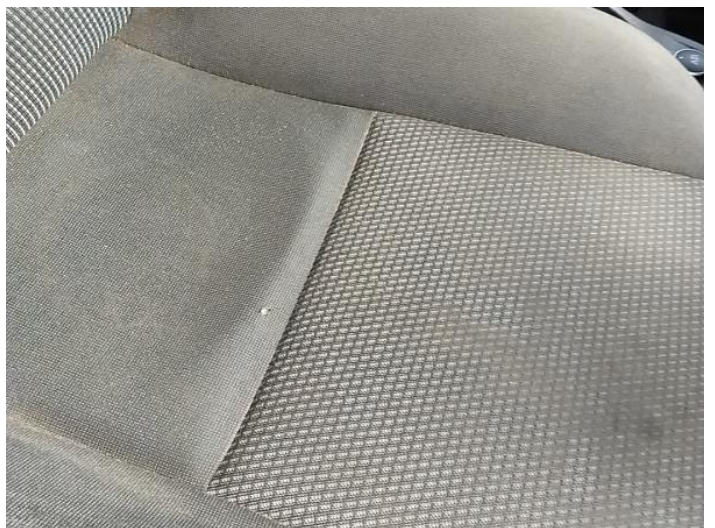
14: Seat Base Cover osf Burn Over 3mm