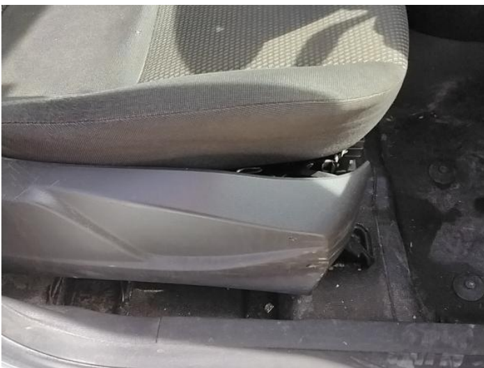
13: Other N/A N/A