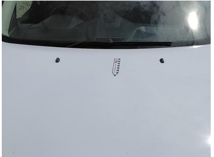
4: Bonnet Chipped Multiple Chips