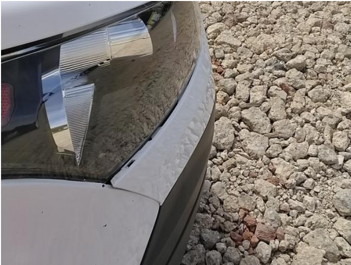
3: Panel Front Chipped Multiple Chips