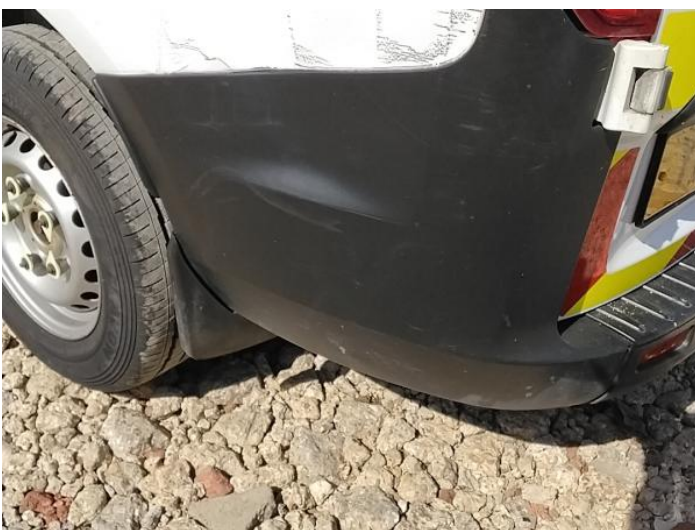
7: Qtr Panel Arch Extension ns Scuffed (Unpainted) Over 100mm