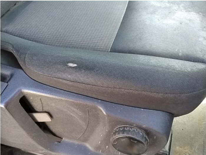
10: Seat Base Cover osf Holed Over 3mm