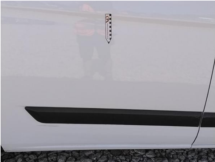
9: Qtr Panel osr Dented 2 Or Less UpTo 10mm