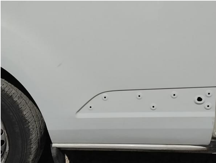
3: Door Moulding nsf Missing Replace