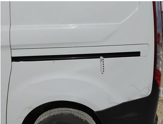
5: Qtr Panel nsr Dented With Paint Damage