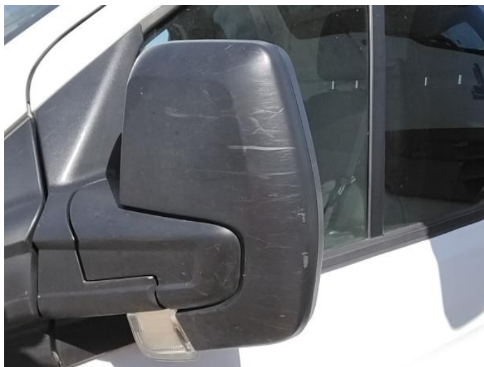
2: Door Mirror Assy nsf Scuffed (Unpainted) Over 100mm