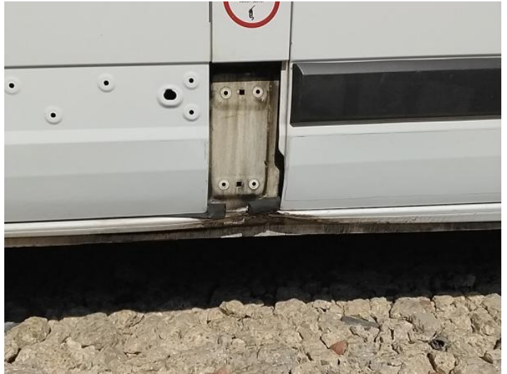
4: Sill ns Dented Over 30mm