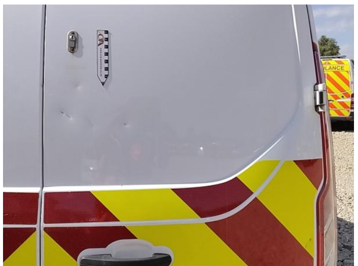
8: Door osr Dented With Paint Damage