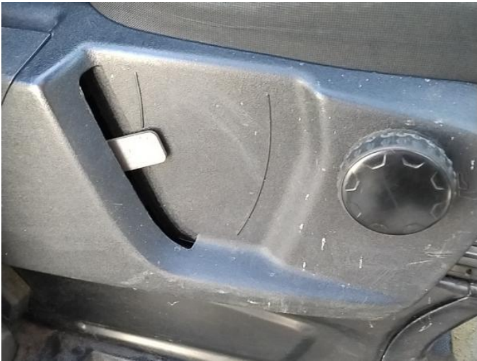
11: Other N/A N/A