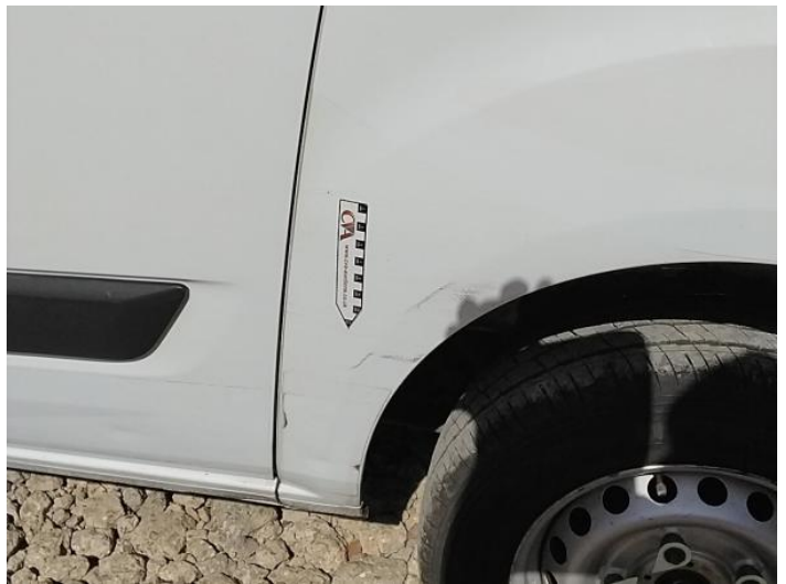
6: Qtr Panel nsr Dented Over 2 UpTo 10mm