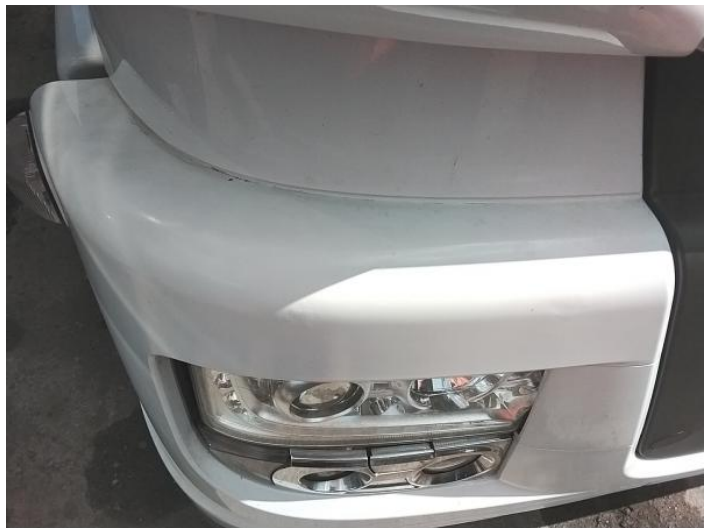
2: Panel Front Poor Previous Repair Rippled UpTo 30%