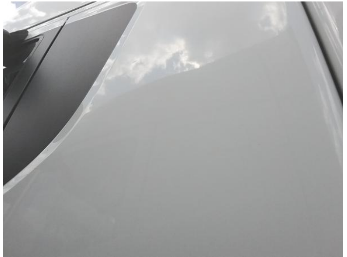
6: Qtr Panel nsr Scratched Over 25mm Not Thru Paint