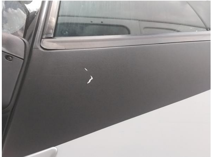
4: Door nsf Scratched Over 25mm Thru Paint