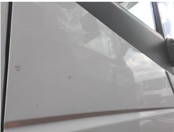
7: Door osf Chipped Multiple Chips