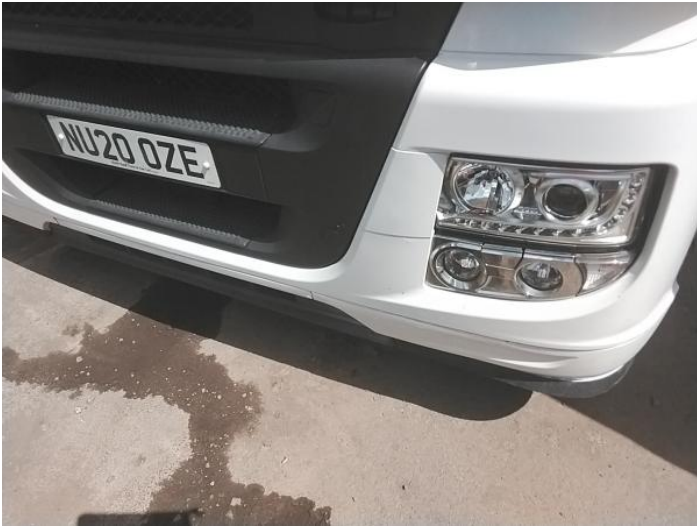
3: Bumper Front Chipped Multiple Chips