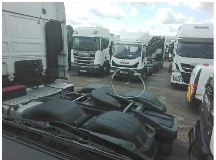
8: Screen Front Chipped Over 10mm