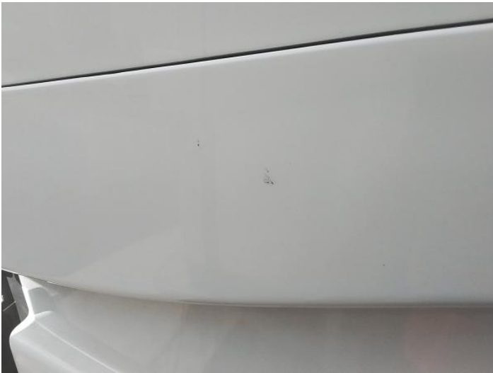
5: Door nsf Chipped Multiple Chips