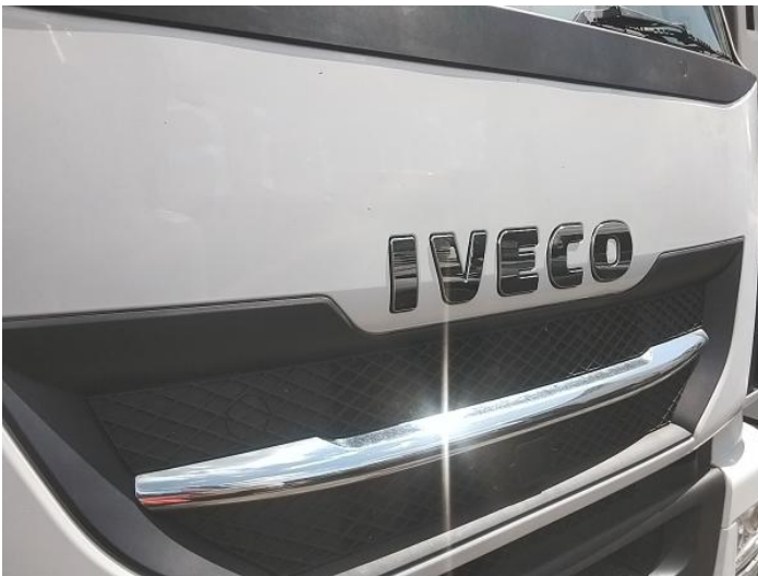
1: Bonnet Chipped Multiple Chips