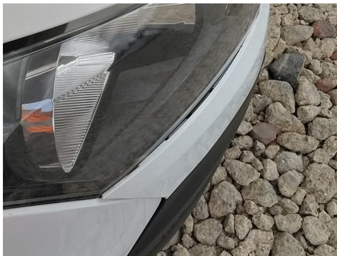
2: Other N/A N/A