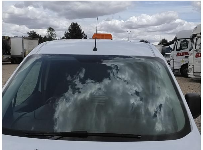
4: Screen Front Chipped Over 10mm