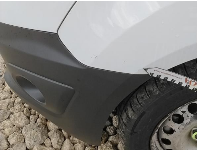
5: Wing nsf Dented Over 2 UpTo 10mm