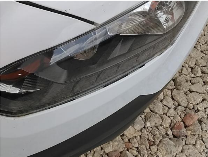
3: Other N/A N/A