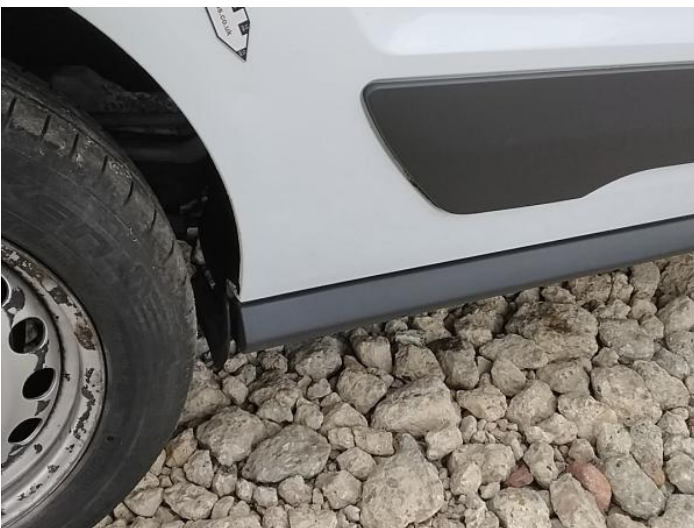
7: Qtr Panel osr Dented 2 Or Less UpTo 10mm