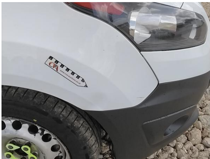
1: Wing of Dented Over 30mm