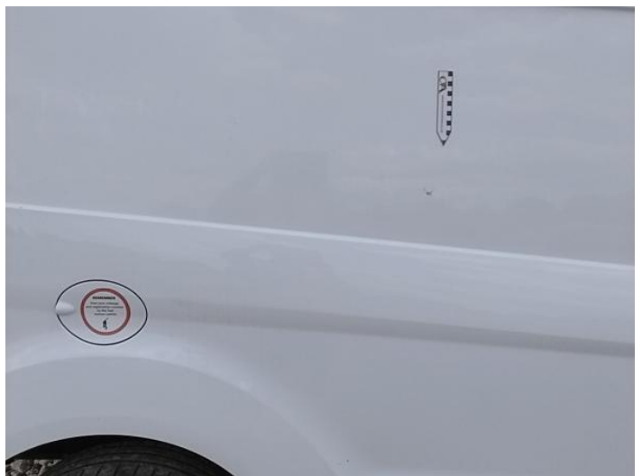
8: Qtr Panel osr Scratched UpTo 25mm Thru Paint