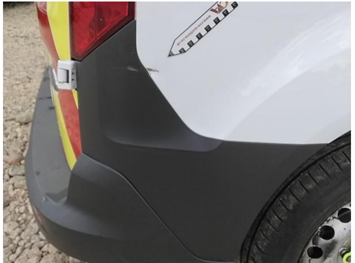
6: Qtr Panel osr Dented With Paint Damage