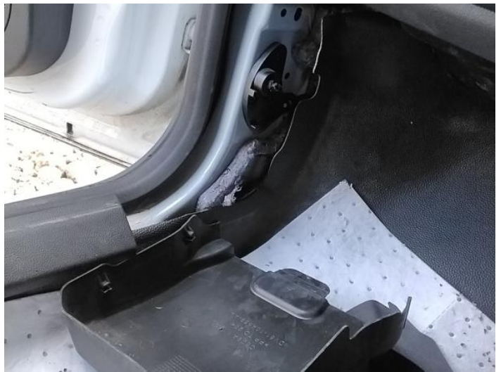
9: Carpets Front Holed Over 3mm