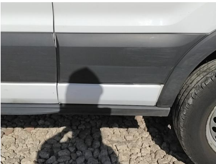
13: Qtr Panel Moulding ns Scuffed (Unpainted) Over 100mm