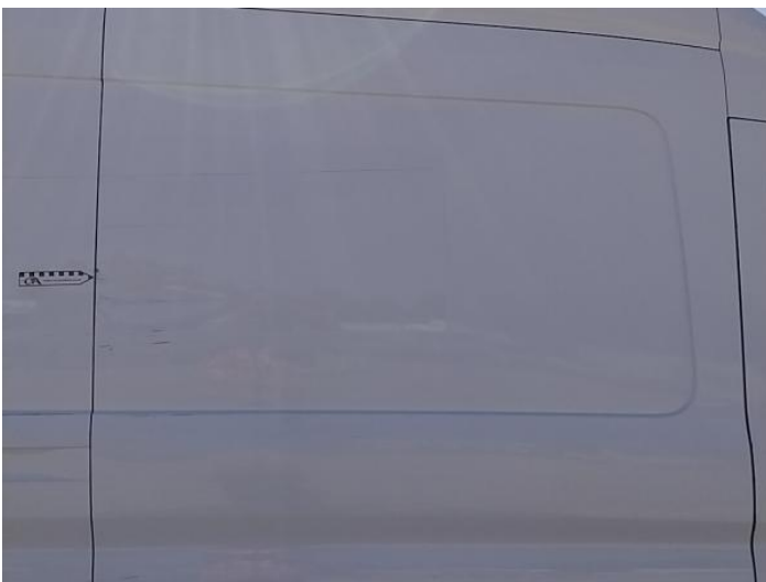
25: Qtr Panel osr Dented With Paint Damage