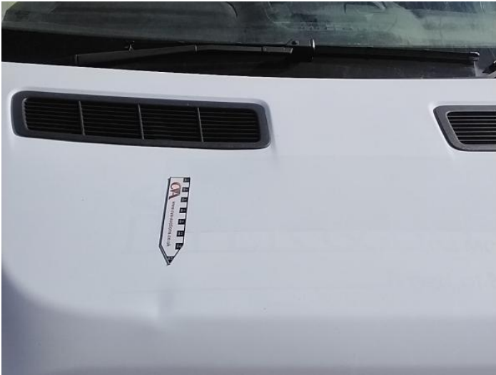
3: Bonnet Dented Between 10mm + 30mm