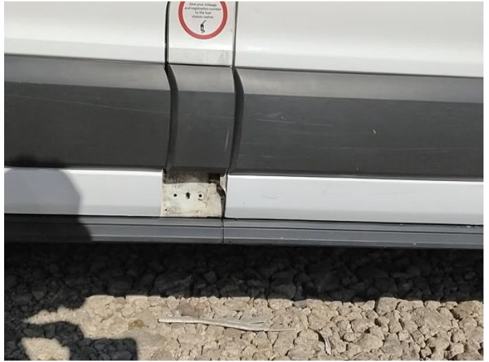
10: Other N/A N/A