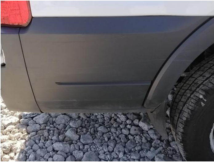
21: Qtr Panel Trim os Scuffed Over 25mm