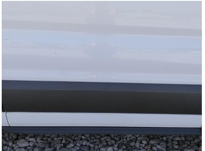
24: Qtr Panel Moulding os Scuffed (Unpainted) Over 100mm