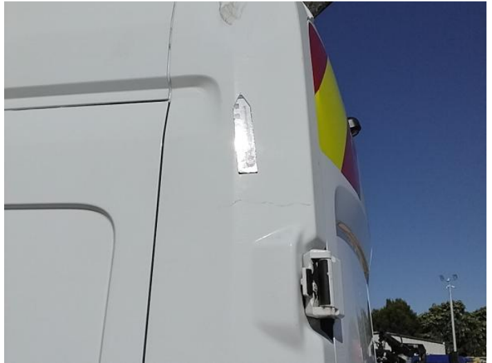
16: Qtr Panel nsr Dented With Paint Damage