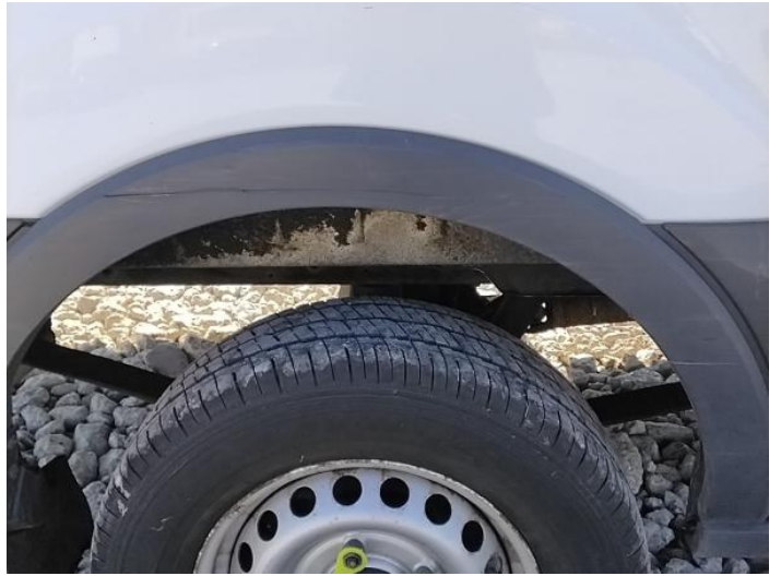
22: Qtr Panel Arch Extension os Scuffed (Unpainted) Over 100mm