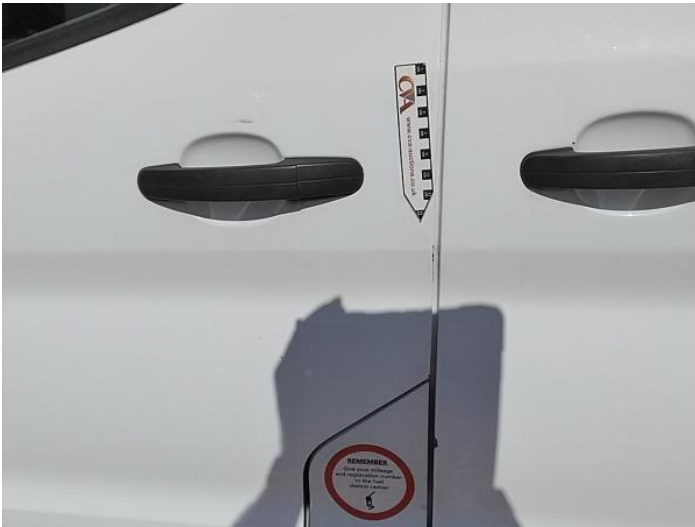
11: Door nsf Chipped Edge Chip