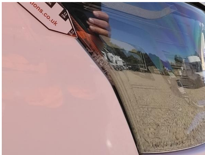
2: Headlamp os Broken Replace