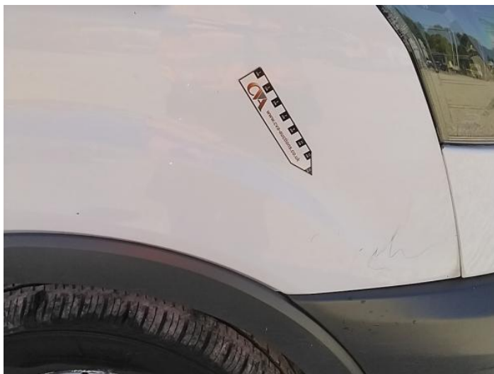
1: Wing osf Scratched Over 25mm Thru Paint