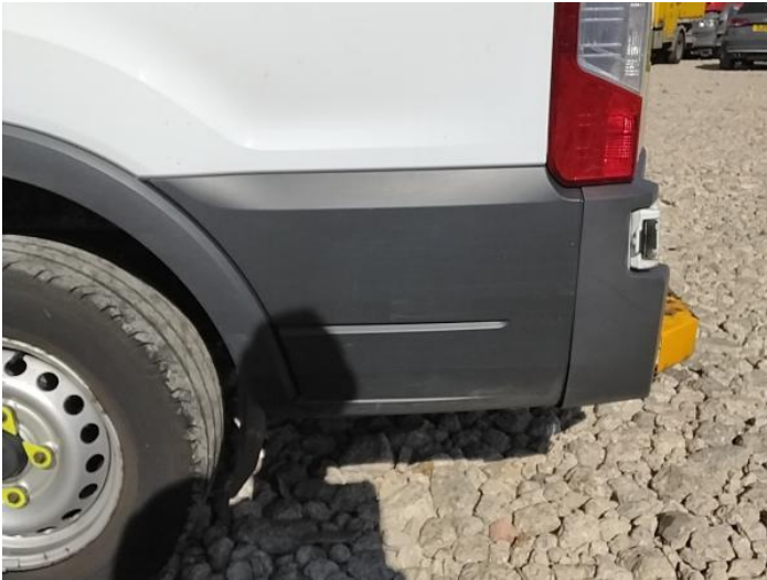
15: Qtr Panel Trim ns Scuffed Over 25mm