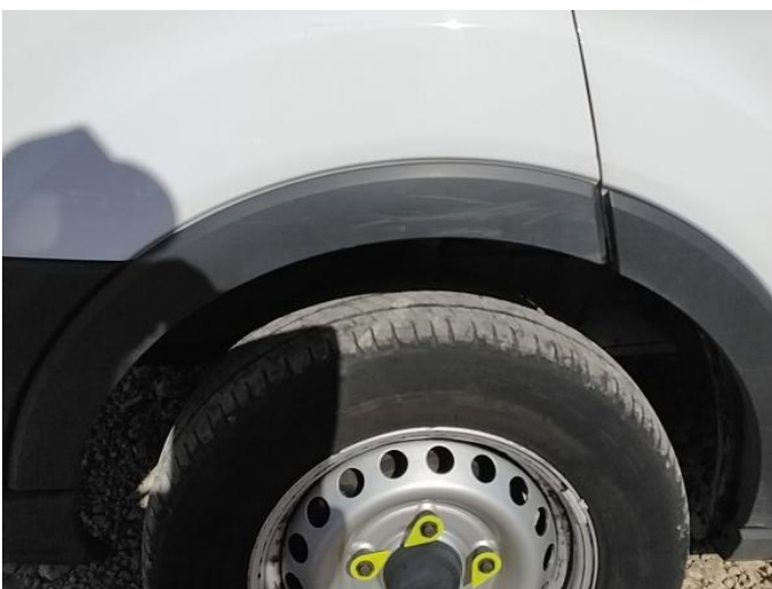
7: Moulding nsf Wing Scuffed (Unpainted) Over 100mm