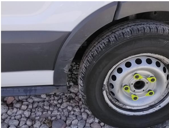
27: Moulding of Wing Scuffed (Unpainted) Over 100mm