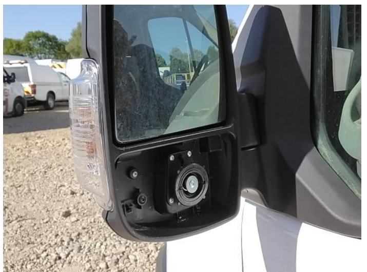
8: Door Mirror Glass ns Missing Replace