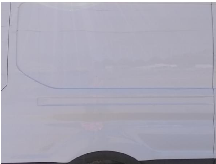
19: Qtr Panel osr Dented Over 30% Of Panel