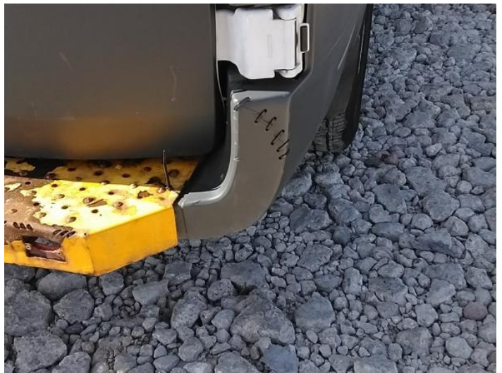
18: Bumper Rear Cracked Over 25mm