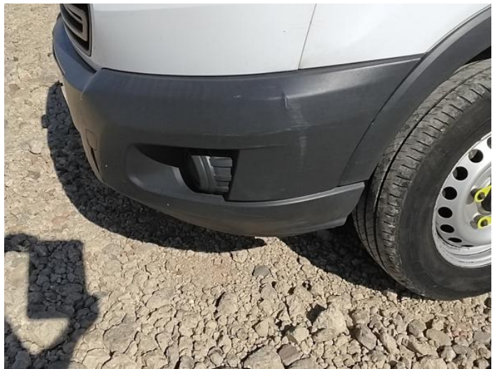
6: Bumper Front Scratched Over 25mm Not Thru Paint