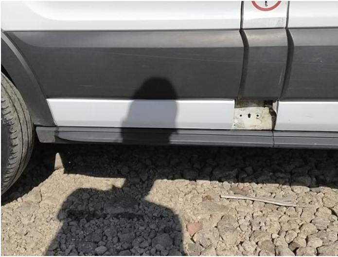
9: Door Moulding nsf Scuffed (Unpainted) Over 100mm