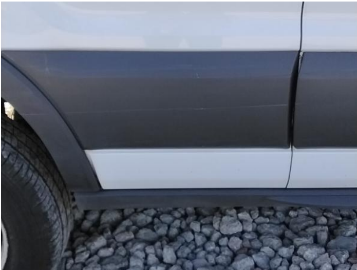
23: Qtr Panel Trim os Scuffed Over 25mm