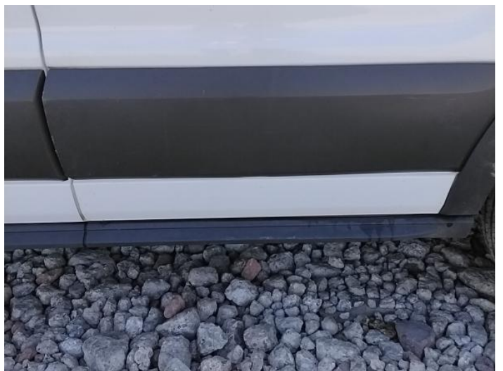
26: Door Moulding osf Scuffed (Unpainted) Over 100mm