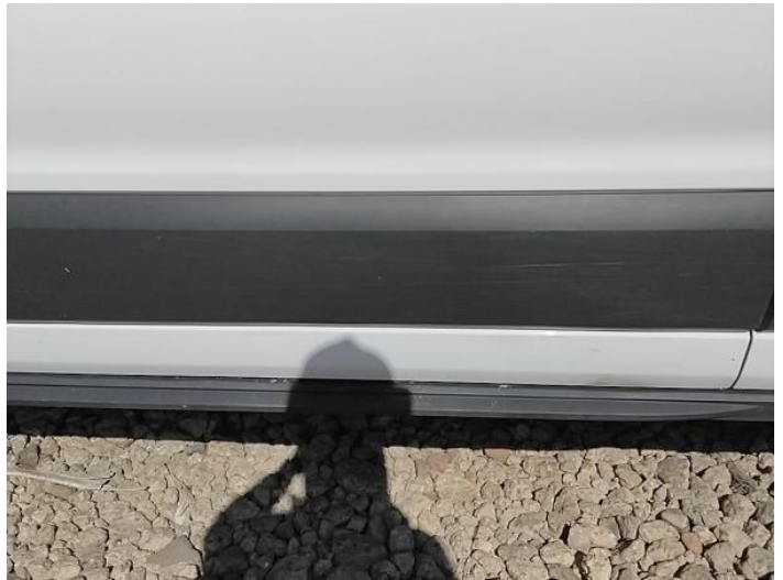
12: Qtr Panel Moulding ns Scuffed (Unpainted) Over 100mm