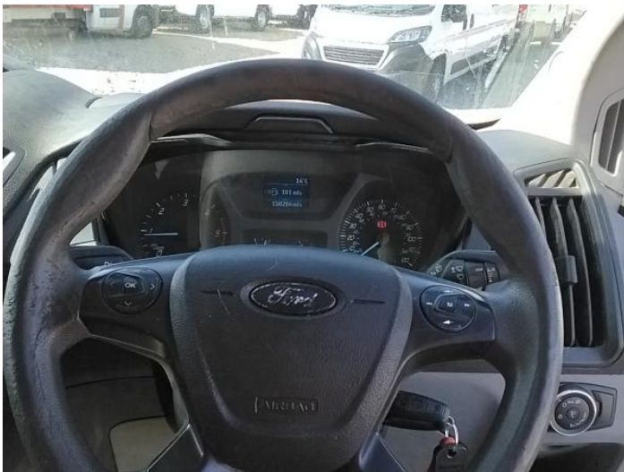
28: Other N/A N/A