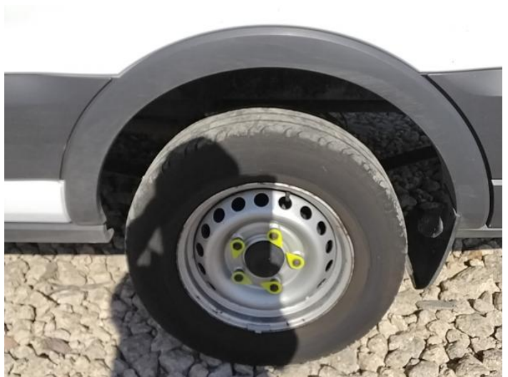
14: Qtr Panel Arch Extension ns Scuffed (Unpainted) Over 100mm