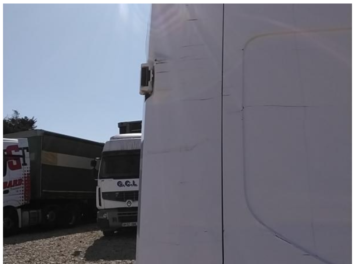
20: Qtr Panel osr Scratched Over 25mm Thru Paint