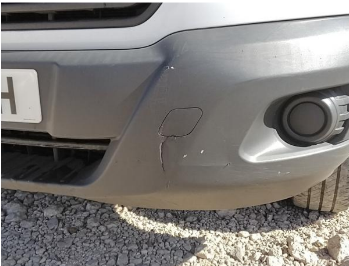
5: Bumper Front Cracked Over 25mm