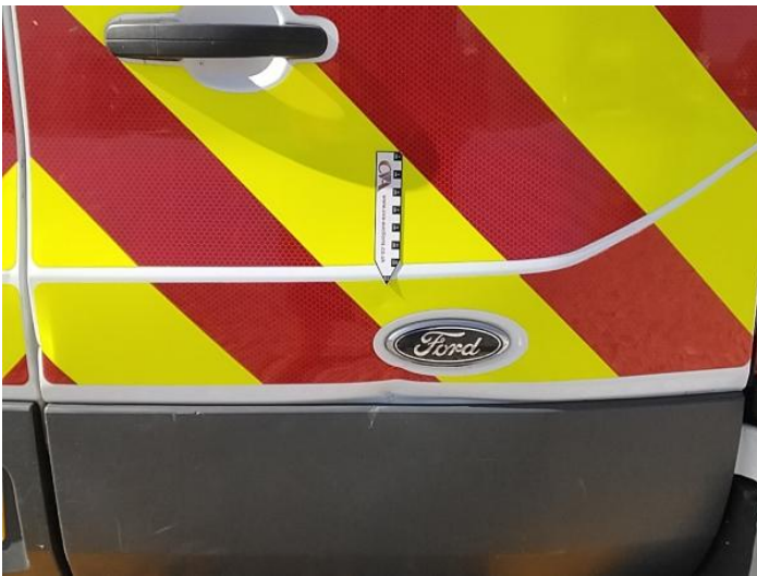
17: Door osr Dented With Paint Damage