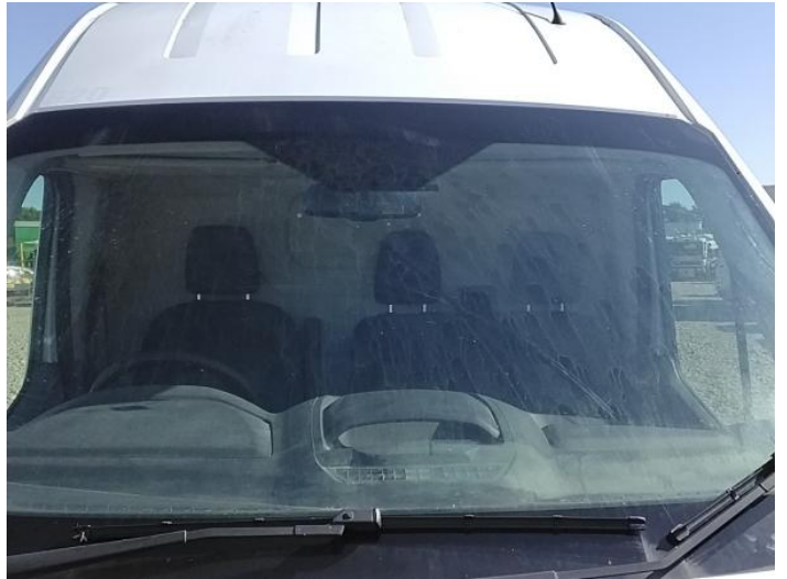
4: Screen Front Chipped UpTo 10mm