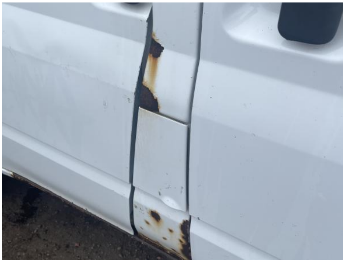
11: Door nsf Rusted Over 5mm