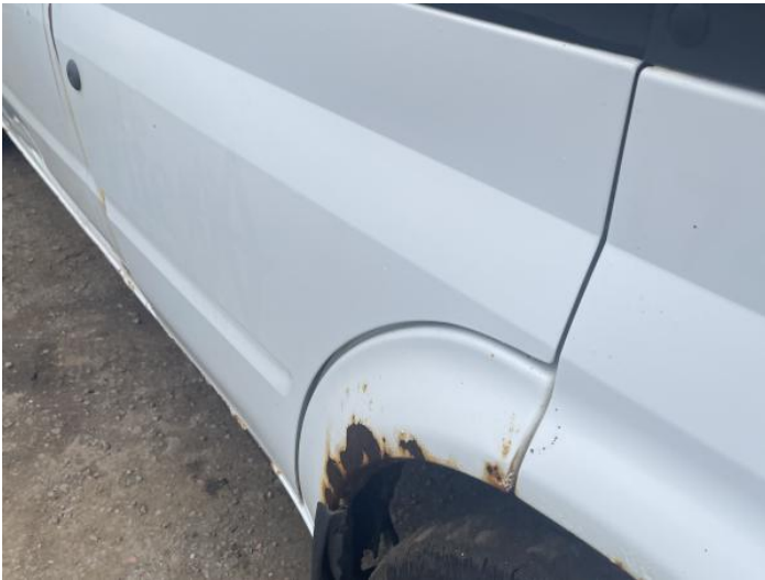
5: Door osf Rusted Over 5mm