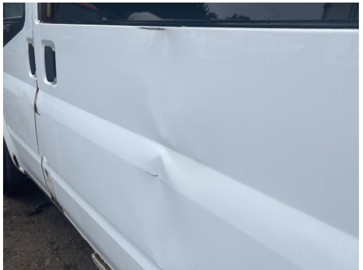
10: Door nsr Dented Over 30mm