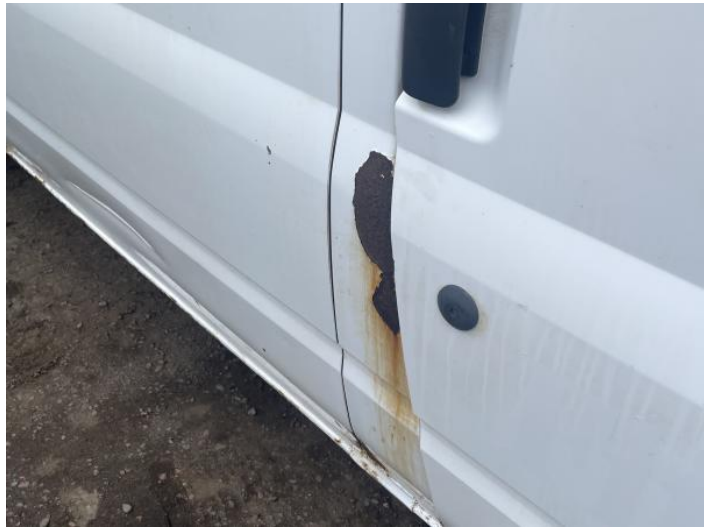
6: B Post os Rusted Over 5mm