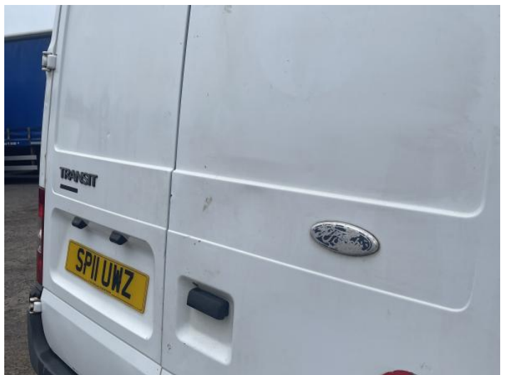
8: Tailgate Dented With Paint Damage