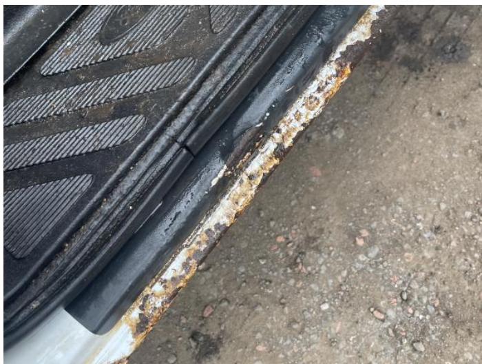
1: Sill os Rusted Over 5mm