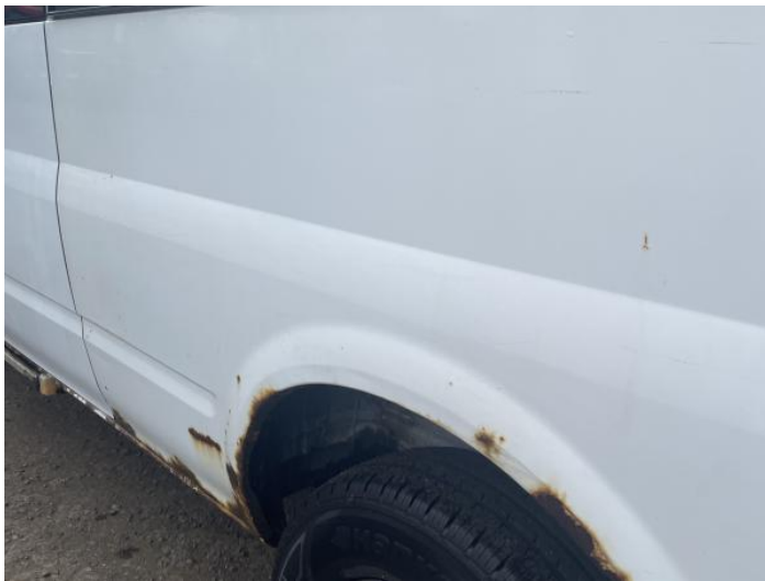
9: Qtr Panel nsr Rusted Over 5mm