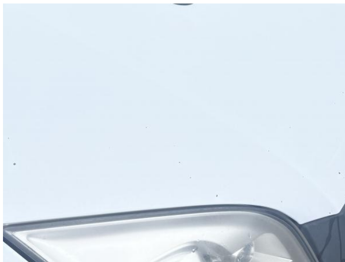
2: Bonnet Rusted Over 5mm