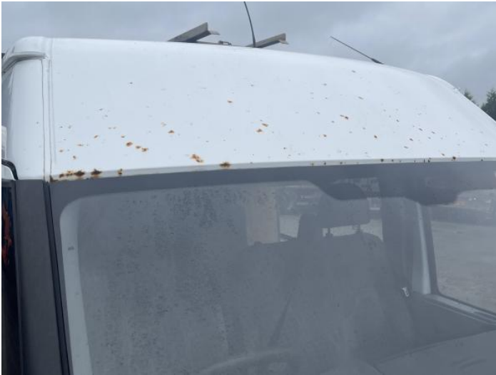
3: Roof Rusted Over 5mm