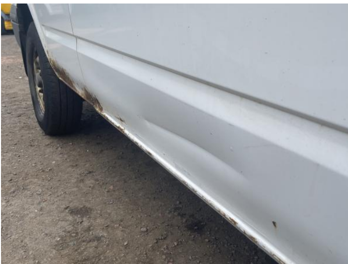
7: Qtr Panel osr Dented With Paint Damage