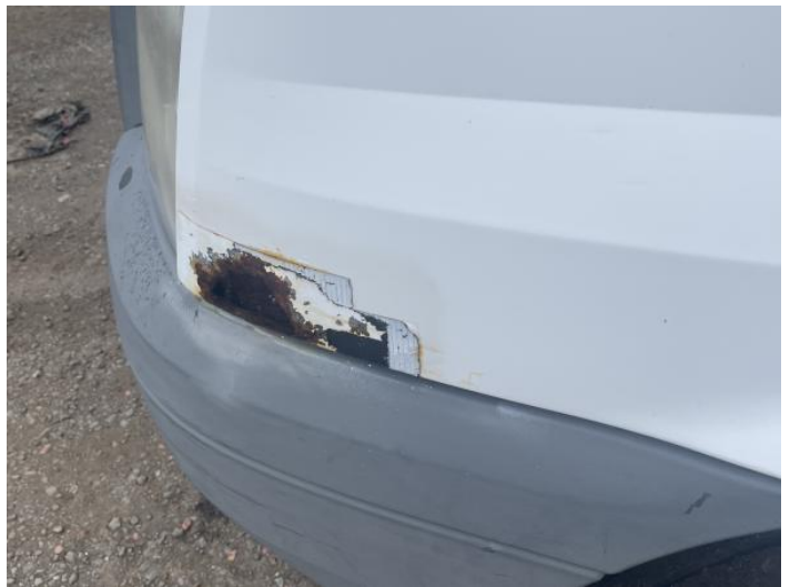
12: Wing osf Hole Over 10mm