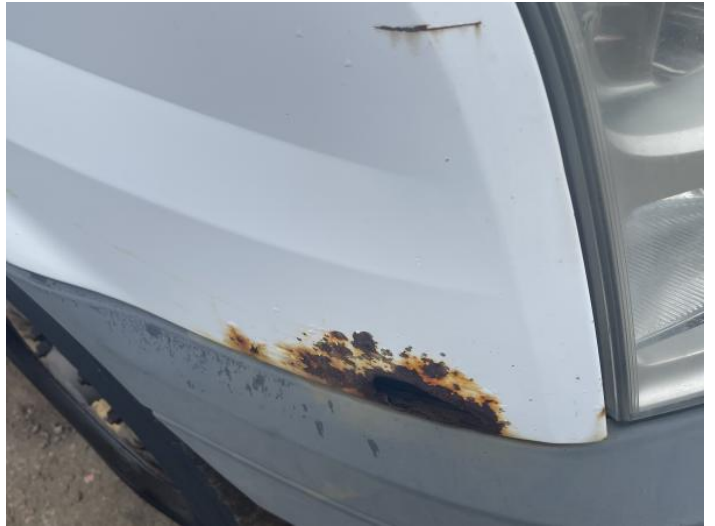
4: Wing osf Hole Over 10mm