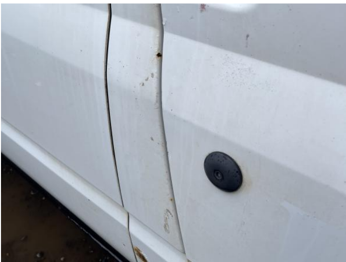
7: B Post os Rusted Over 5mm