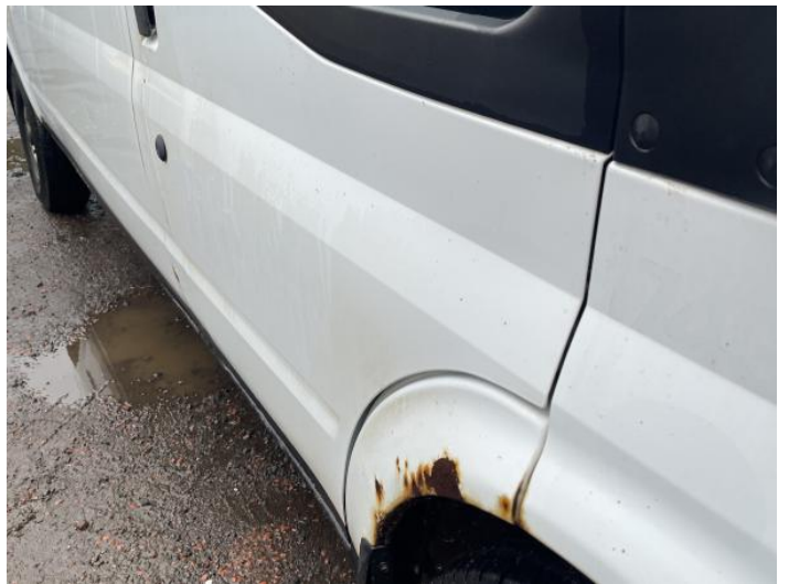
6: Door osf Rusted Over 5mm