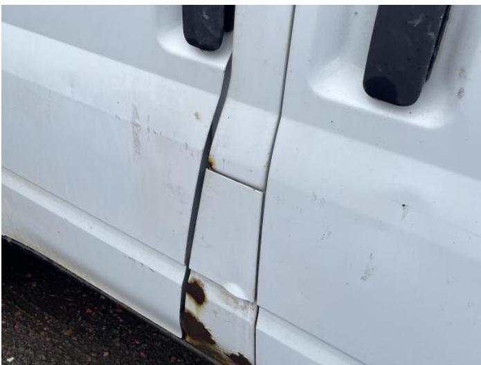
13: B Post ns Rusted Over 5mm