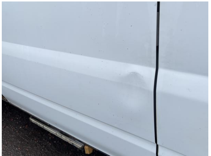
12: Door nsr Dented Over 30mm