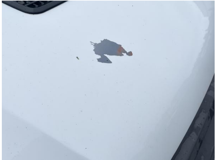
4: Bonnet Rusted Over 5mm