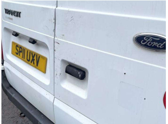
10: Tailgate Dented With Paint Damage