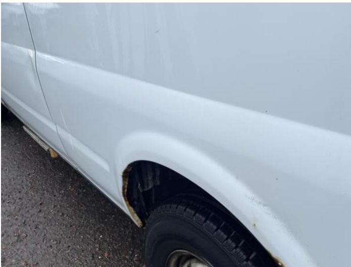
11: Qtr Panel osr Rusted Over 5mm