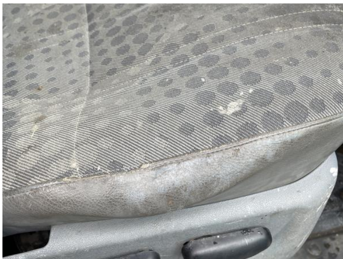
1: Seat Base Cover osf Torn Over 3mm