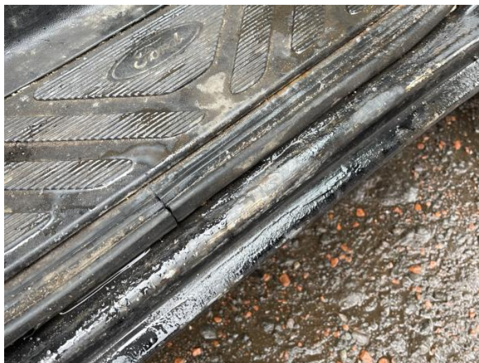
2: Sill os Rusted Over 5mm