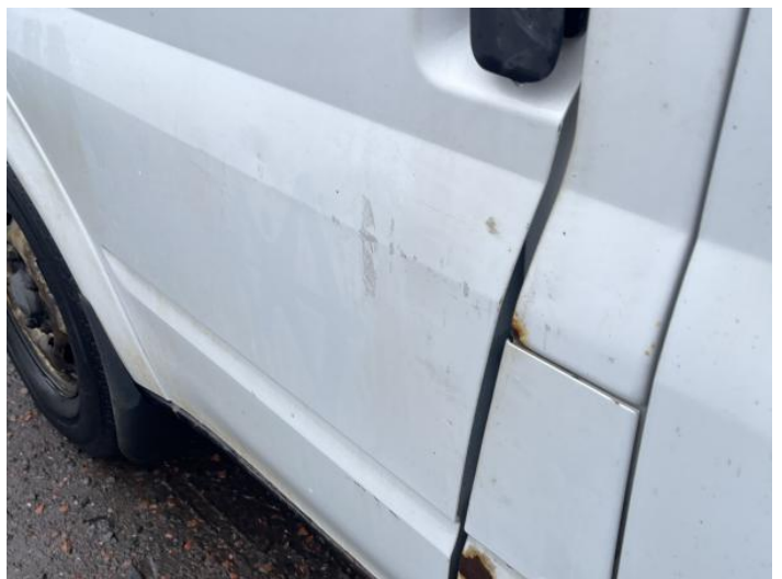
14: Door nsf Dented Over 30mm