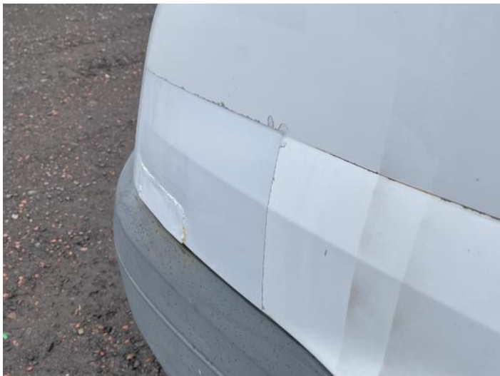
15: Wing nsf Poor Previous Repair Poor Paint