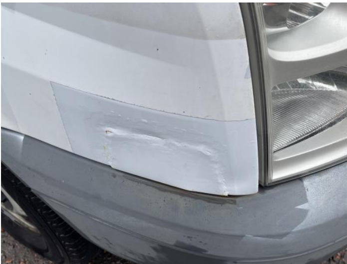
5: Wing osf Poor Previous Repair Poor Paint