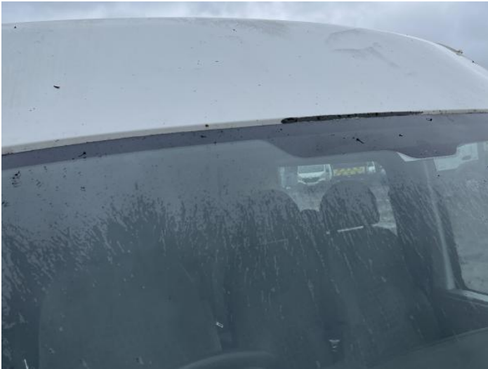
3: Roof Rusted Over 5mm