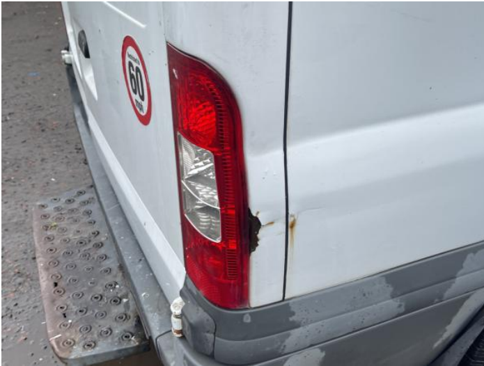
9: D Post os Dented With Paint Damage