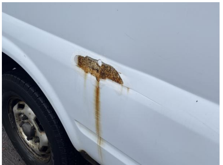
8: Qtr Panel osr Rusted Over 5mm