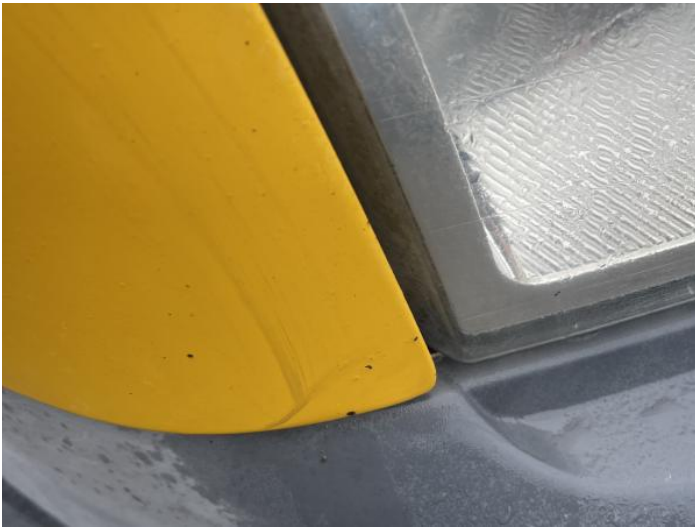
5: Wing osf Rusted Over 5mm