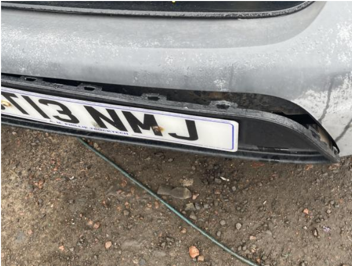
3: Bumper Front Grill Broken Replace