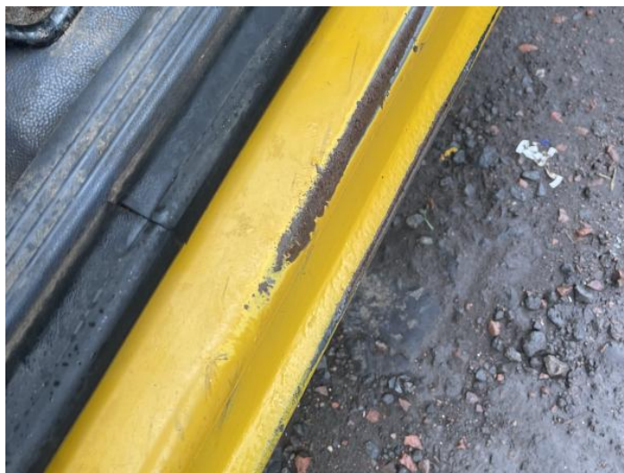
2: Sill os Rusted Over 5mm