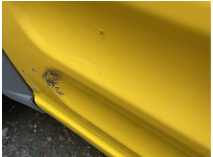
6: Qtr Panel osr Rusted Over 5mm