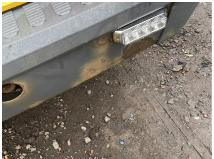
8: Bumper Rear Rusted Over 5mm