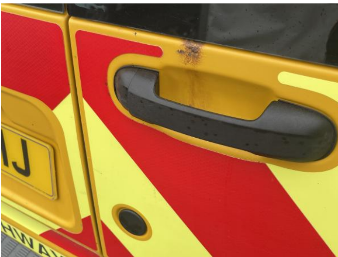
7: Tailgate Rusted Over 5mm