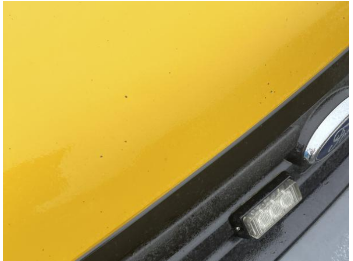
4: Bonnet Chipped 1 To 5