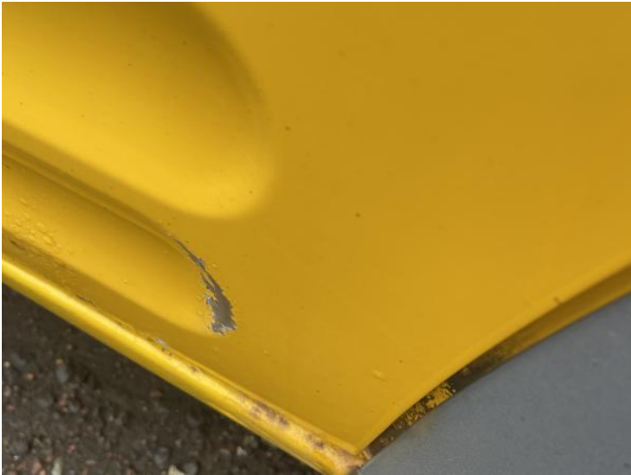
9: Door nsr Rusted Over 5mm