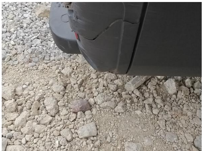
8: Sill os Cracked Replace