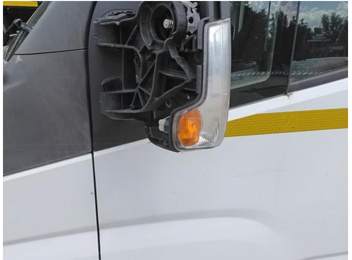
4: Door Mirror Assy nsf Missing Replace