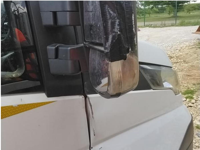
10: Door Mirror Assy osf Broken Replace