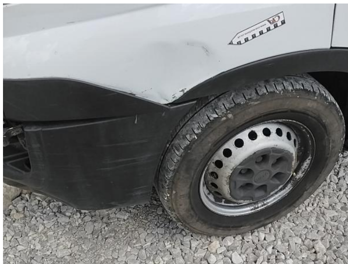
2: Wing nsf Dented Over 30mm