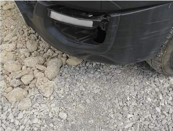
3: Bumper Front Grill Missing Replace