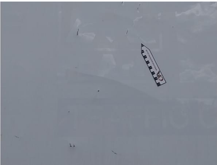
5: Qtr Panel nsr Dented With Paint Damage