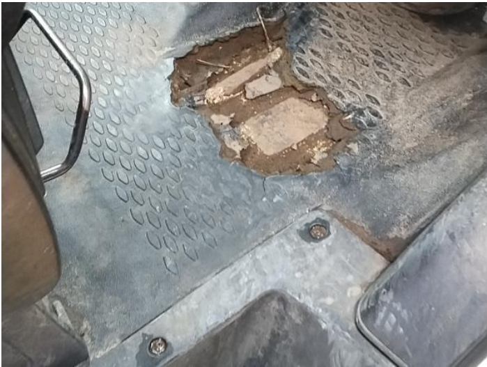
11: Carpets Front Torn Over 10mm