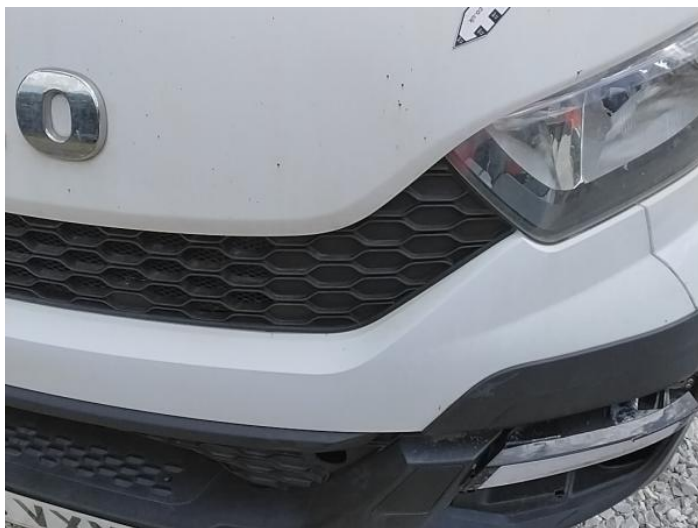
1: Bonnet Chipped Multiple Chips