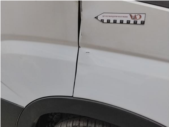
9: Wing osf Dented Over 30mm