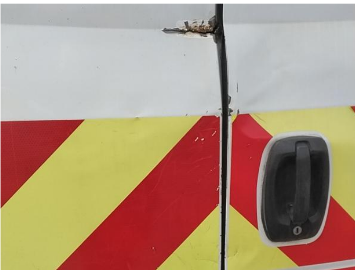
7: Panel Rear Cracked Replace