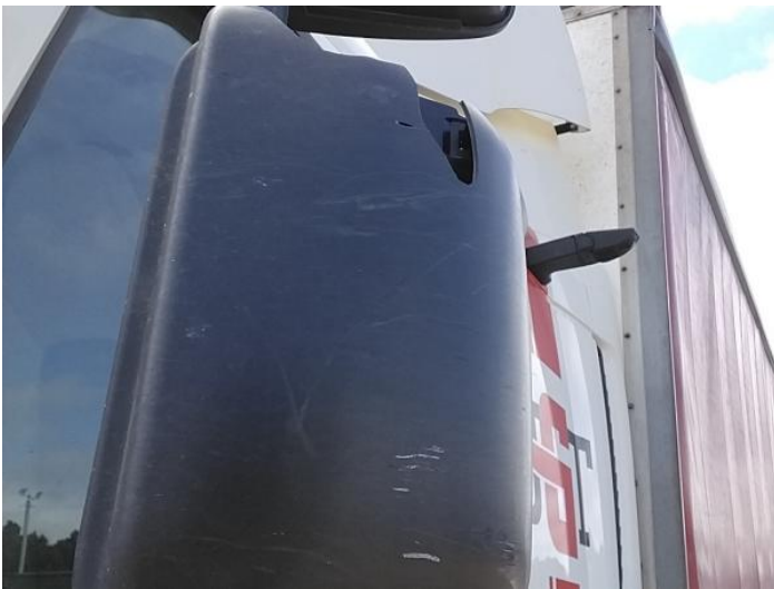
5: Door Mirror Assy nsf Broken Replace