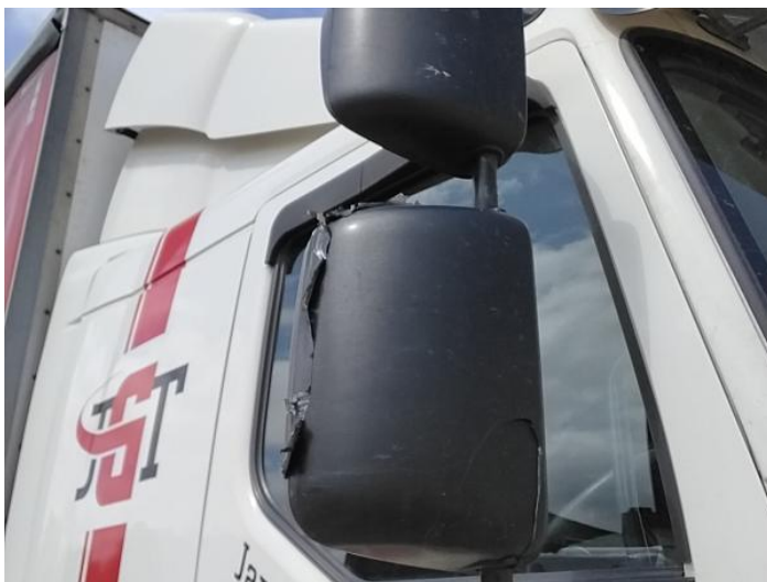
13: Door Mirror Assy osf Broken Replace