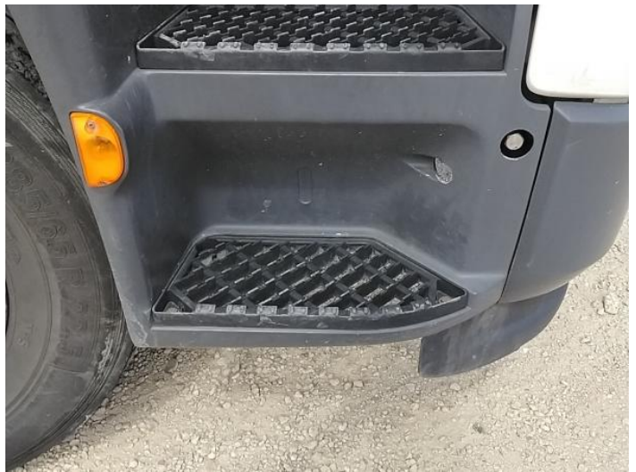
12: Other N/A N/A