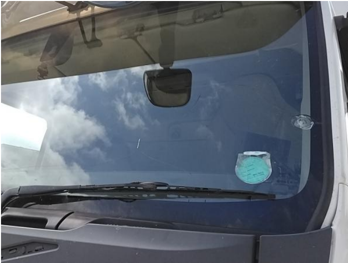
3: Screen Front Cracked Replace