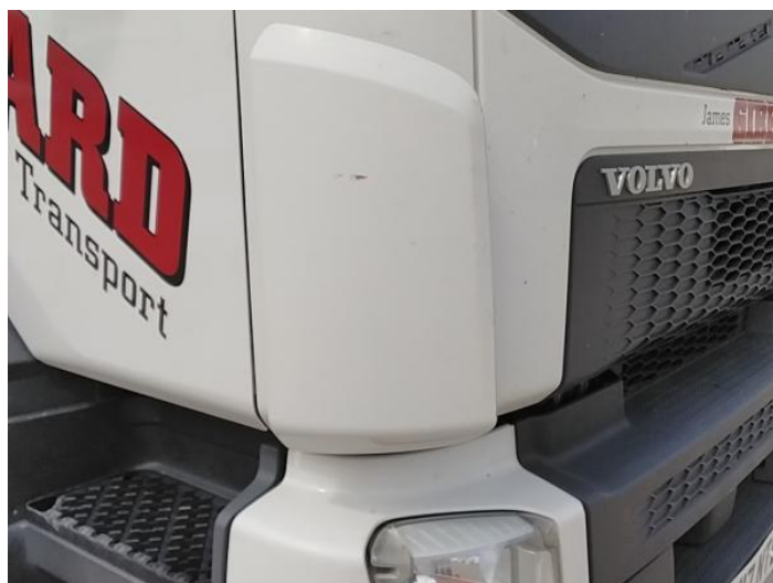
1: Wing osf Scratched Over 25mm Not Thru Paint