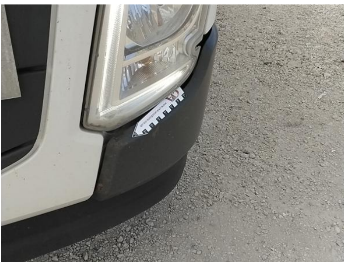
7: Bumper Front Rusted Over 5mm