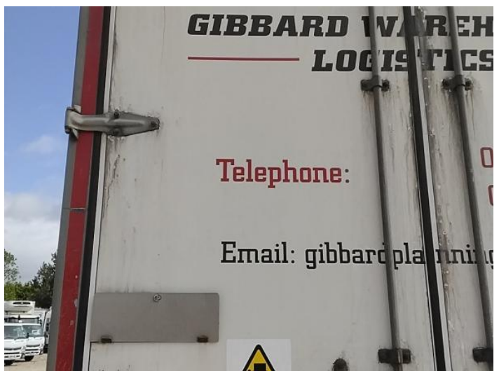
8: Door nsr Hole UpTo 10mm