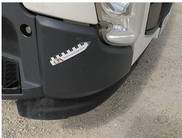
2: Bumper Front Rusted Over 5mm