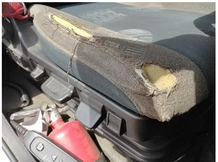
14: Seat Base Cover osf Torn Over 3mm