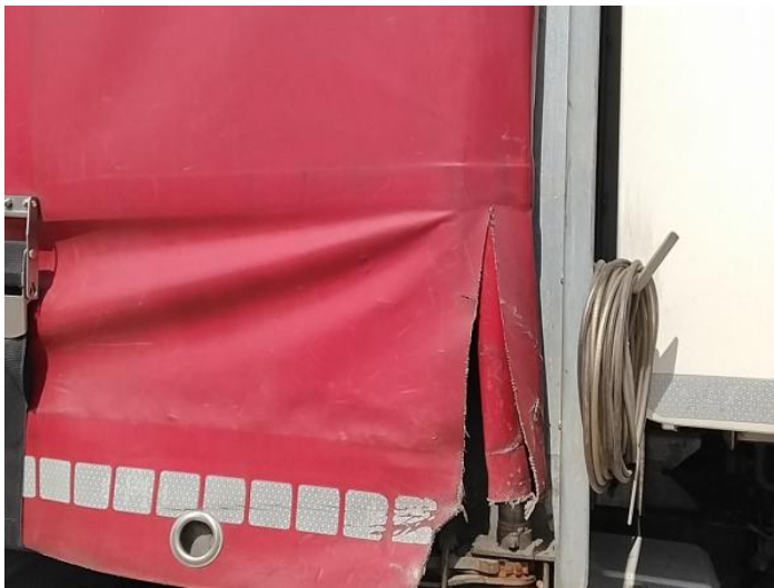
11: Other N/A N/A