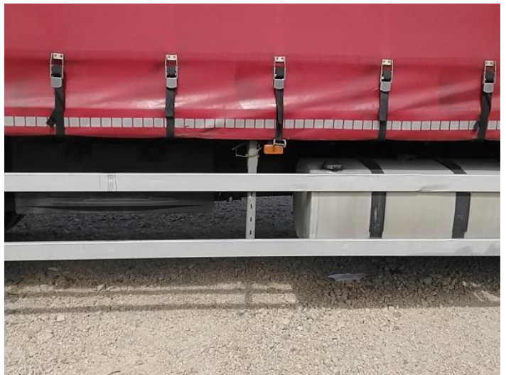
10: Other N/A N/A