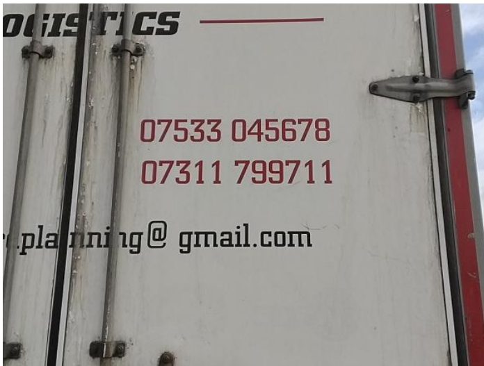
9: Door osr Hole UpTo 10mm