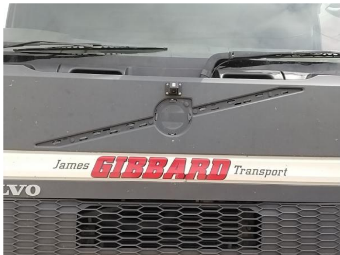
15: Badgedecal Front Missing Replace