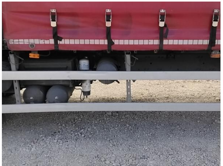
6: Other N/A N/A