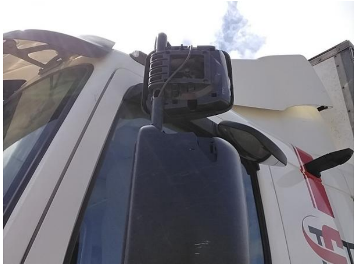
4: Door Mirror Assy nsf Missing Replace