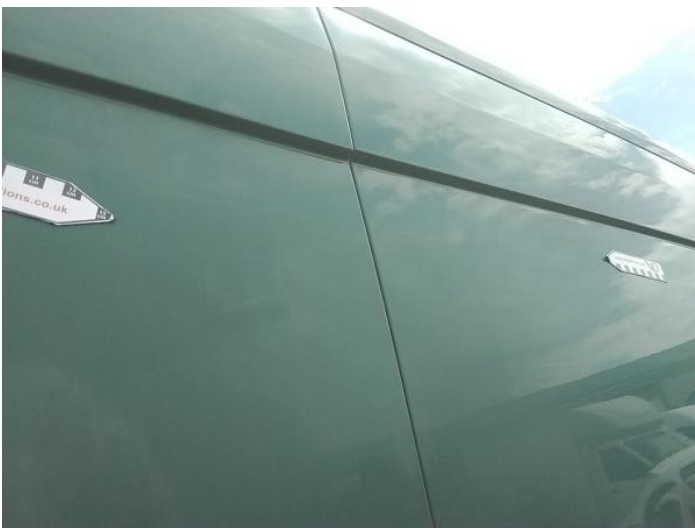
19: Qtr Panel osr Dented Over 30mm