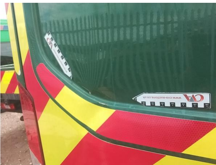
13: Door nsr Dented With Paint Damage