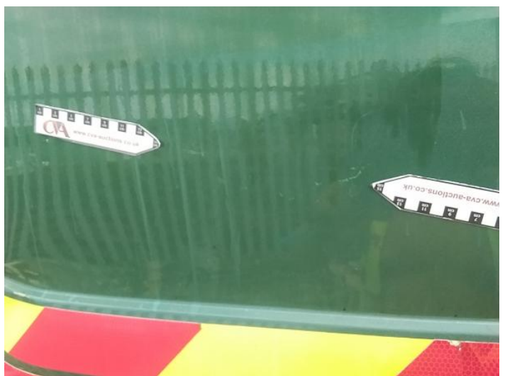
14: Door nsr Scratched Over 25mm Thru Paint