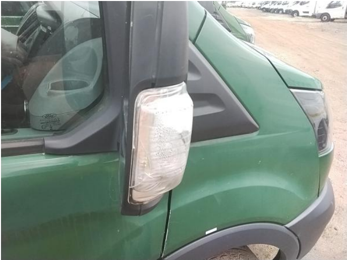
21: Door Mirror Assy osf Broken Replace