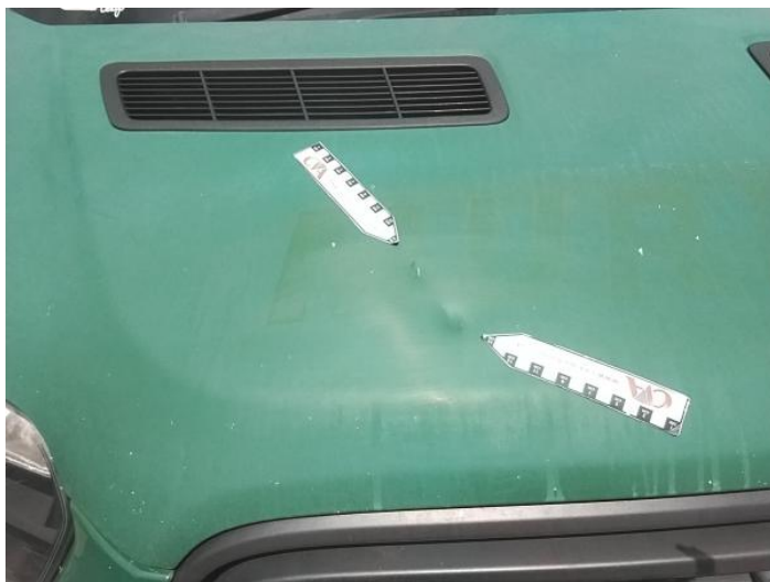
1: Bonnet Dented With Paint Damage