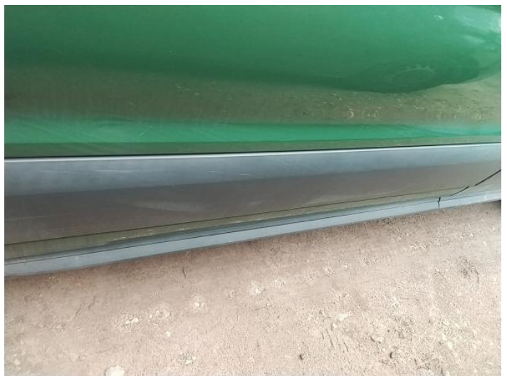
20: Qtr Panel Moulding os Scuffed (Unpainted) Over 100mm