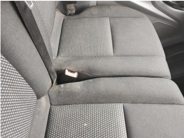
23: Seat Base Cover nsf Soiled Heavy