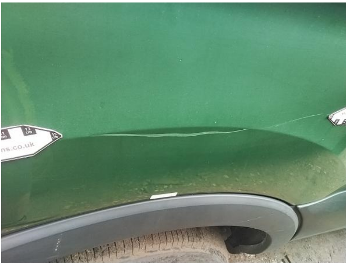
17: Qtr Panel osr Dented With Paint Damage