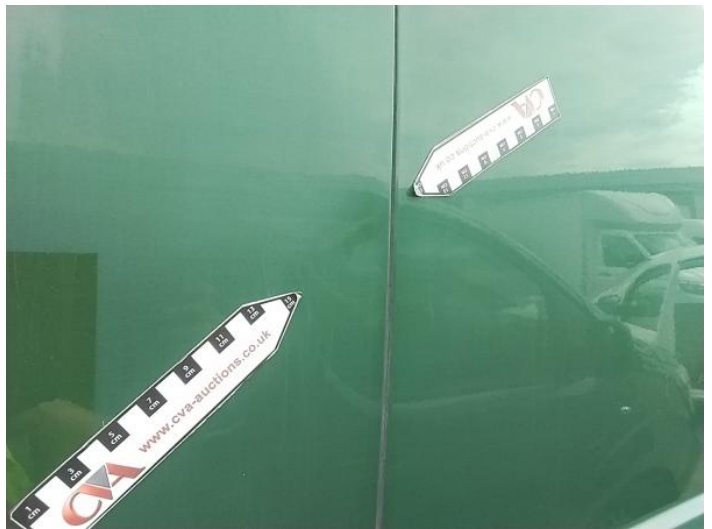
18: Qtr Panel osr Dented Over 30mm