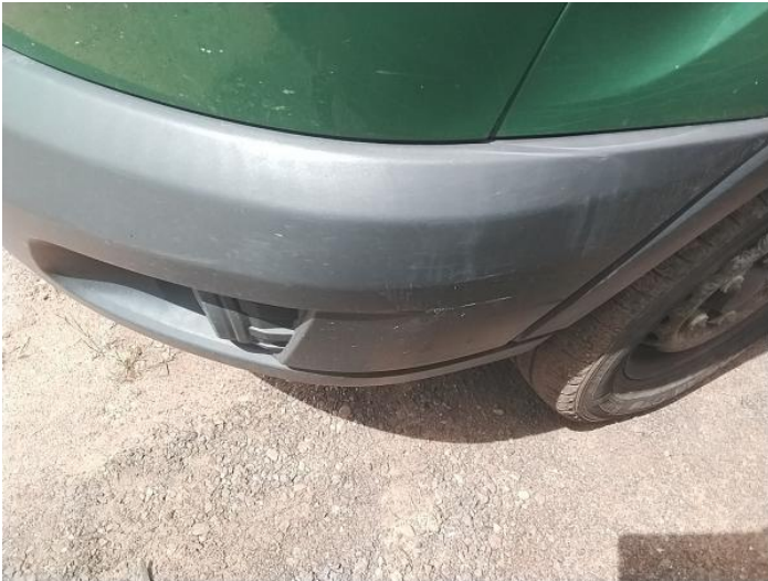
3: Bumper Front Scratched Over 100mm Thru Paint