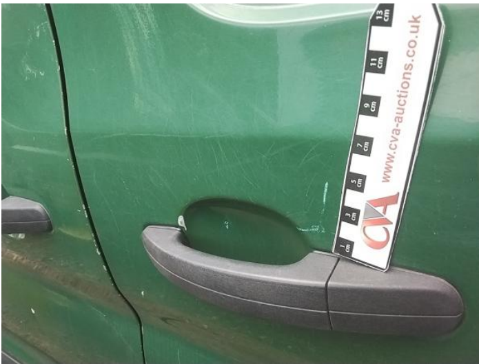
5: Qtr Panel nsr Scratched Over 25mm Thru Paint