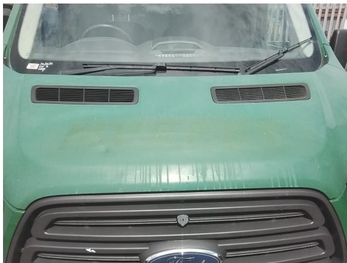
2: Bonnet Chipped Multiple Chips