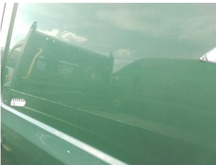
7: Qtr Panel nsr Scratched Over 25mm Thru Paint