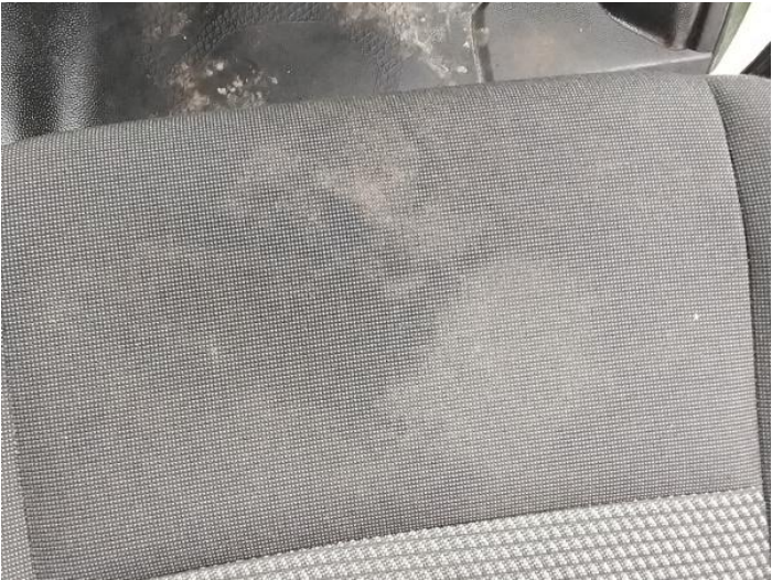
22: Seat Base Cover osf Soiled Heavy