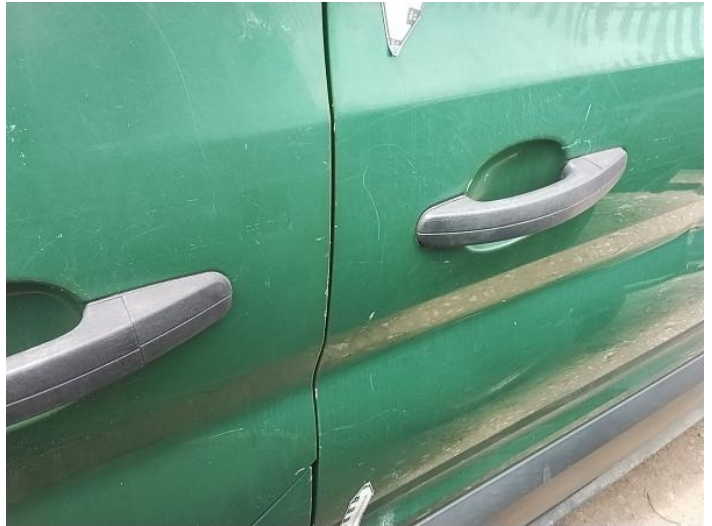
4: Qtr Panel nsr Scratched Over 25mm Thru Paint