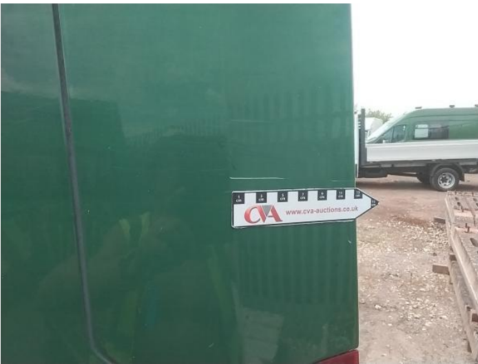
11: C Post ns Scratched Over 25mm Thru Paint