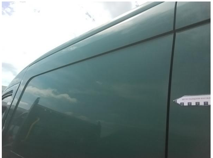
6: Qtr Panel nsr Scratched Over 25mm Not Thru Paint