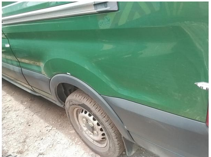
12: Qtr Panel nsr Scratched Over 25mm Thru Paint