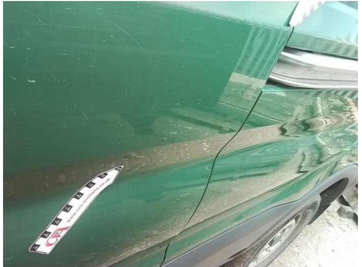
10: Qtr Panel nsr Dented Over 30mm