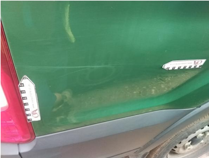
15: Qtr Panel osr Scratched Over 25mm Thru Paint