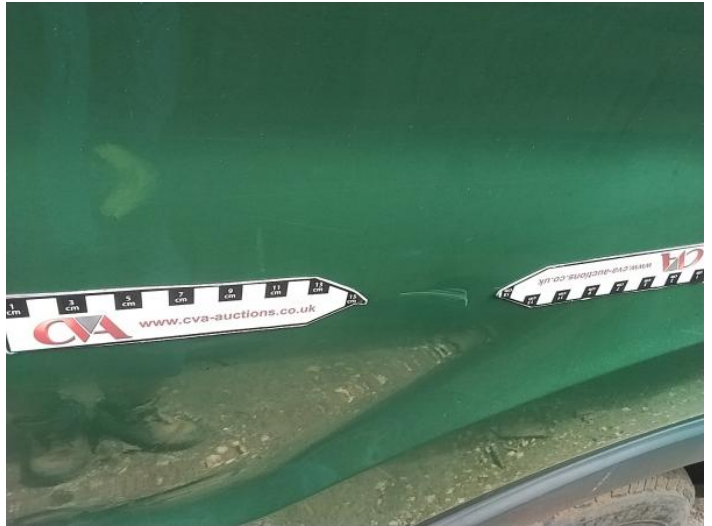
16: Qtr Panel osr Dented With Paint Damage