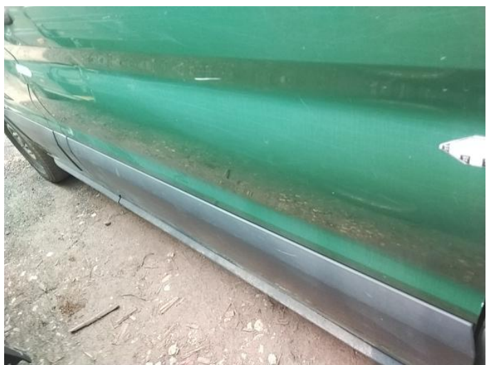
8: Qtr Panel nsr Scratched Over 25mm Thru Paint