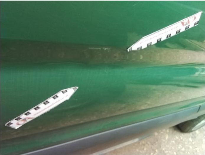
9: Qtr Panel nsr Dented Over 30mm