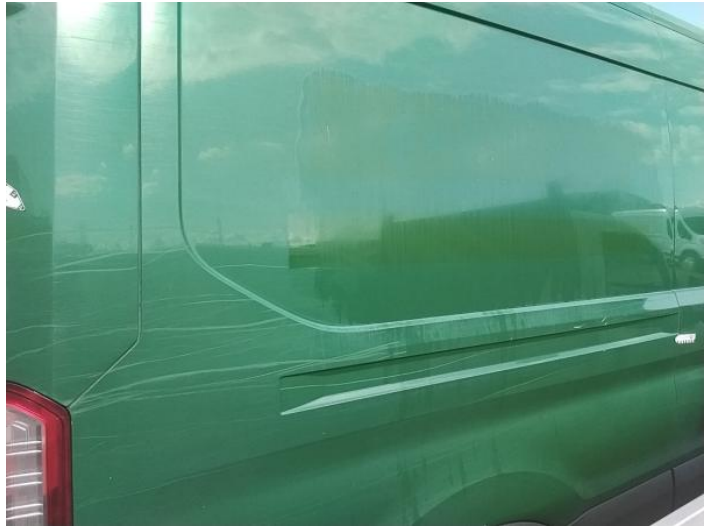
16: Qtr Panel osr Scratched Over 25mm Thru Paint