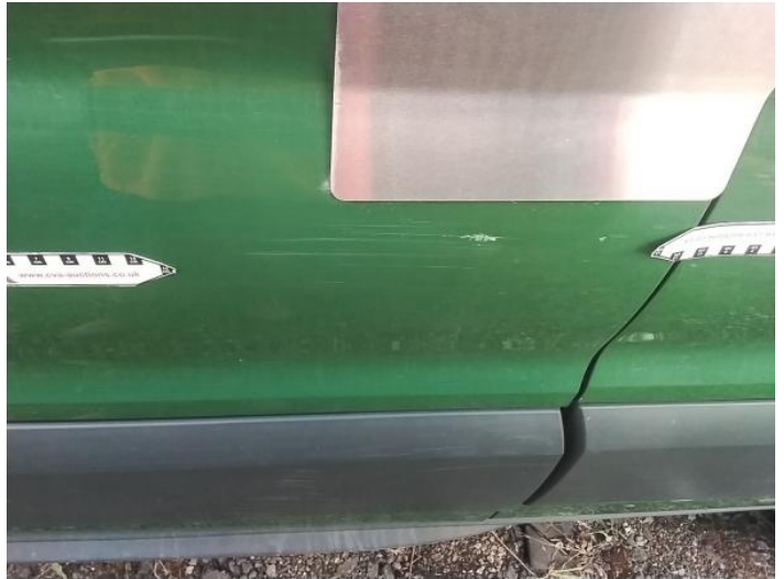
10: Qtr Panel nsr Scratched Over 25mm Thru Paint