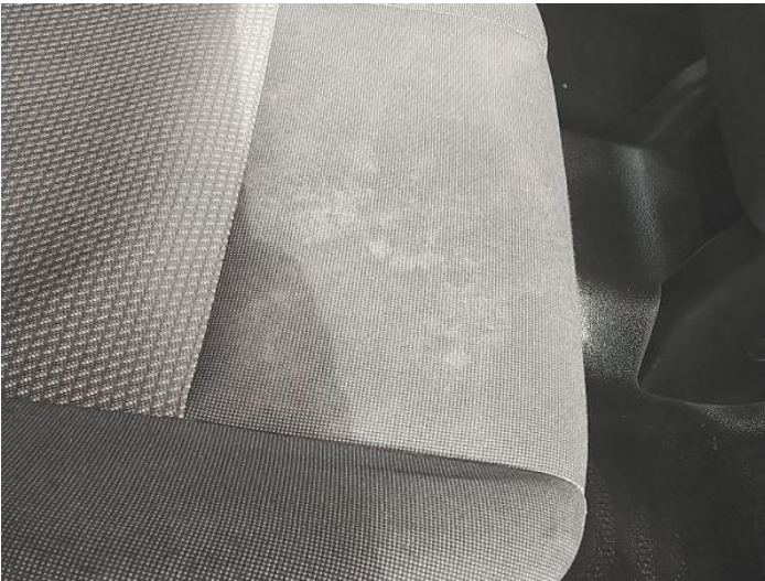
23: Seat Base Cover osf Soiled Heavy