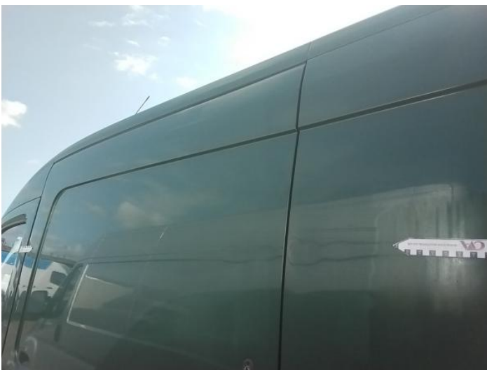
7: Qtr Panel nsr Scratched Over 25mm Thru Paint