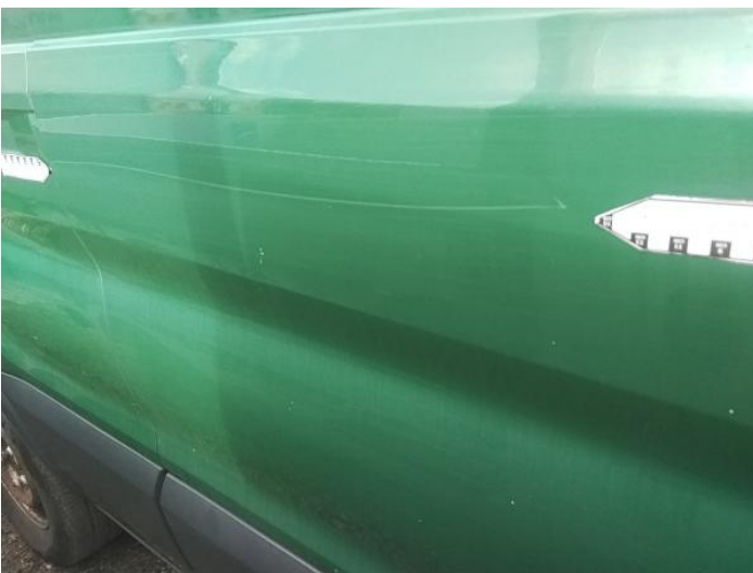
19: Qtr Panel osr Scratched Over 25mm Thru Paint