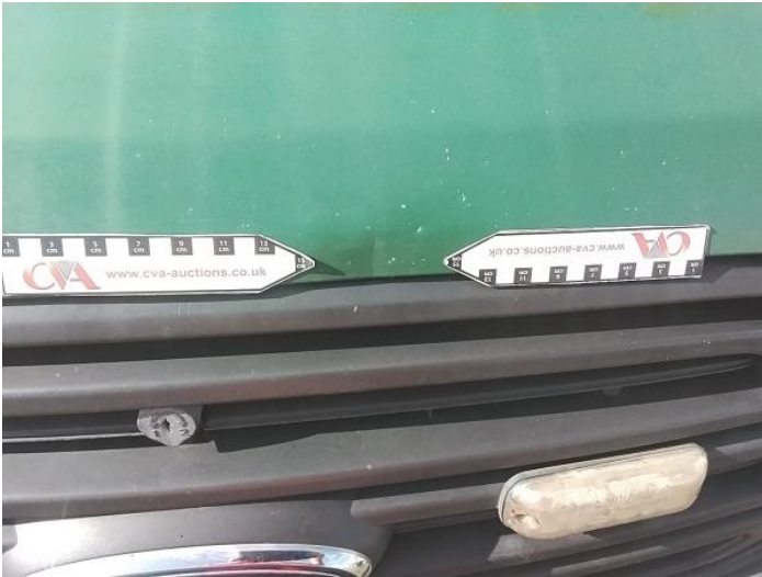
3: Bonnet Dented Over 30mm