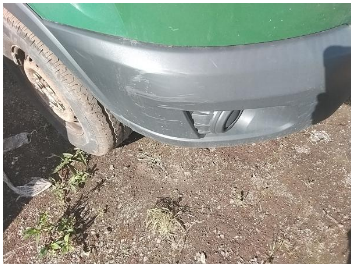
1: Bumper Front Scratched Over 100mm Thru Paint