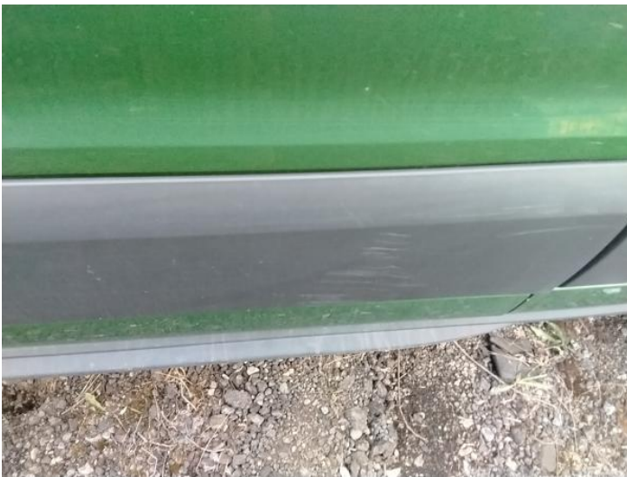
11: Qtr Panel Moulding ns Scuffed (Unpainted) Over 100mm