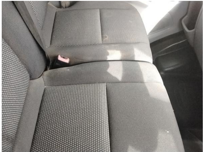
24: Seat Base Cover nsf Soiled Heavy