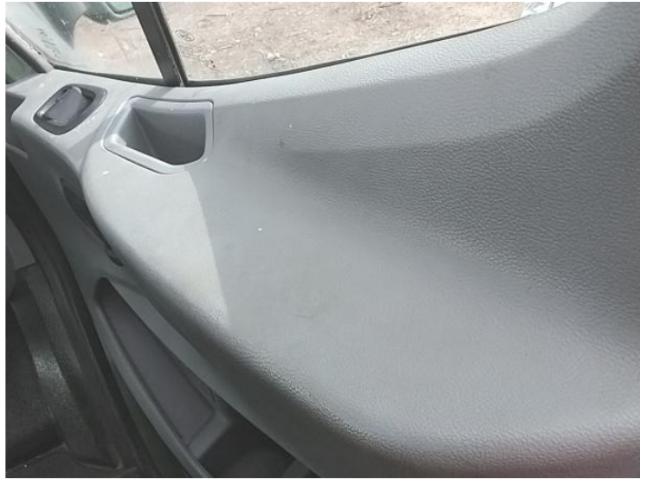
22: Door Pad osf Soiled Heavy