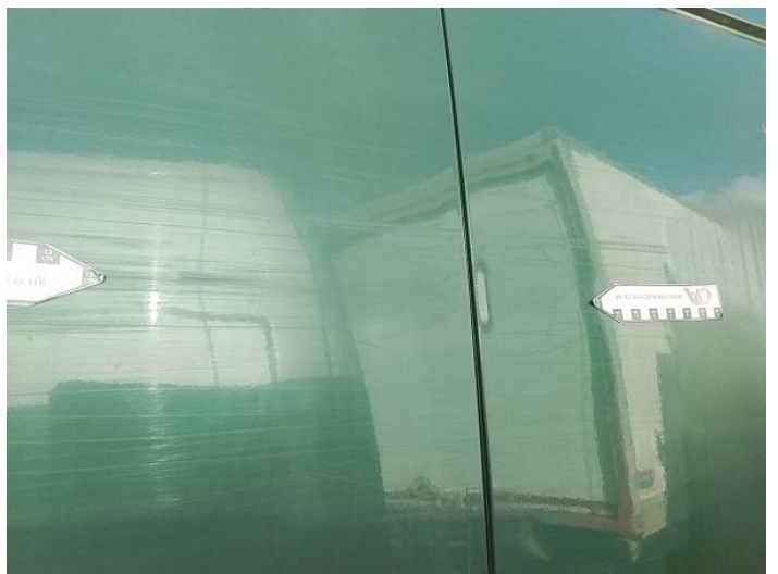
8: Qtr Panel nsr Dented Over 30mm