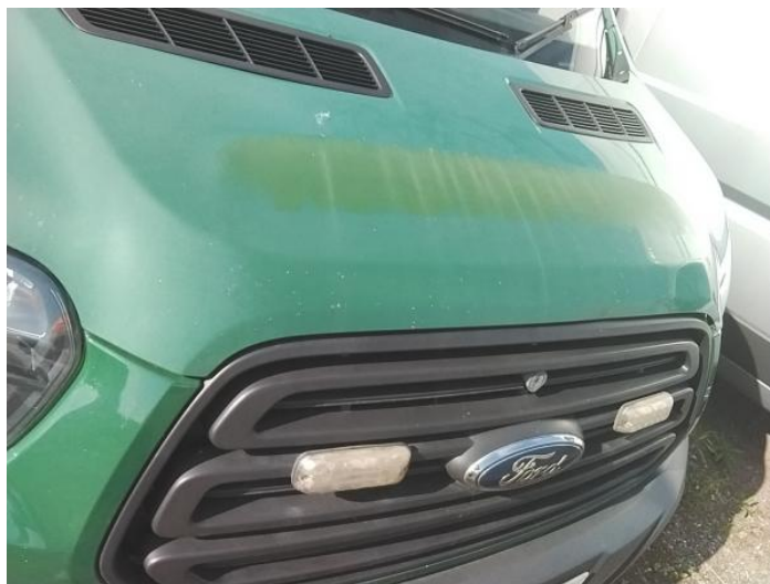
2: Bonnet Chipped Multiple Chips