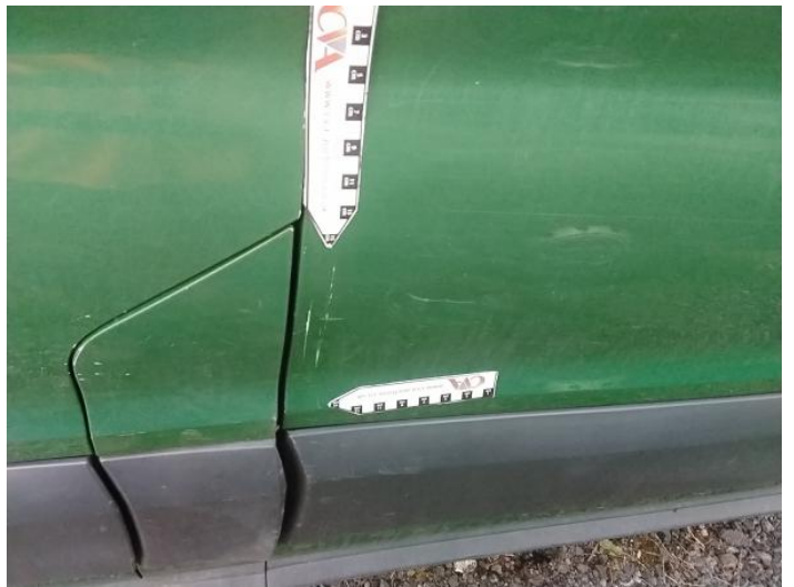
6: Qtr Panel nsr Dented With Paint Damage