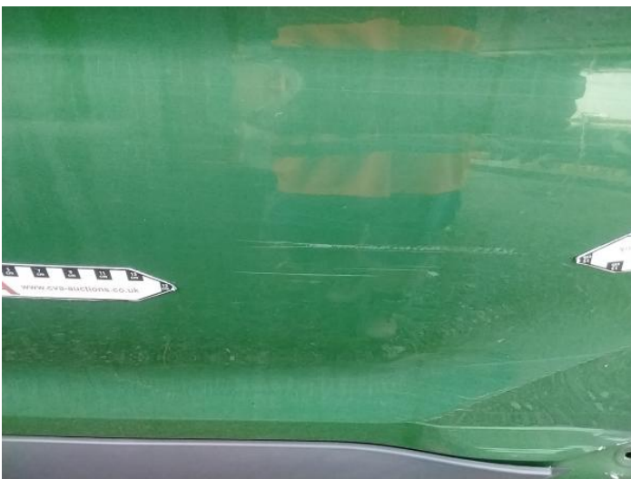
13: Qtr Panel nsr Scratched Over 25mm Thru Paint