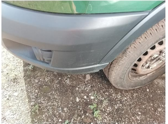
4: Bumper Front Scratched Over 100mm Thru Paint