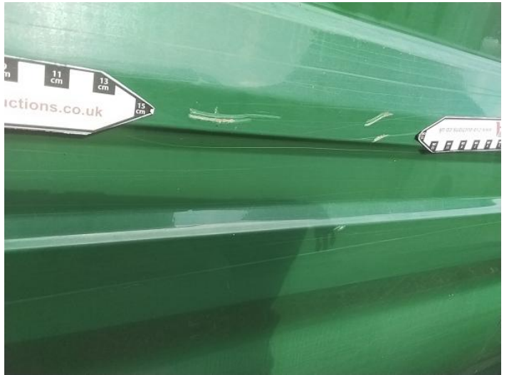
18: Qtr Panel osr Dented With Paint Damage