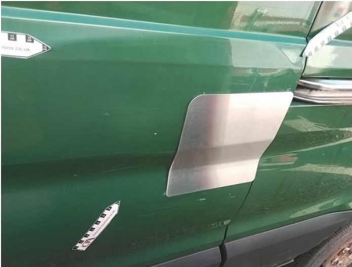
9: Qtr Panel nsr Dented Over 30mm