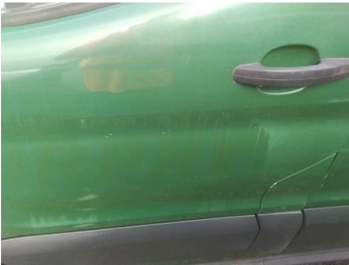
5: Door nsf Chipped Multiple Chips