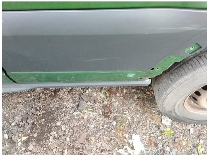
12: Qtr Panel Moulding ns Scuffed (Unpainted) Over 100mm