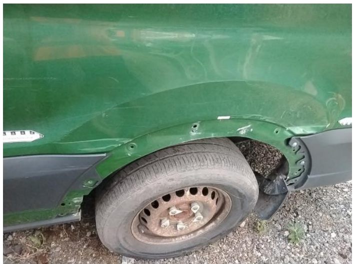
14: Qtr Panel nsr Dented With Paint Damage