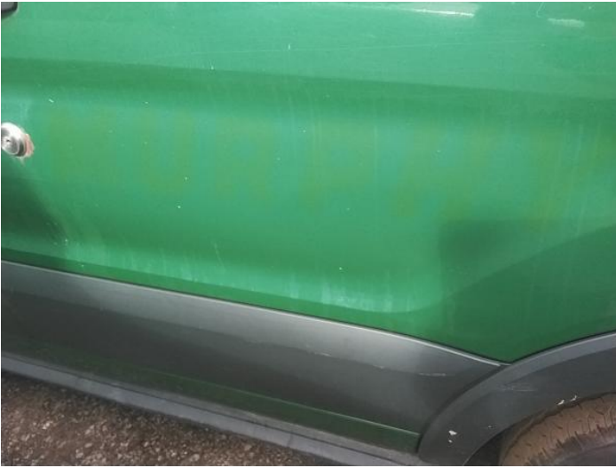
21: Door osf Chipped Multiple Chips