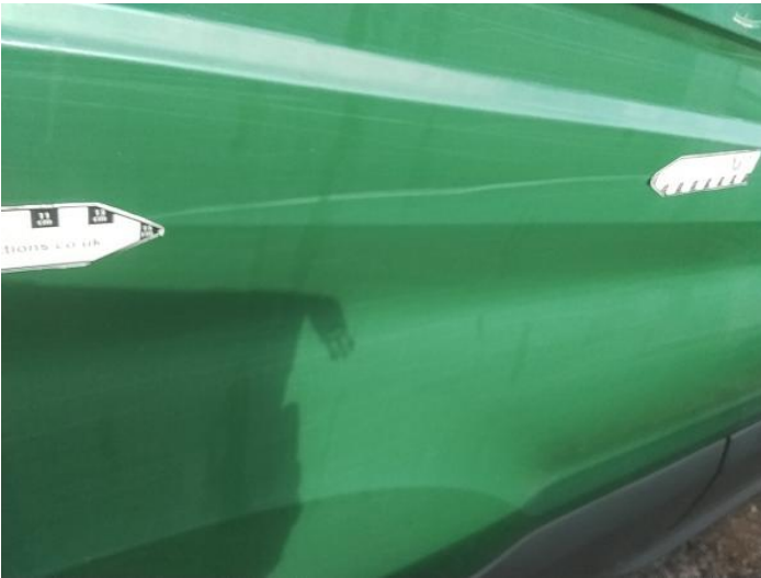
17: Qtr Panel osr Dented Over 30mm