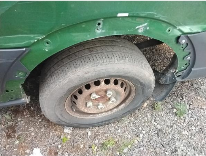
15: Qtr Panel Moulding ns Missing Replace