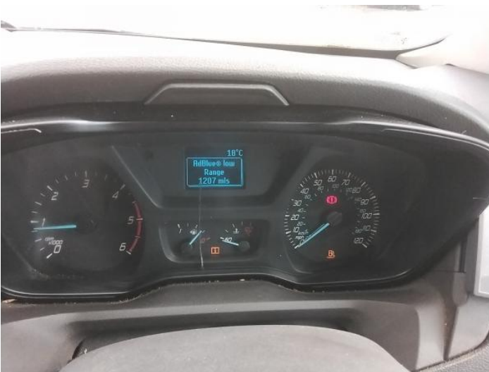
25: Dash Warning Lights Displayed No Action