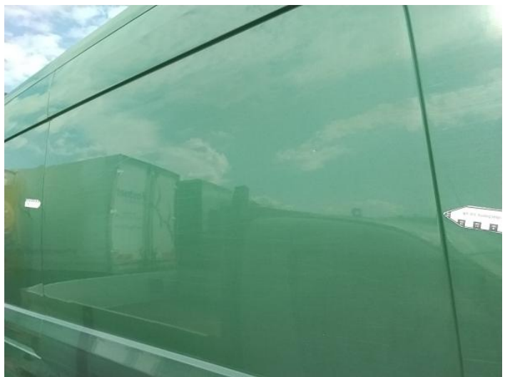
20: Qtr Panel osr Scratched Over 25mm Thru Paint