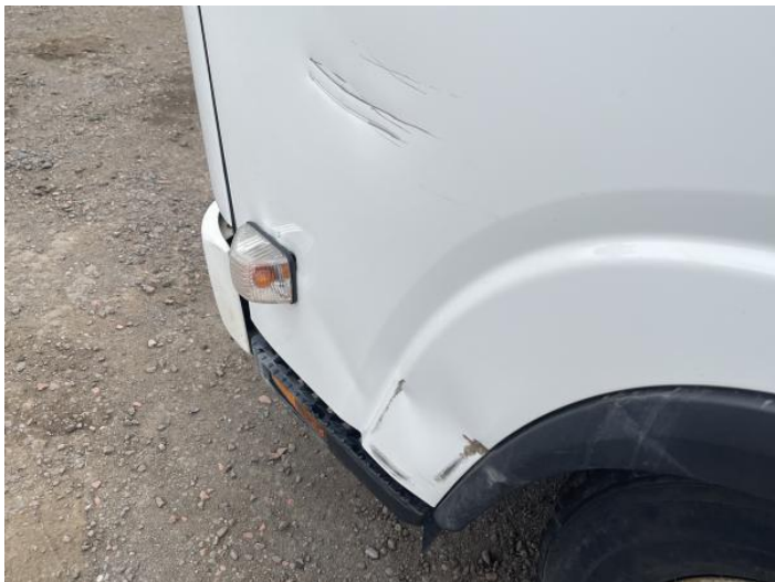
9: Door nsf Dented With Paint Damage