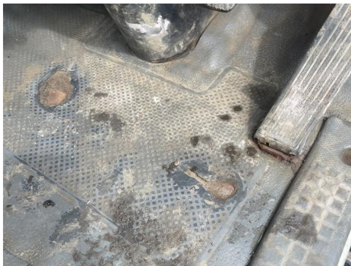
2: Carpets Front Torn Over 10mm