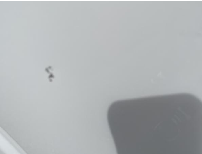
5: Door osf Dented With Paint Damage