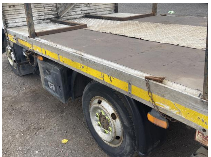
8: Qtr Panel nsr Dented With Paint Damage