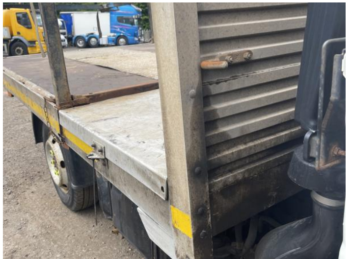
6: Qtr Panel osr Rusted Over 5mm