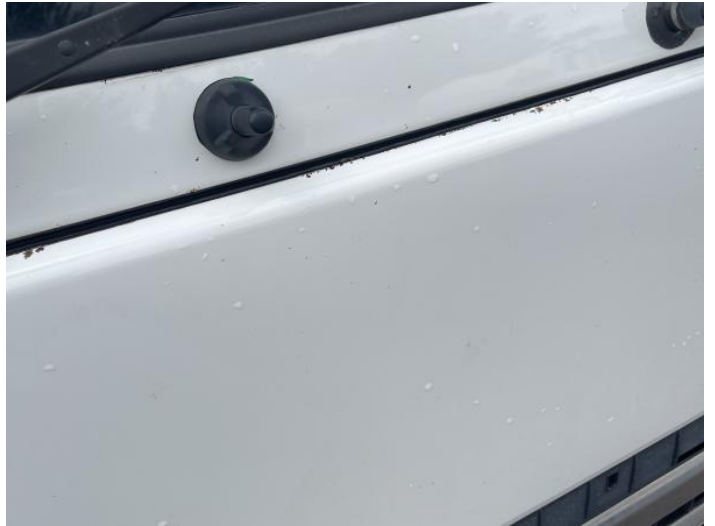
4: Bonnet Rusted Over 5mm