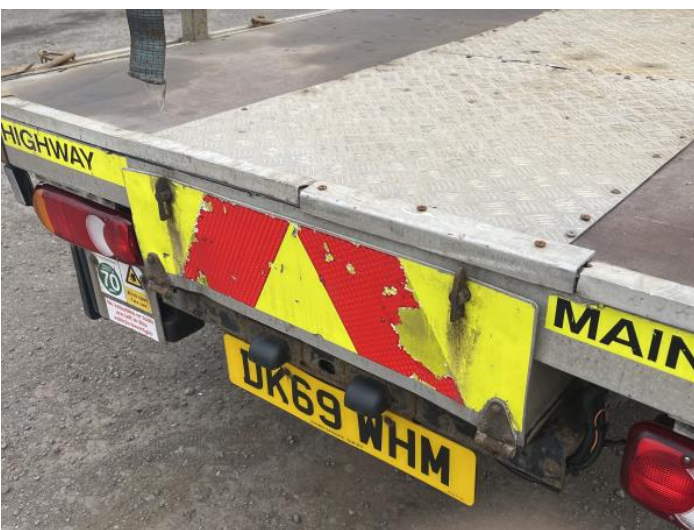
7: Tailgate Dented With Paint Damage