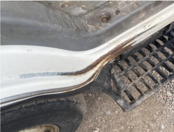
3: Sill os Rusted Over 5mm