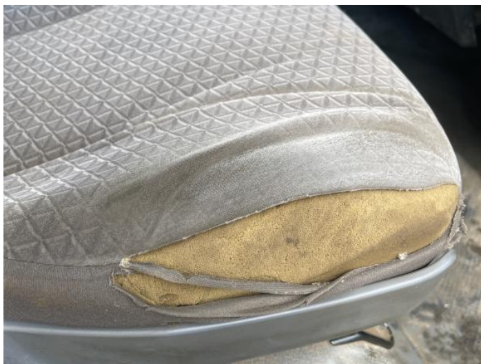
1: Seat Base Cover osf Torn Over 3mm