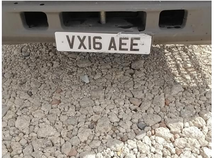
4: Number Plate Front Broken Replace