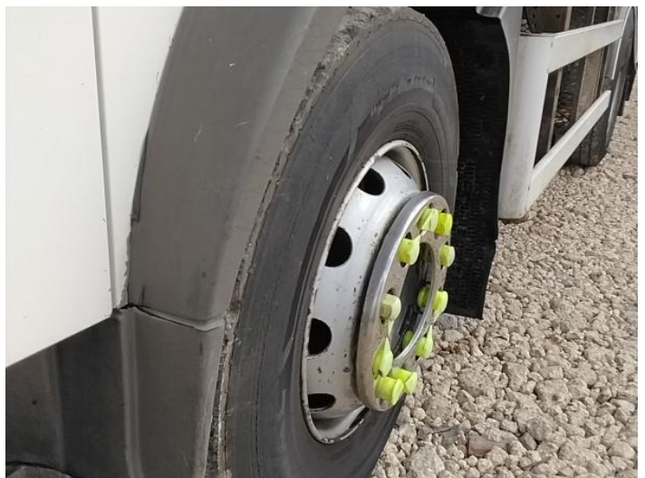
8: Other N/A N/A