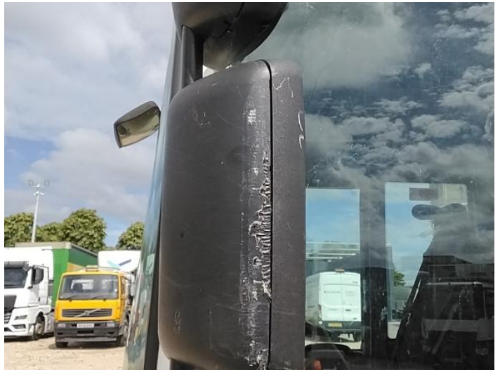
6: Door Mirror Assy nsf Scuffed (Unpainted) UpTo 100mm