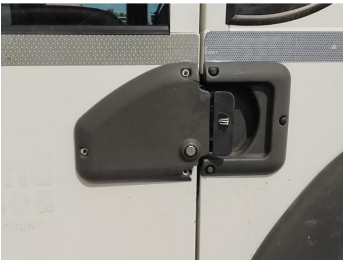
7: Handle Outer nsf Broken Replace