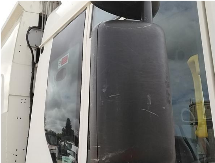
15: Door Mirror Assy osf Scuffed (Unpainted) UpTo 100mm