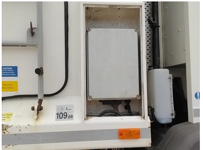
12: Other N/A N/A