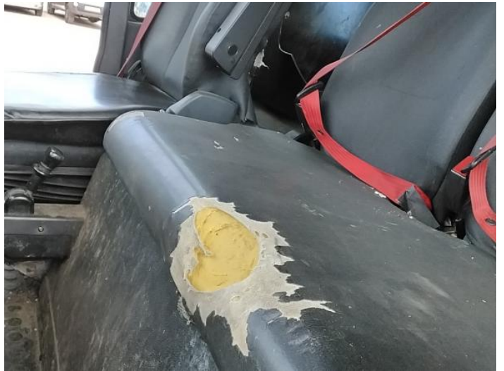
18: Seat Base Cover nsf Holed Over 3mm