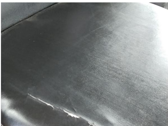
23: Seat Base Cover osf Torn Over 3mm