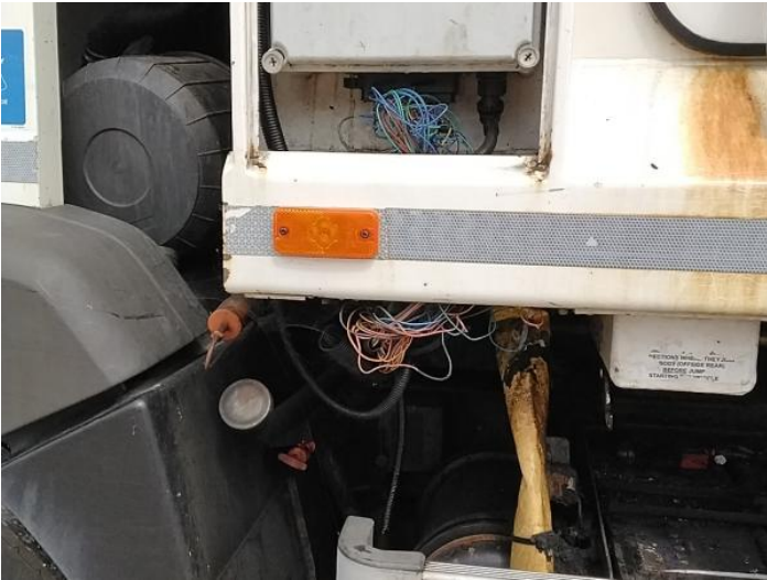
9: Other N/A N/A