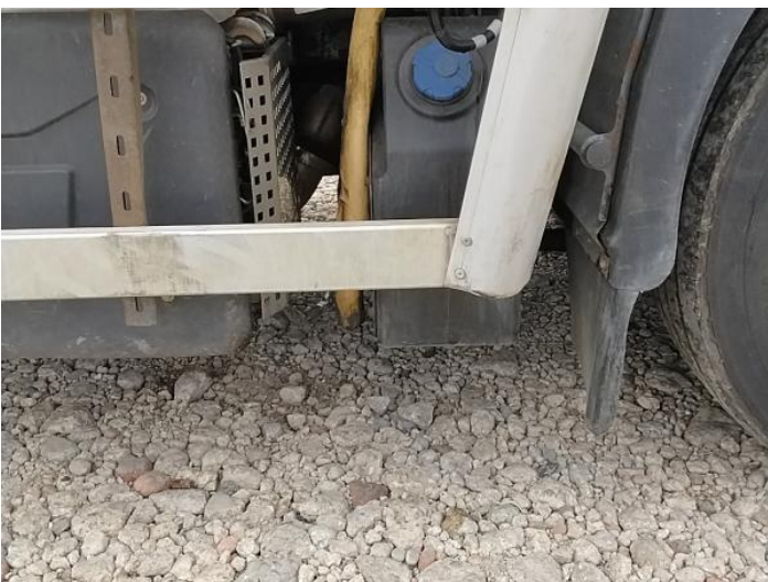
13: Other N/A N/A