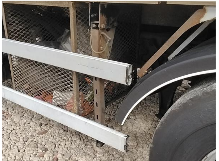
10: Other N/A N/A