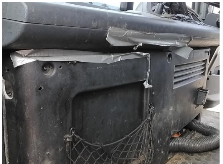
20: Fascia Panel Broken Replace