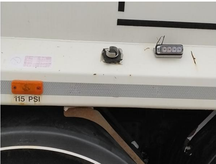
11: Other N/A N/A