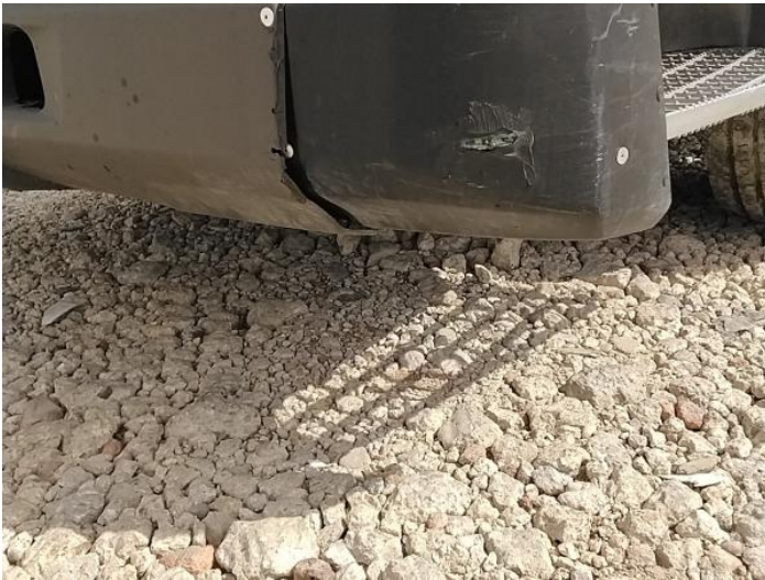
5: Bumper Front Moulding Broken Replace