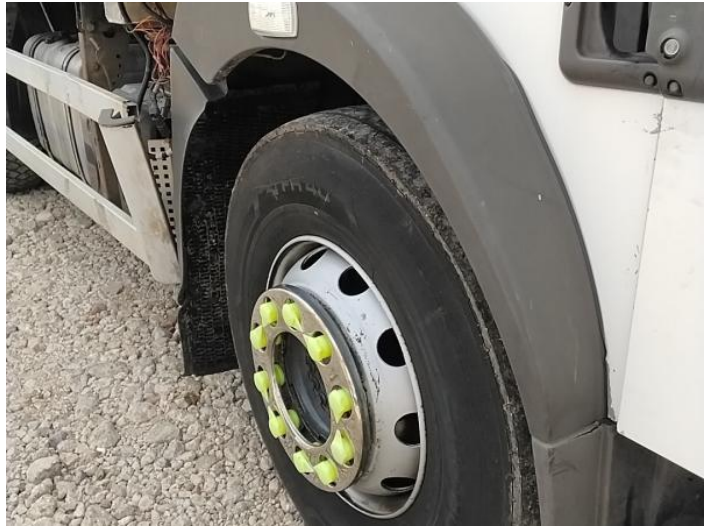
16: Other N/A N/A