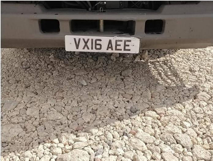
3: Bumper Front Cracked Over 25mm