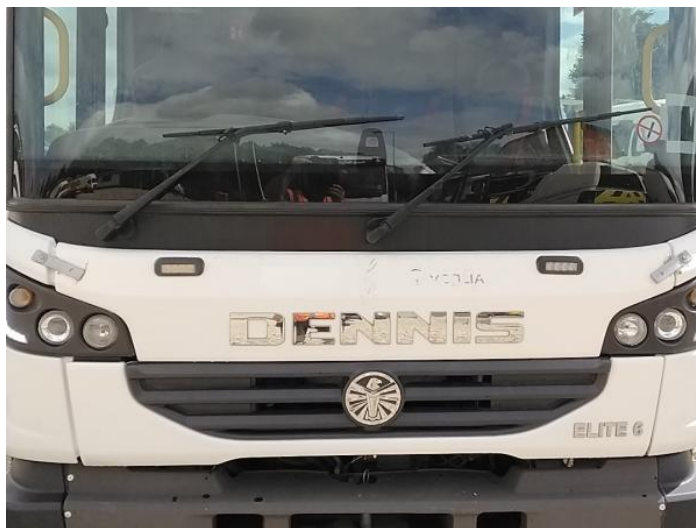
2: Bonnet Scratched UpTo 25mm Thru Paint