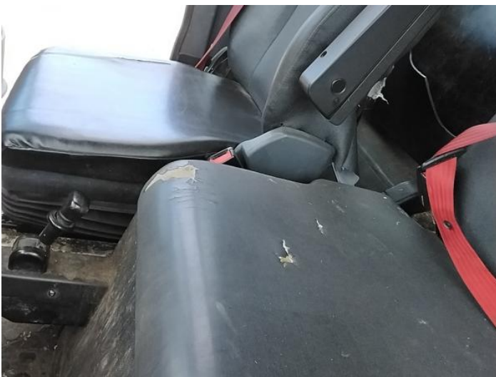
19: Seat Base Cover nsf Holed Over 3mm