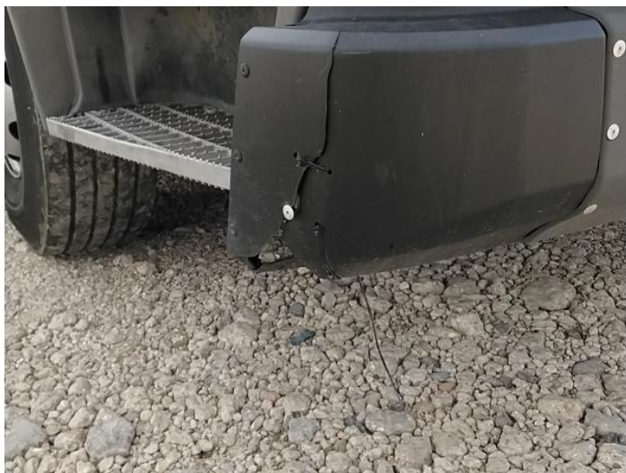
1: Bumper Front Moulding Broken Replace