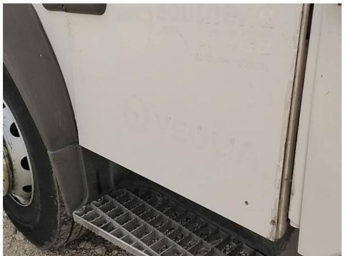
14: Other N/A N/A