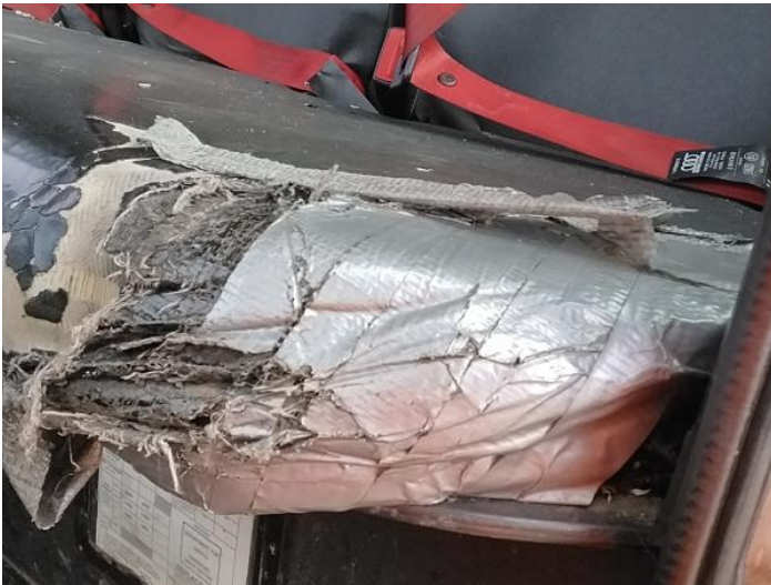
17: Seat Base Cover nsf Torn Over 3mm