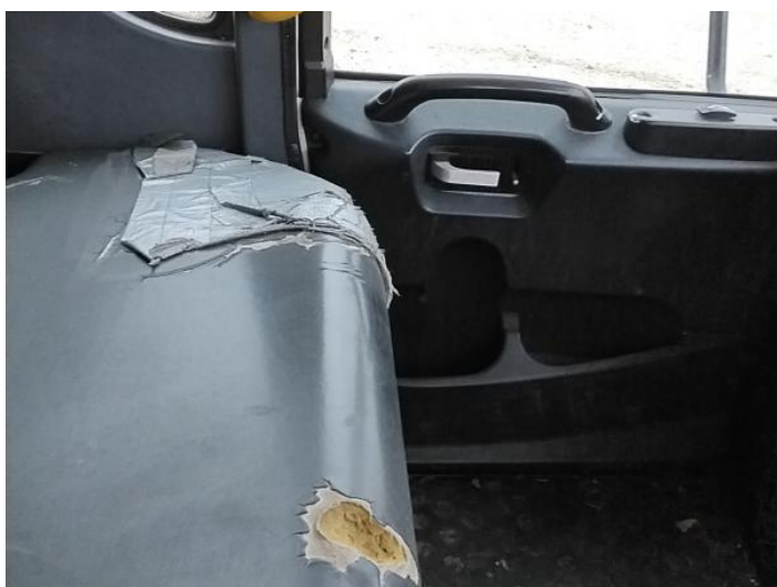
11: Seat Base Cover nsf Torn Over 3mm