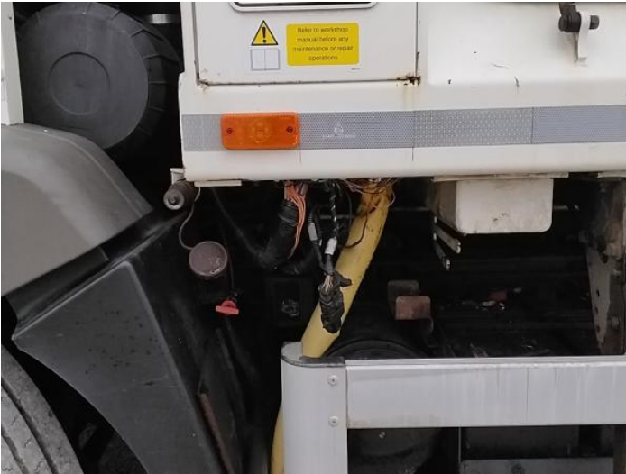
3: Other N/A N/A