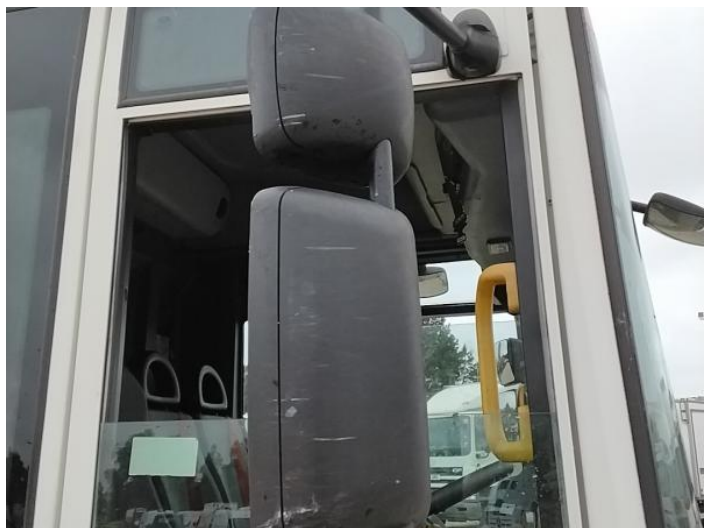
8: Door Mirror Assy osf Scuffed (Unpainted) Over 100mm