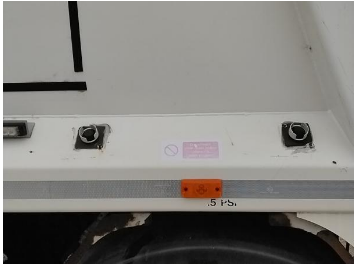
4: Other N/A N/A