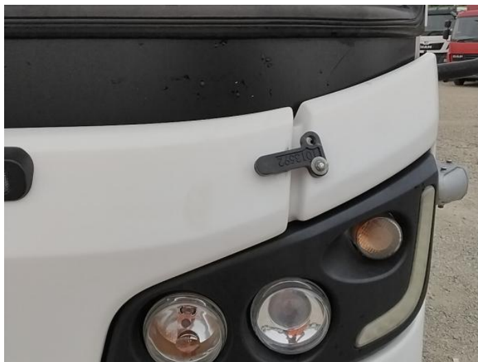
2: Bonnet Poor Previous Repair Poor Colour