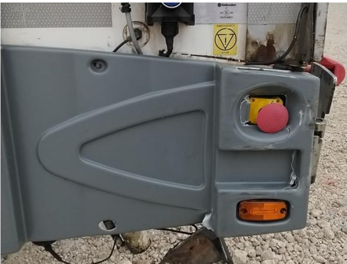
5: Other N/A N/A