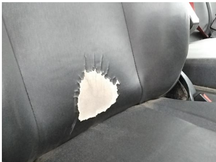
10: Seat Back Cover osf Torn Over 3mm