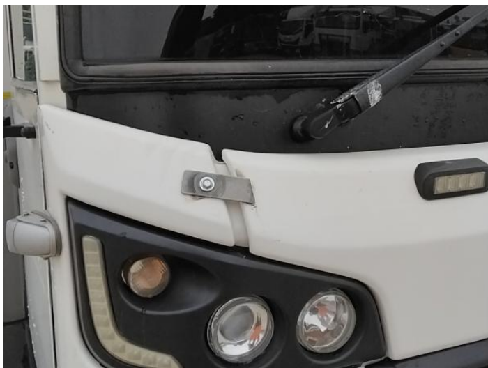
1: Bonnet Poor Previous Repair Poor Colour