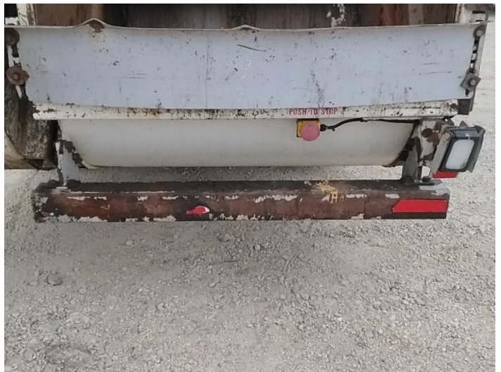
6: Bumper Rear Rusted Over 5mm