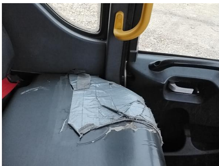
12: Seat Base Cover nsf Torn Over 3mm