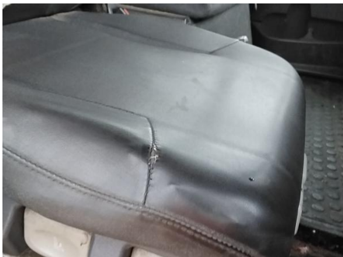
9: Seat Base Cover osf Torn Over 3mm