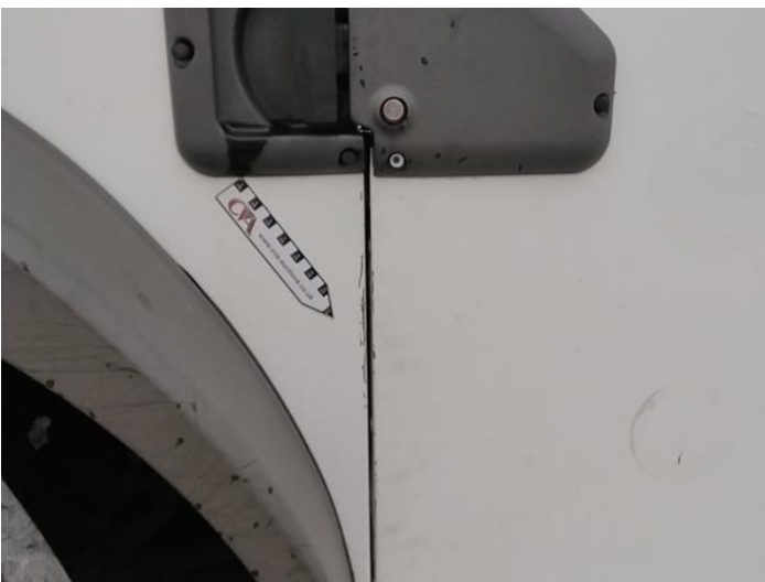
7: Door osf Chipped Edge Chip