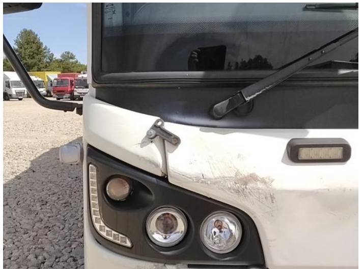
2: Moulding of Wing Scratched (Painted) Over 25mm Thru Paint