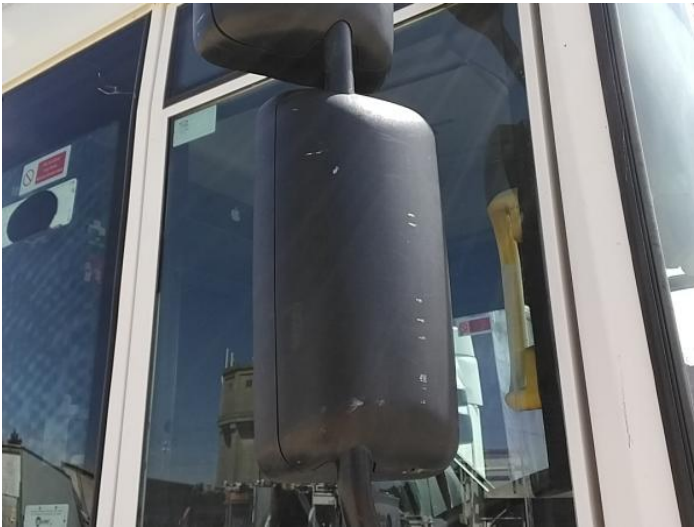
11: Door Mirror Assy osf Scuffed (Unpainted) Over 100mm