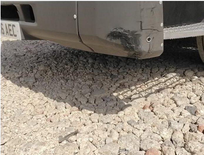
5: Bumper Front Poor Previous Repair Poor Paint