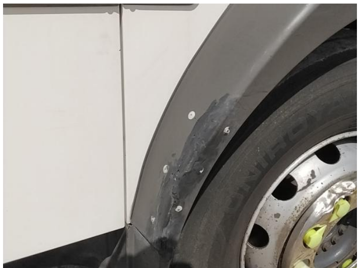
8: Other N/A N/A