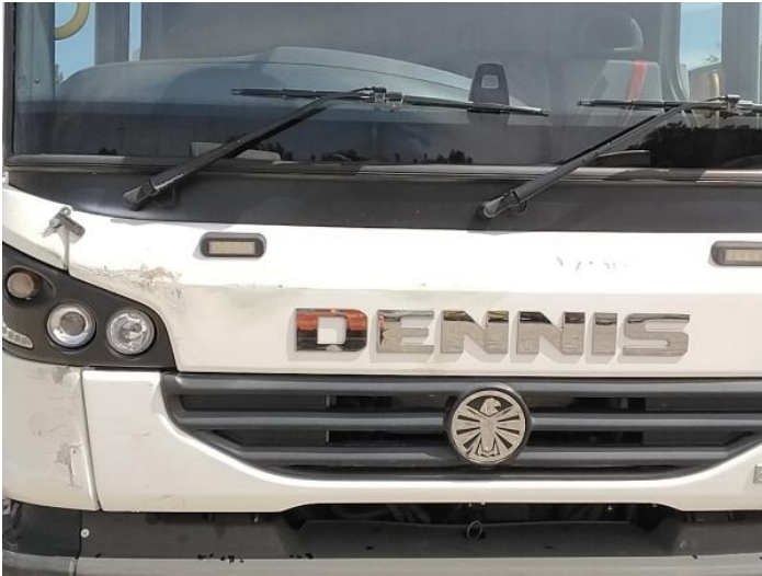
3: Bonnet Poor Previous Repair Poor Colour