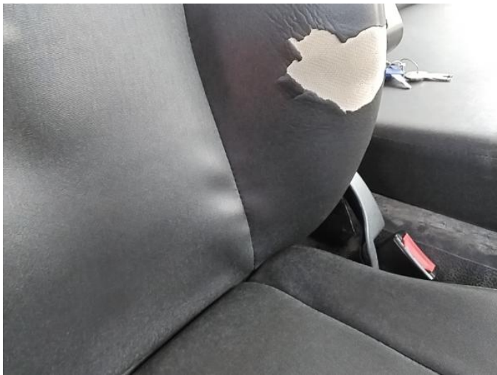
15: Seat Back Cover osf Torn Over 3mm