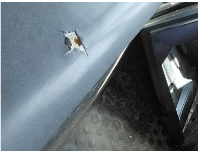
13: Seat Base Cover nsf Holed Over 3mm