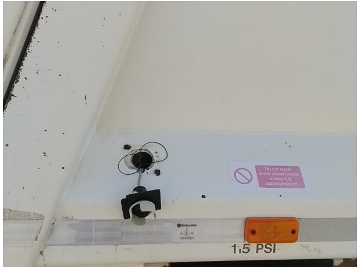
10: Other N/A N/A