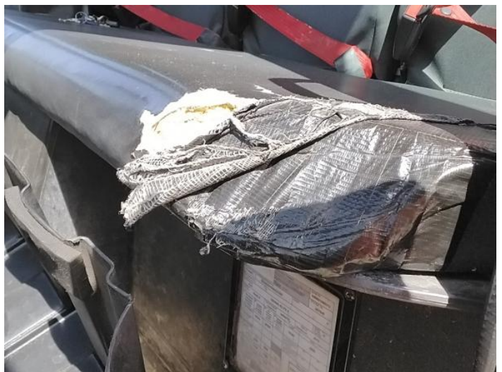
14: Seat Base Cover nsf Holed Over 3mm