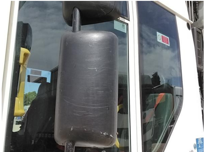
6: Door Mirror Assy nsf Scuffed (Unpainted) Over 100mm