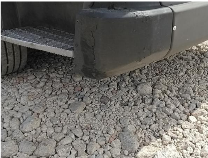
1: Bumper Front Poor Previous Repair Poor Paint