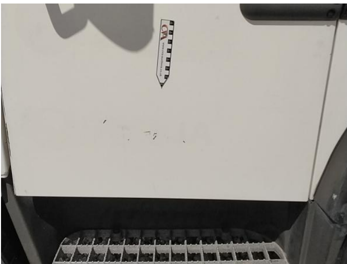
7: Door nsf Scratched Over 25mm Thru Paint