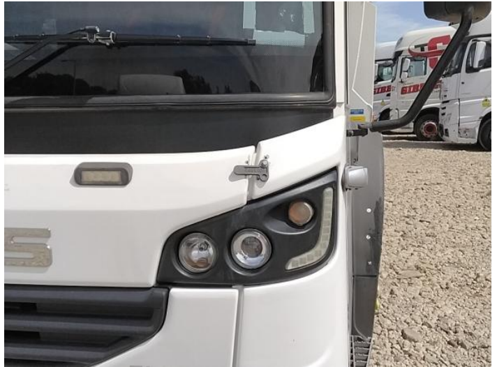
4: Bonnet Poor Previous Repair Poor Paint