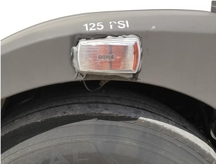
9: Flasher Side Repeater ns Broken Replace