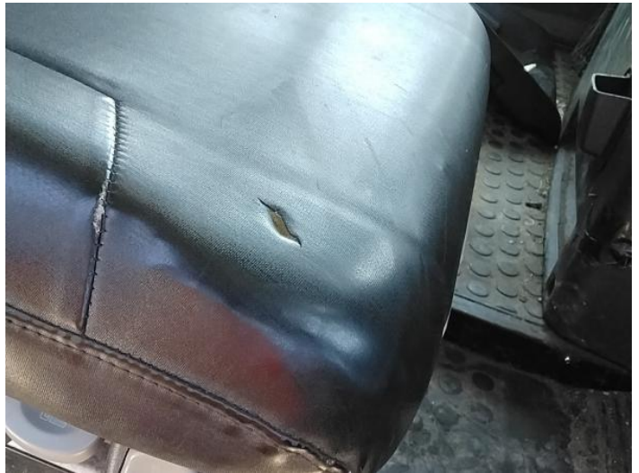
12: Seat Base Cover osf Torn Over 3mm