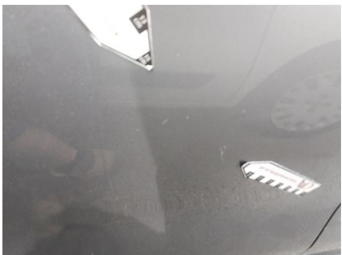
18: Qtr Panel osr Scratched Over 25mm Thru Paint