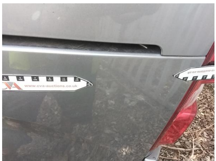
10: Qtr Panel nsr Scratched Over 25mm Thru Paint