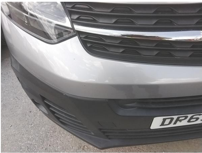
2: Panel Front Chipped Multiple Chips