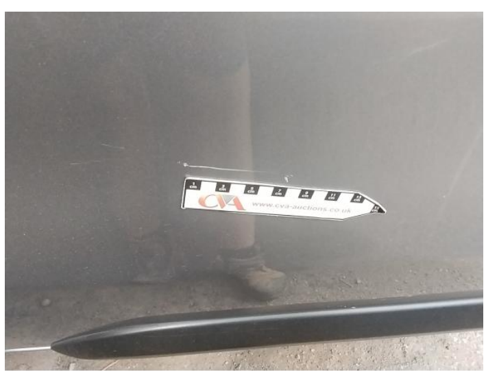
16: Qtr Panel osr Scratched Over 25mm Thru Paint