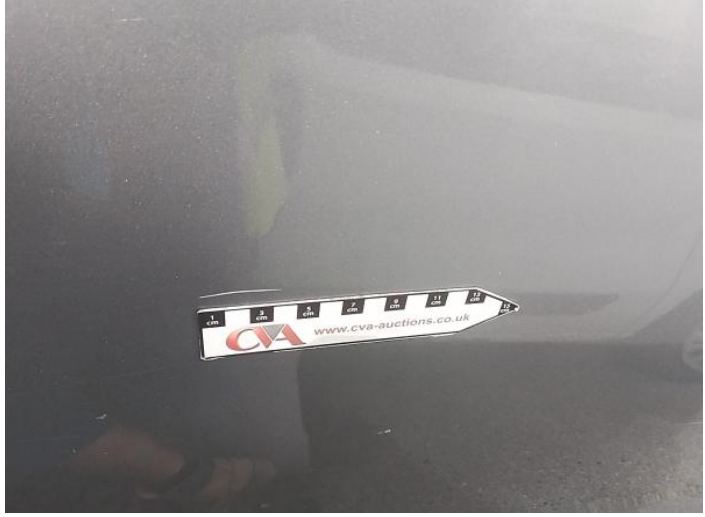
14: Qtr Panel osr Scratched Over 25mm Thru Paint