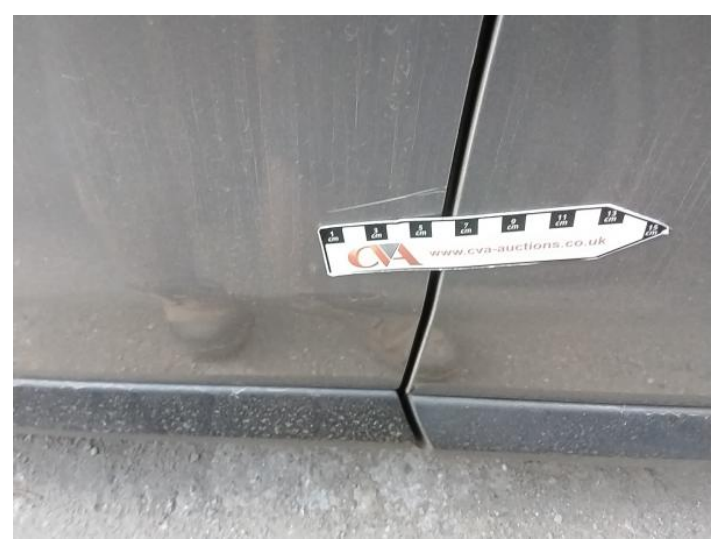
5: Door nsf Scratched Over 25mm Thru Paint