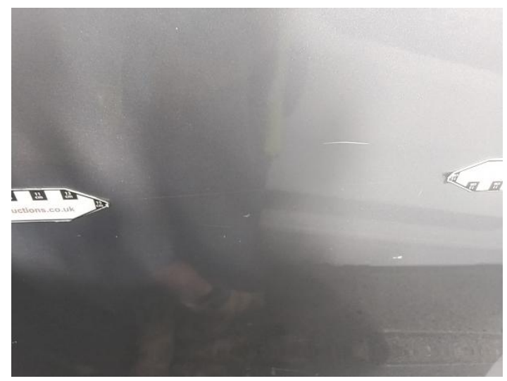
15: Qtr Panel osr Scratched Over 25mm Thru Paint