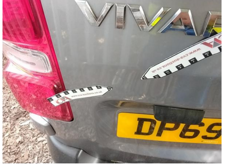
11: Door nsr Dented Over 30mm