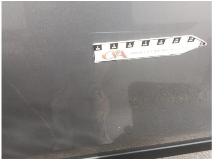
17: Qtr Panel osr Scratched Over 25mm Thru Paint