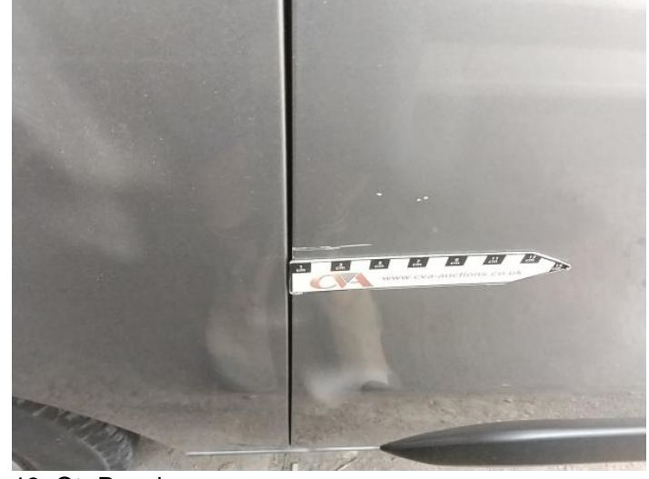
13: Qtr Panel osr Scratched Over 25mm Thru Paint