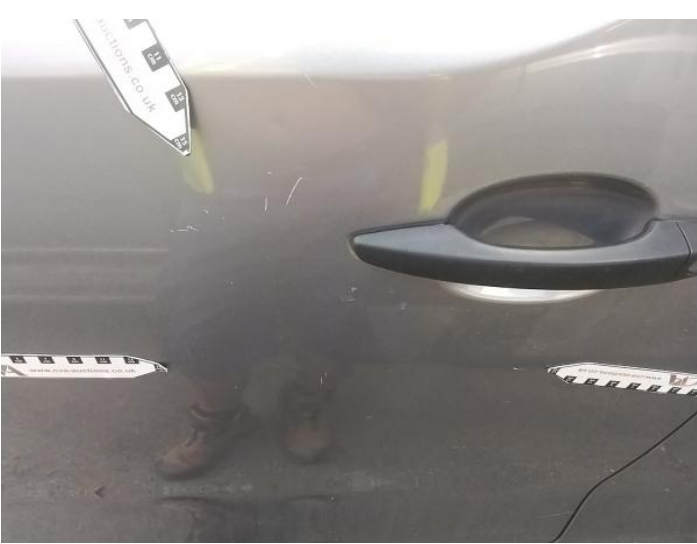
4: Door nsf Scratched Over 25mm Thru Paint