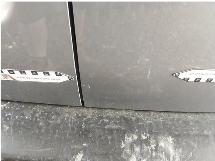
12: Door osr Scratched Over 25mm Thru Paint