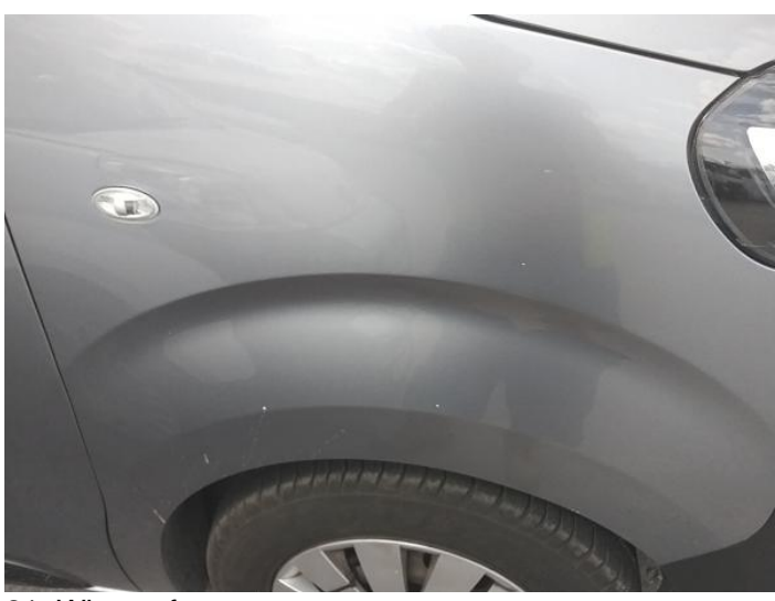
21: Wing osf Chipped Multiple Chips