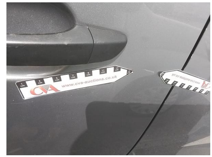
19: Qtr Panel osr Dented With Paint Damage