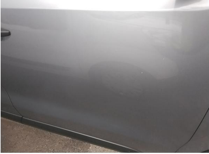
20: Door osf Chipped Multiple Chips