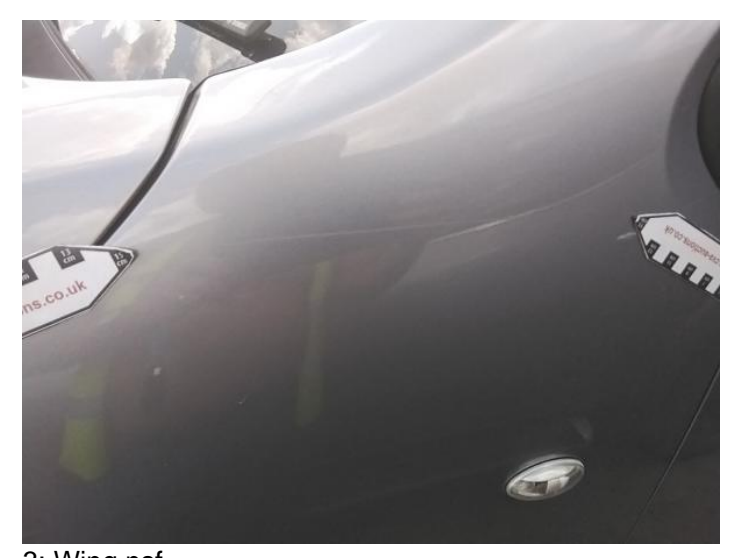
3: Wing nsf Scratched Over 25mm Not Thru Paint