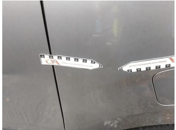
7: Qtr Panel nsr Dented Over 30mm