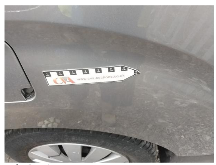
9: Qtr Panel nsr Scratched Over 25mm Thru Paint