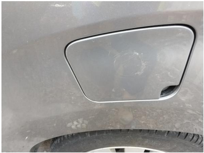
8: Fuel Flap Scratched Over 25mm Thru Paint