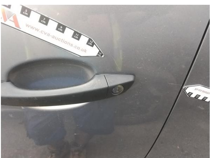
6: Door nsf Scratched Over 25mm Thru Paint