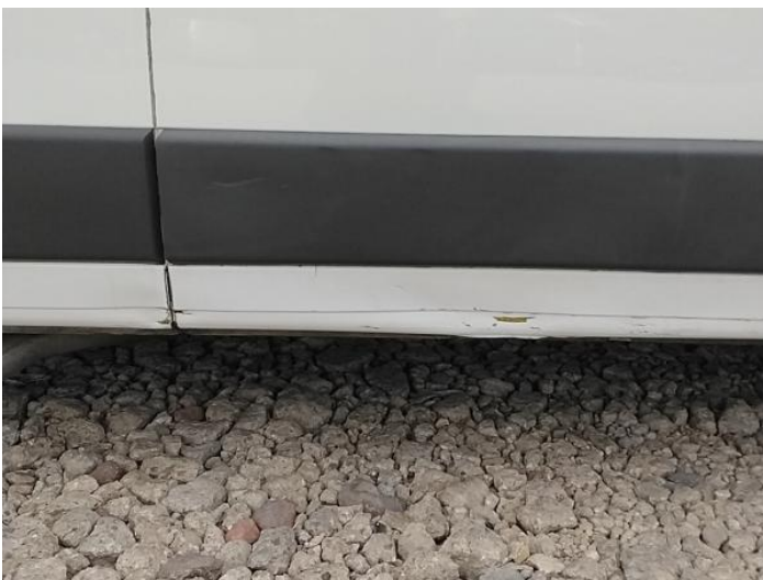
7: Sill os Dented With Paint Damage