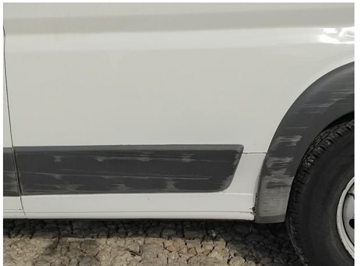
6: Qtr Panel nsr Dented With Paint Damage