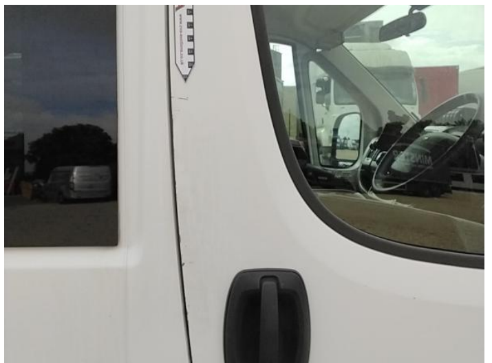
8: Door osf Scratched Over 25mm Thru Paint