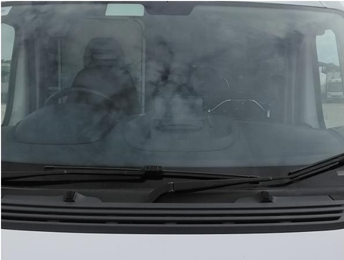
3: Screen Front Chipped Over 10mm