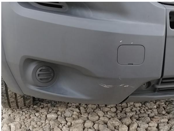
1: Bumper Front Scratched Over 25mm Not Thru Paint