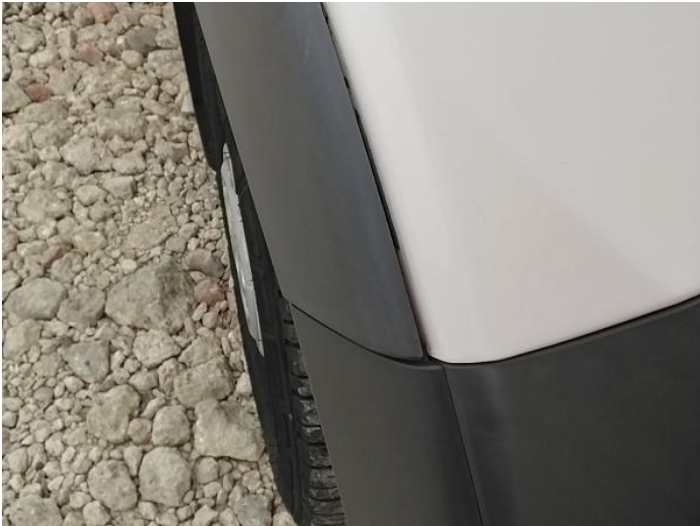
9: Moulding of Wing Broken Replace