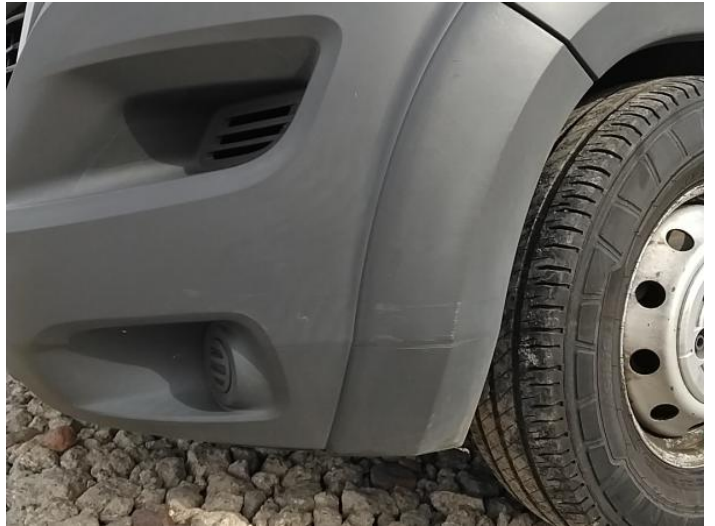
4: Bumper Front Scratched Over 25mm Not Thru Paint