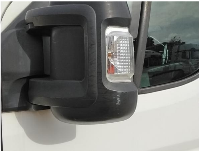
5: Door Mirror Assy nsf Scuffed (Unpainted) UpTo 100mm