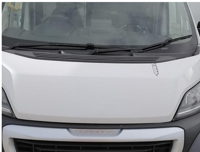
2: Bonnet Chipped Multiple Chips