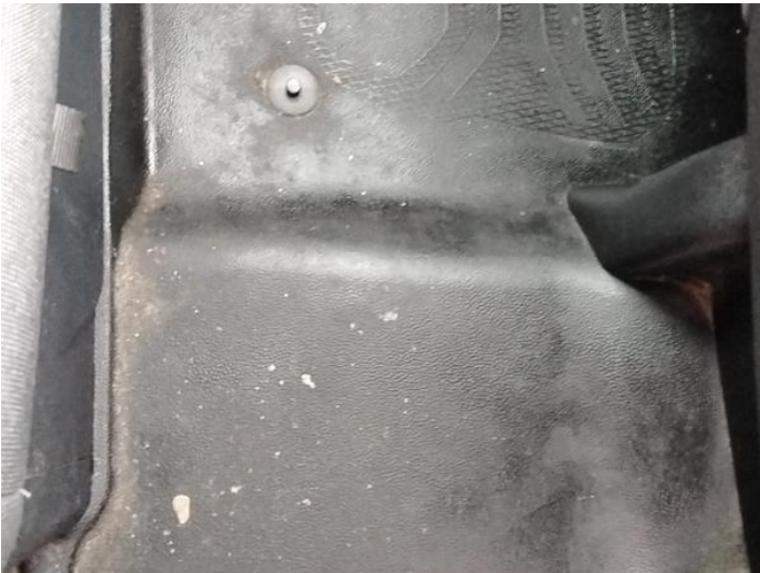
1: Carpets Front Soiled Heavy